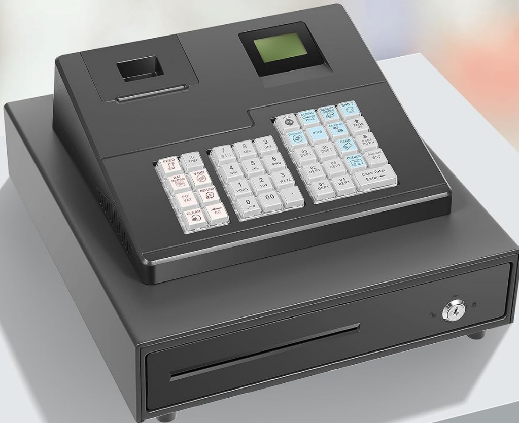
Figure 5: The ECR600 supports a large capacity for managing sales, including 32 departments, 10 clerks, and 1000 PLUs.