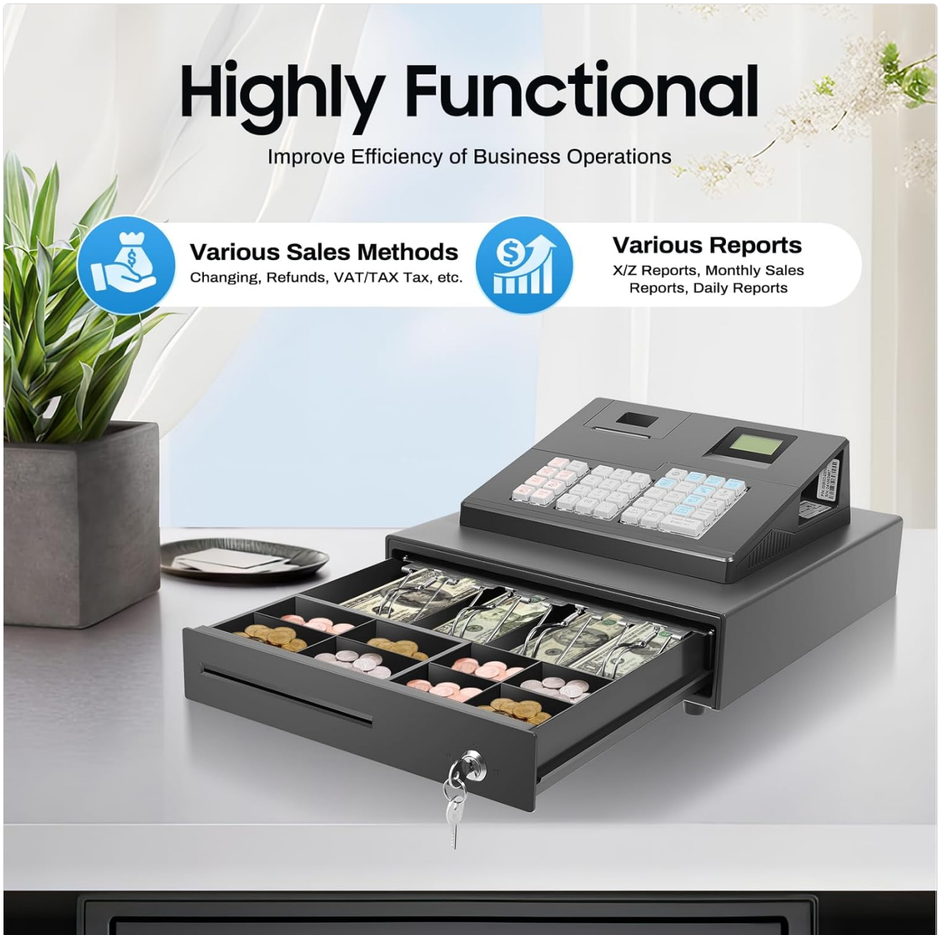
Figure 4: Illustration of the cash register's capabilities, including various sales methods like price changes and refunds, and report generation.

X/Z Reports, Monthly Sales Reports, Daily Reports