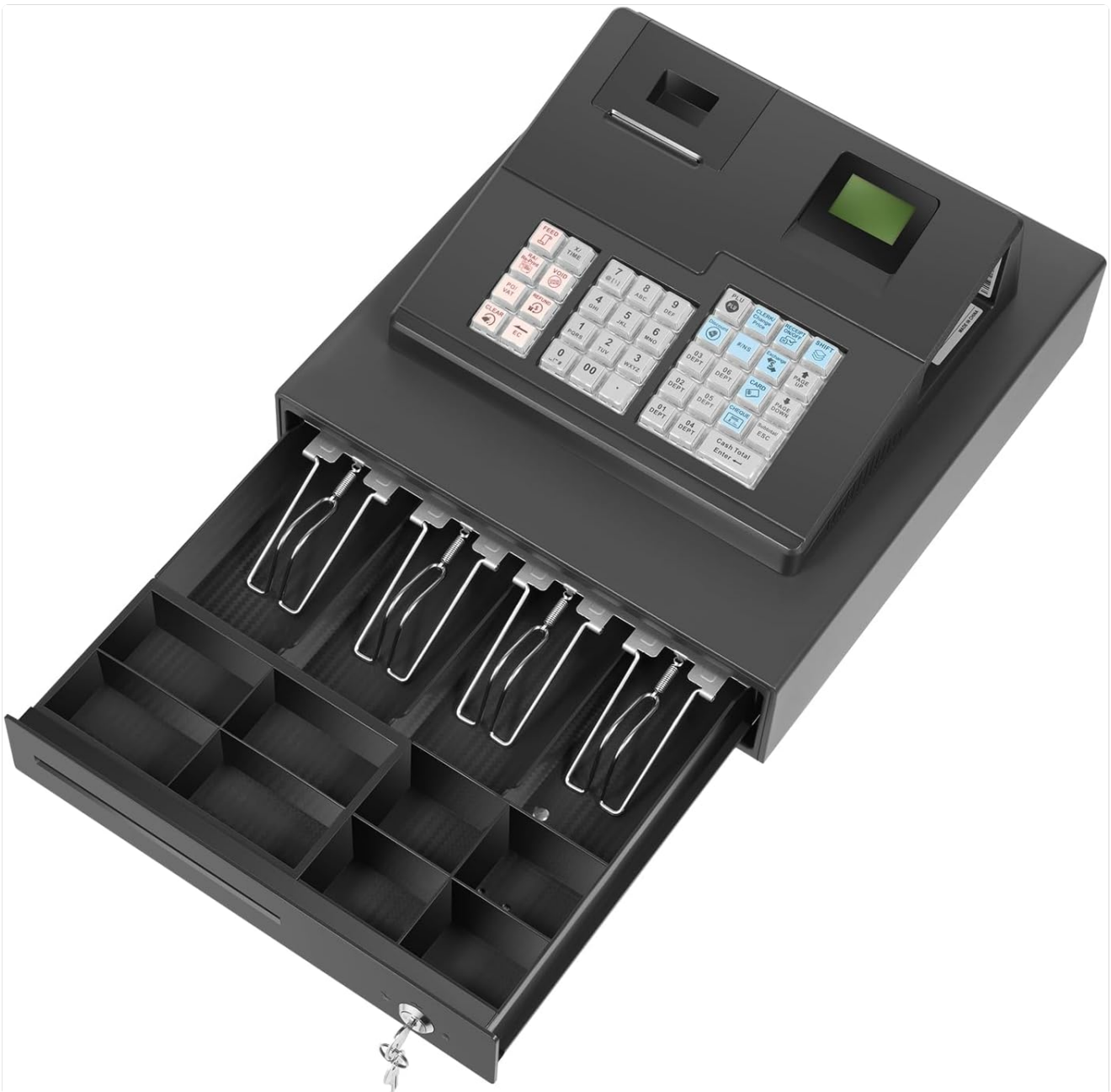
Figure 1: ECR600 Electronic Cash Register with its cash drawer open, showing compartments for bills and coins.