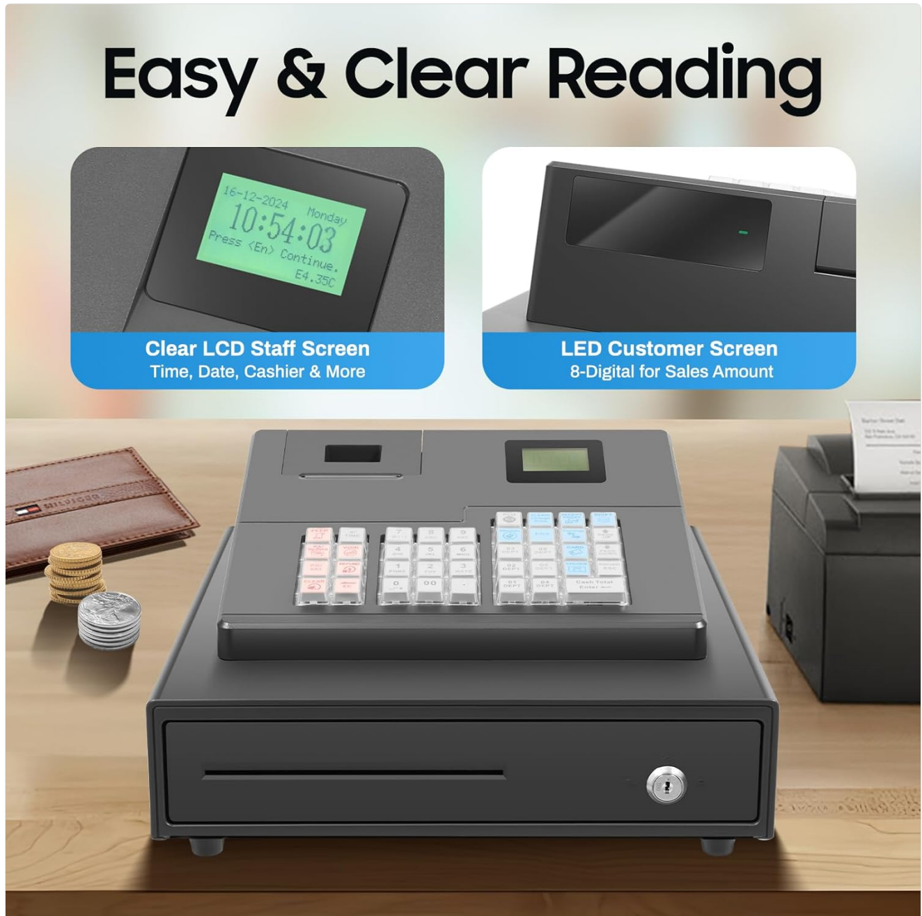
Figure 3: View of the employee LCD screen showing time and date, and the customer 8-digit LED screen for transaction amounts.