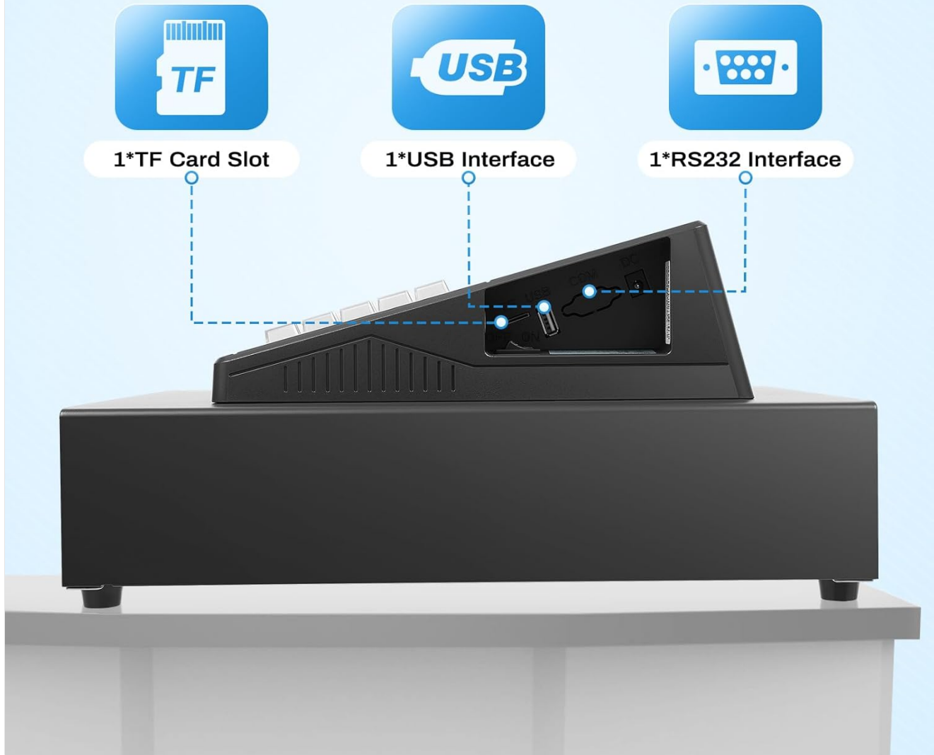
Figure 7: Overview of the available interfaces for connecting the cash register to external devices.