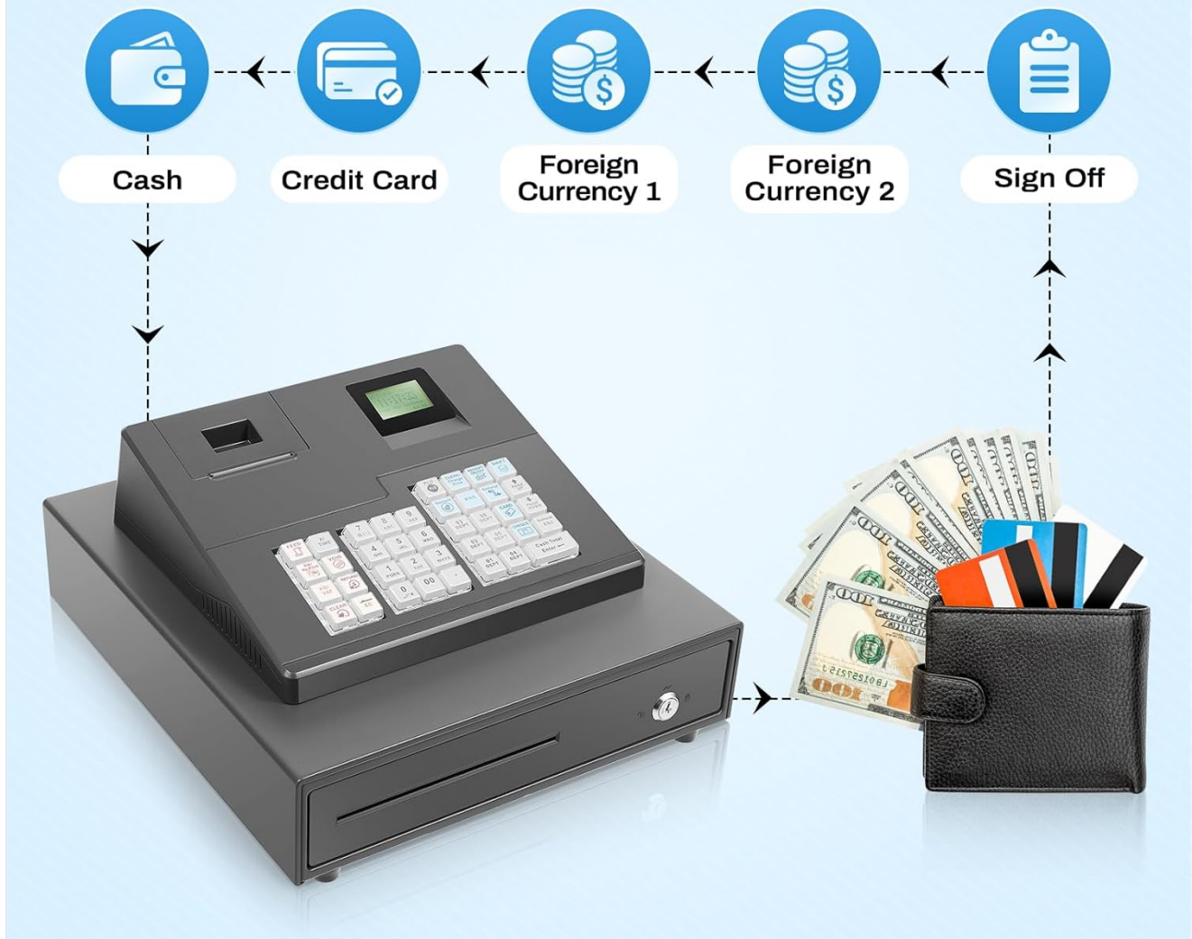
Figure 6: Visual representation of the five payment options available on the ECR600 cash register.