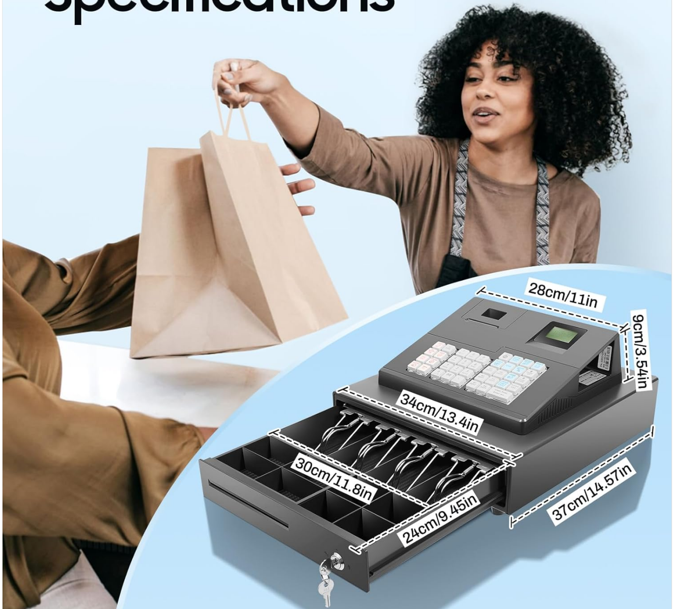
Figure 8: Dimensional overview of the ECR600 Electronic Cash Register.