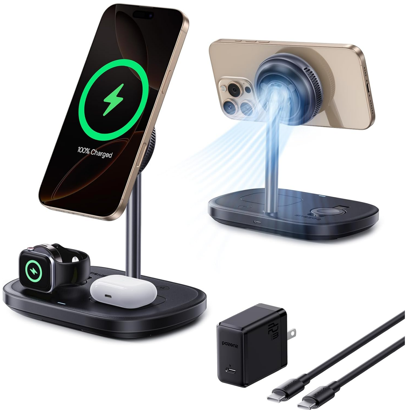
Image: The Baseus 3-in-1 Wireless Charger Stand with an iPhone, Apple Watch, and AirPods placed on their respective charging areas, demonstrating simultaneous charging.