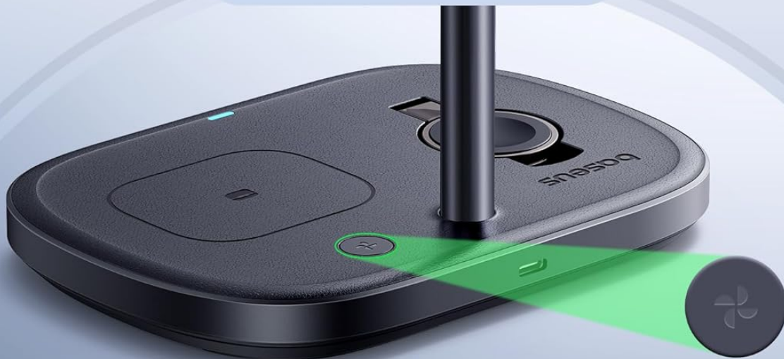
Image: A close-up of the charging stand's base, highlighting the fan control button with a fan icon, and indicating a 70-degree vertical adjustment for the phone charging arm.

CryoCore Button Control One tap to turn off cooling for instant silence