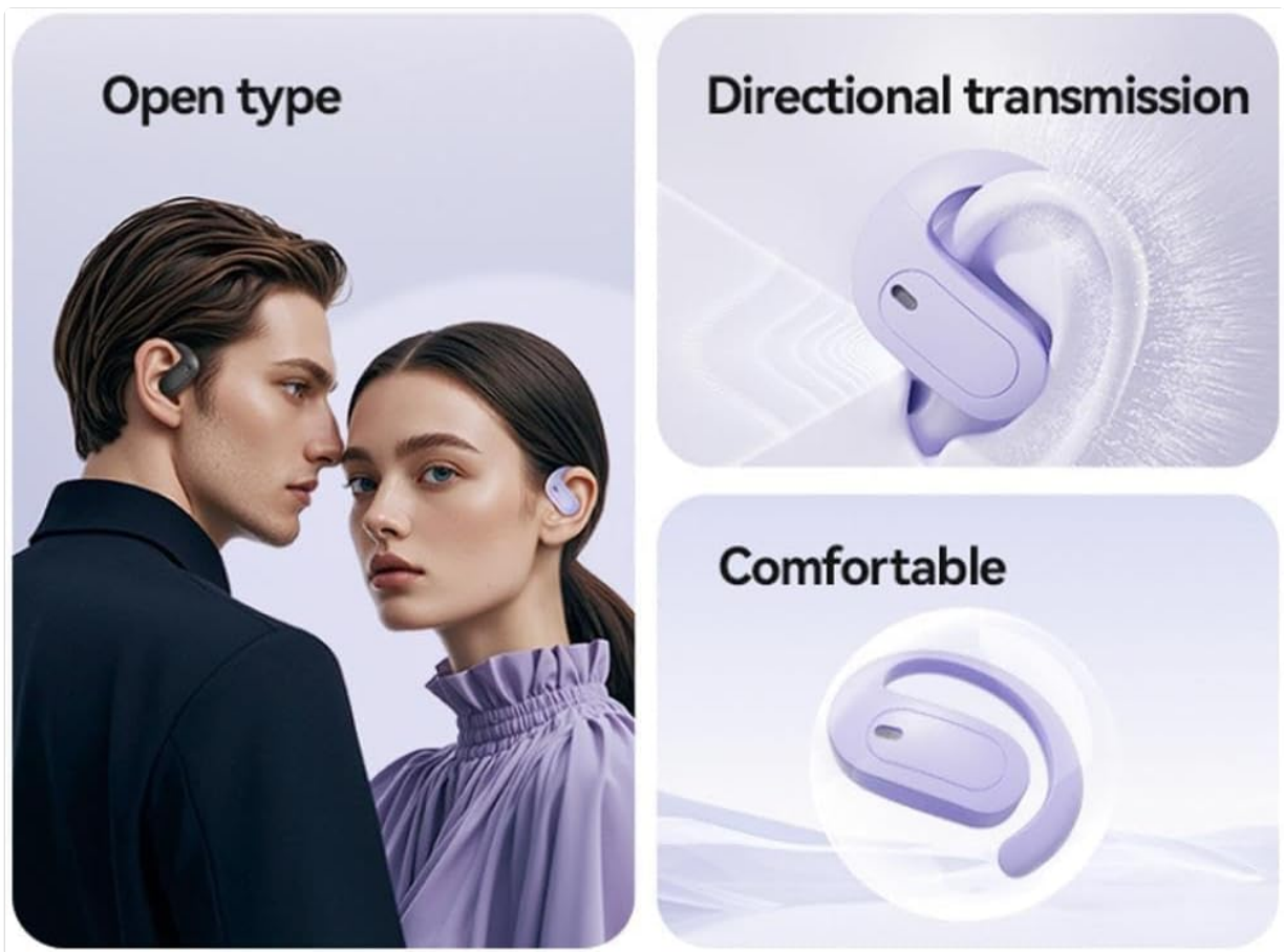
Figure 3: Illustration of the open-type earbud design, highlighting directional sound transmission for clear audio while maintaining environmental awareness, and emphasizing comfortable wear.