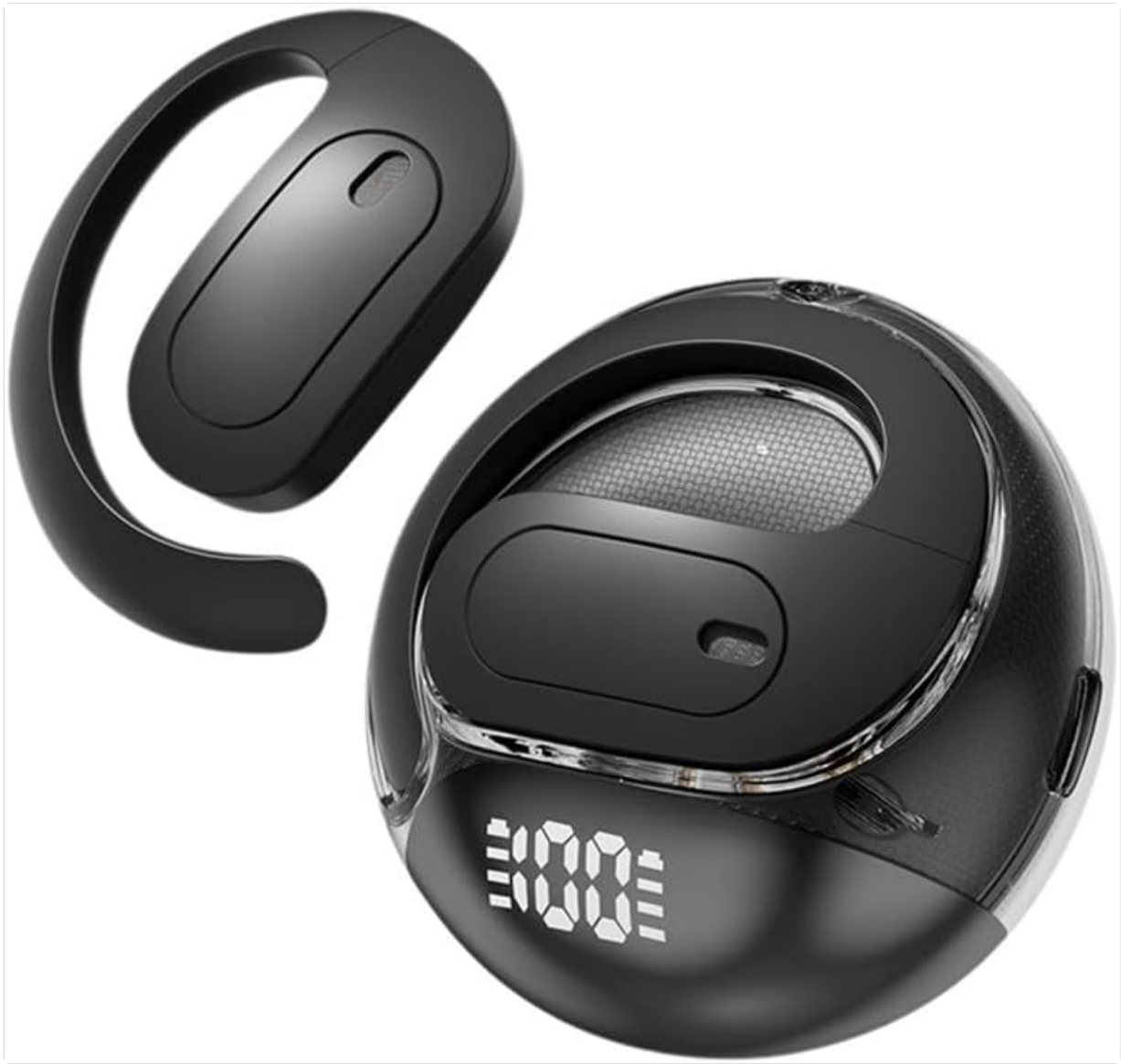
Figure 1: The Generic M112 AI Smart Translation Earbuds and their compact charging case. The earbuds feature an open-ear design for comfort.