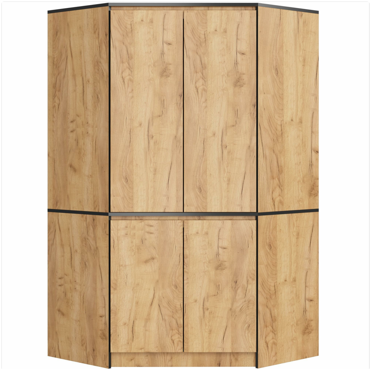
Image 1.1: The AKORD S100 Corner Wardrobe integrated into a bedroom, showcasing its space-saving design and Craft Oak finish.