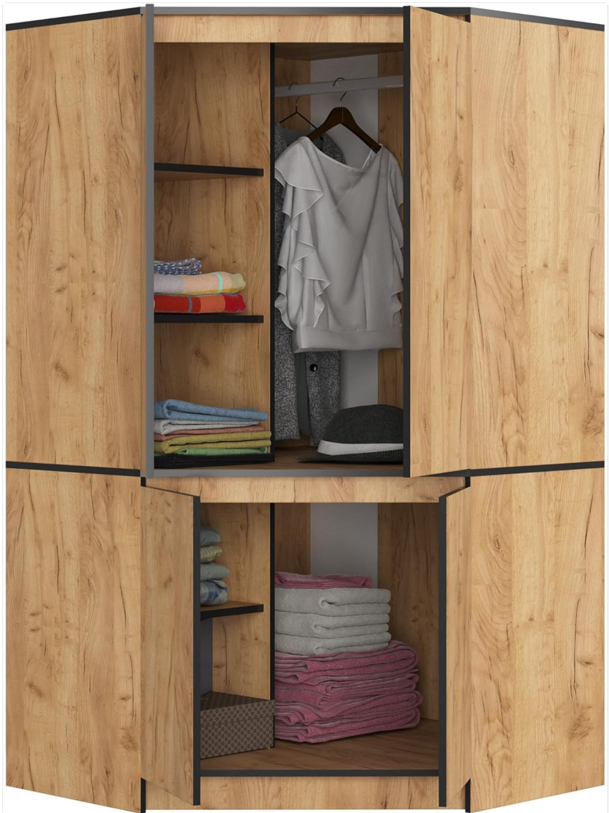
Image 4.2: Detailed view of the wardrobe's interior, highlighting the sturdy shelves and hanging space.