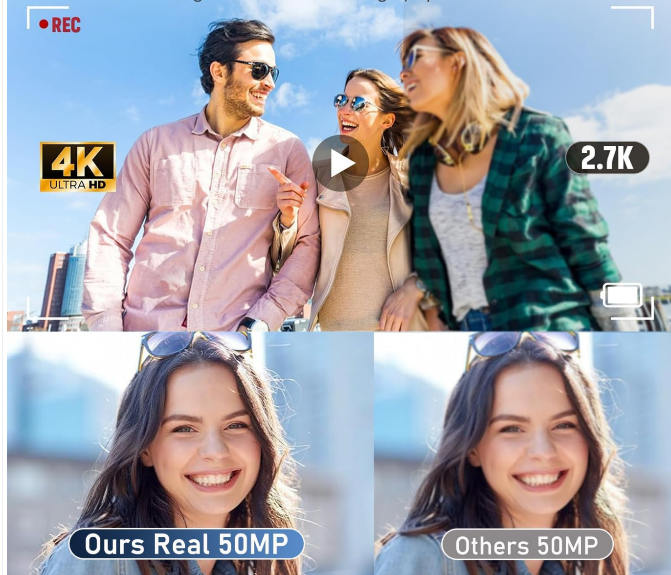
Figure 6: Example of 4K video and 50MP photo capability.

Your First Digital Camera for Photography and Video Creation