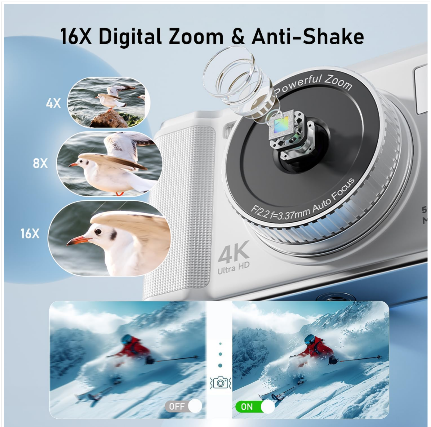
Figure 7: Demonstrating 16x digital zoom and anti-shake feature.