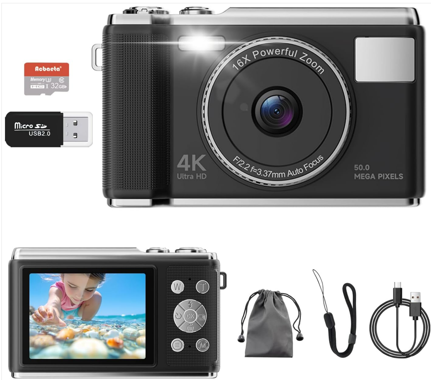
Figure 1: Front view of the Acbaeta 4K Digital Camera X8 Pro.