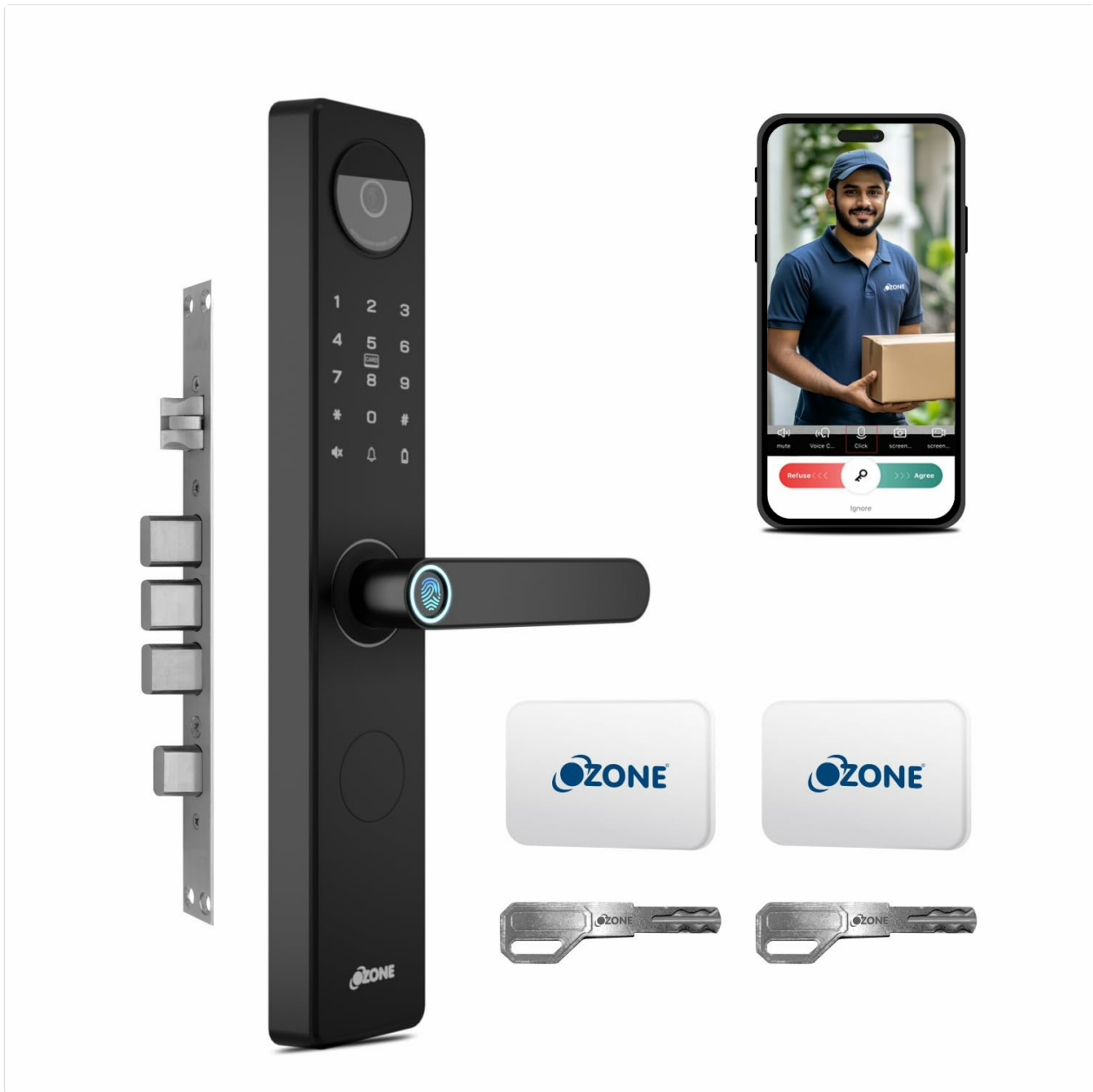
Image: Overview of the Ozone Elite HD Camera Smart Door Lock and its included components.