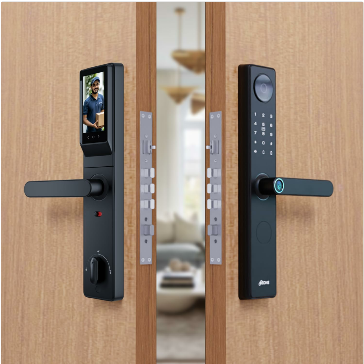
Image: The smart door lock fully installed on a wooden door, showcasing its sleek design.