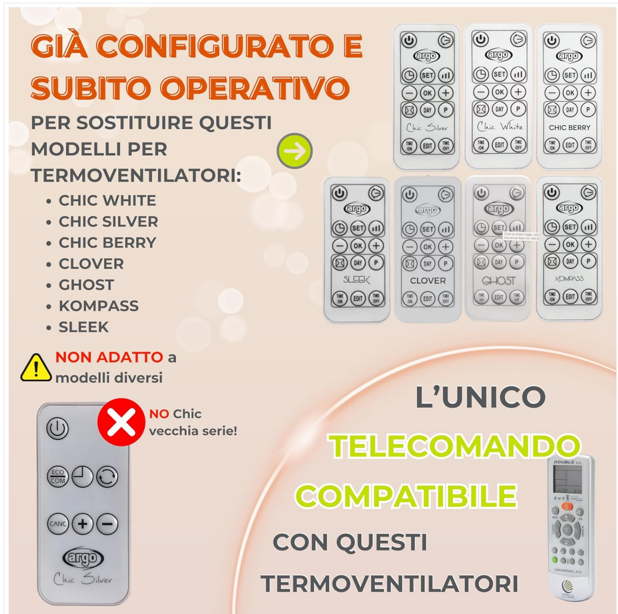
Image 2: Visual guide illustrating compatible Argo fan heater remote controls (Chic White, Chic Silver, Chic Berry, Sleek, Clover, Ghost, Kompass) and an incompatible older Chic model.

This remote control is not compatible with other models not listed above.