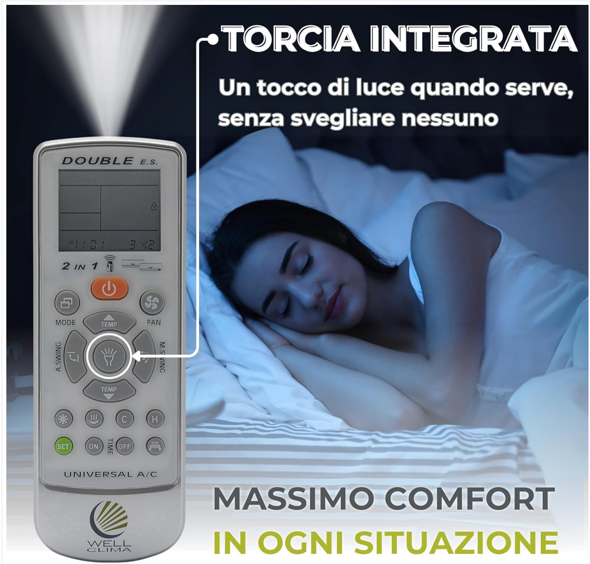
Image 5: The remote control's integrated flashlight illuminating a dark room, demonstrating its utility for nighttime use.

The remote control includes an integrated flashlight, useful for navigating in low-light conditions without disturbing others. This feature provides a convenient light source when needed.