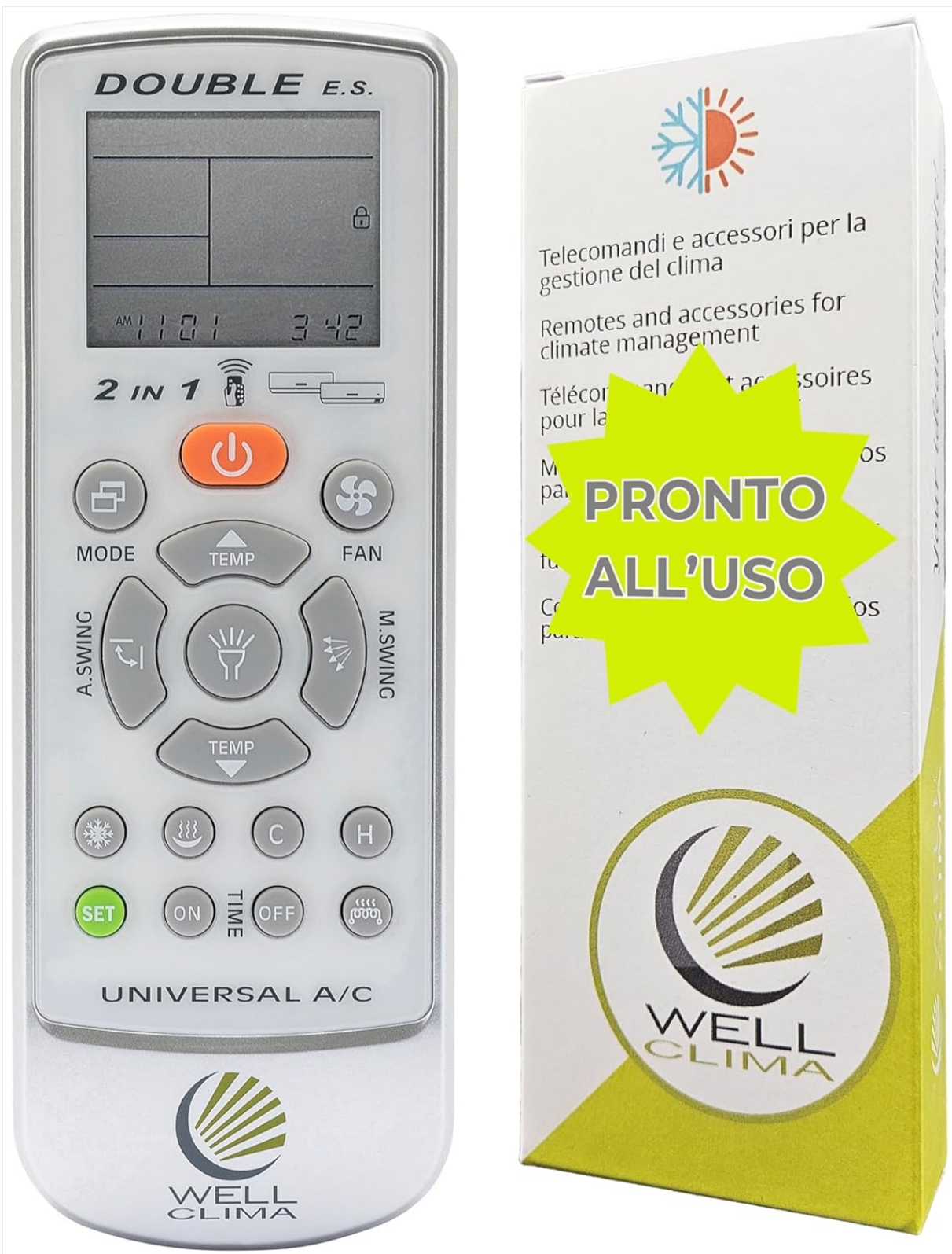
Image 1: Wellclima remote control and its retail packaging, indicating "Ready to Use".