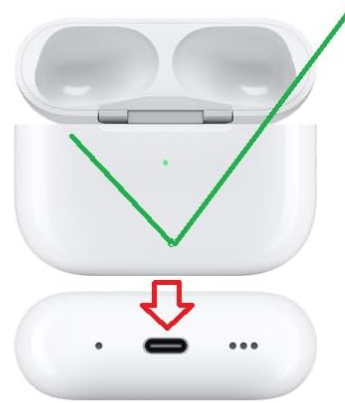
AirPod Pro 2nd Gen (A2968) with USB-C port