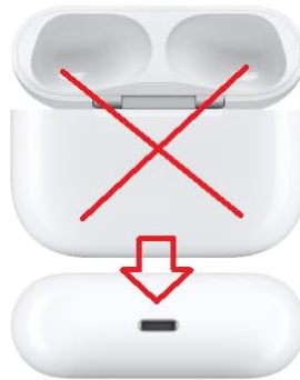
AirPod Pro 1st Gen (A2190)

Image: A visual comparison highlighting the physical differences, such as the number of holes, between AirPod Pro and AirPod Pro 2 earbuds.