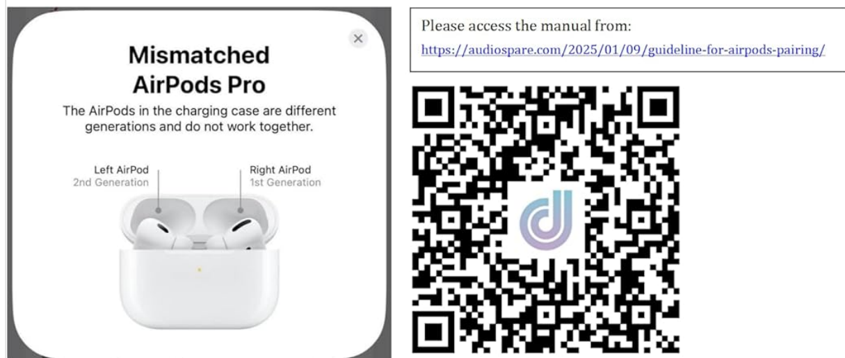
Image: A comprehensive guide detailing the steps for pairing the replacement earbud, including forgetting the device, charging, resetting, and connecting.

Note: Please follow the manual above to pair both earbuds. Then the error message “Mismatched AirPods Pro” below will be fixed. The error message is a bug in AirPods.