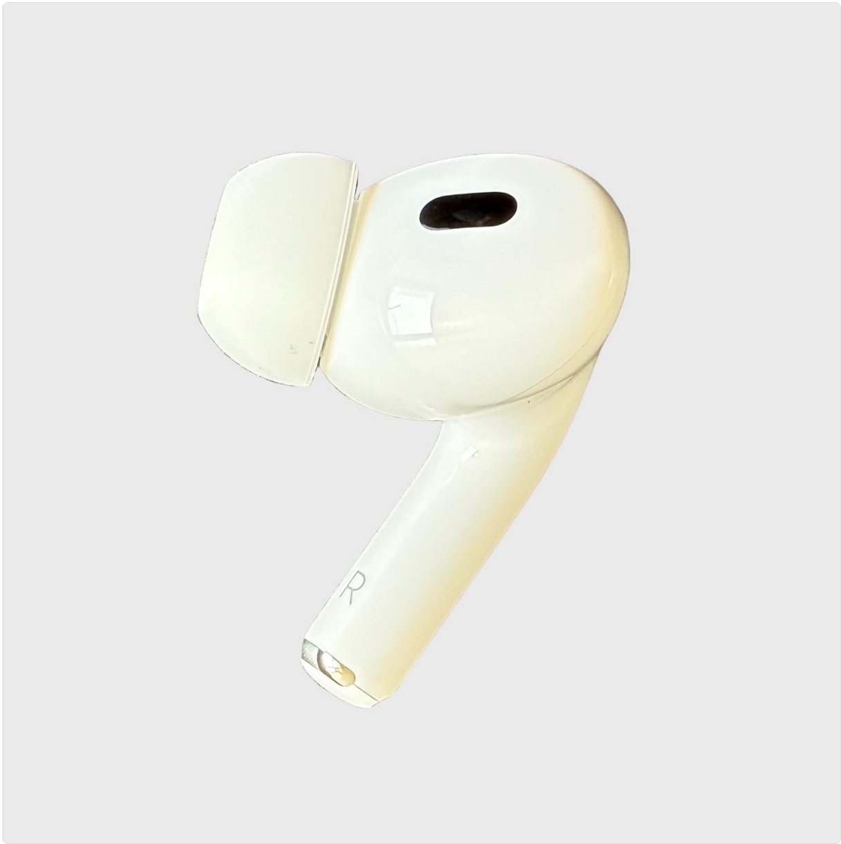
Image: The Meenova OEM Right Earbud Replacement for AirPods Pro (2nd Generation).