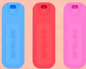
Belt clip *3