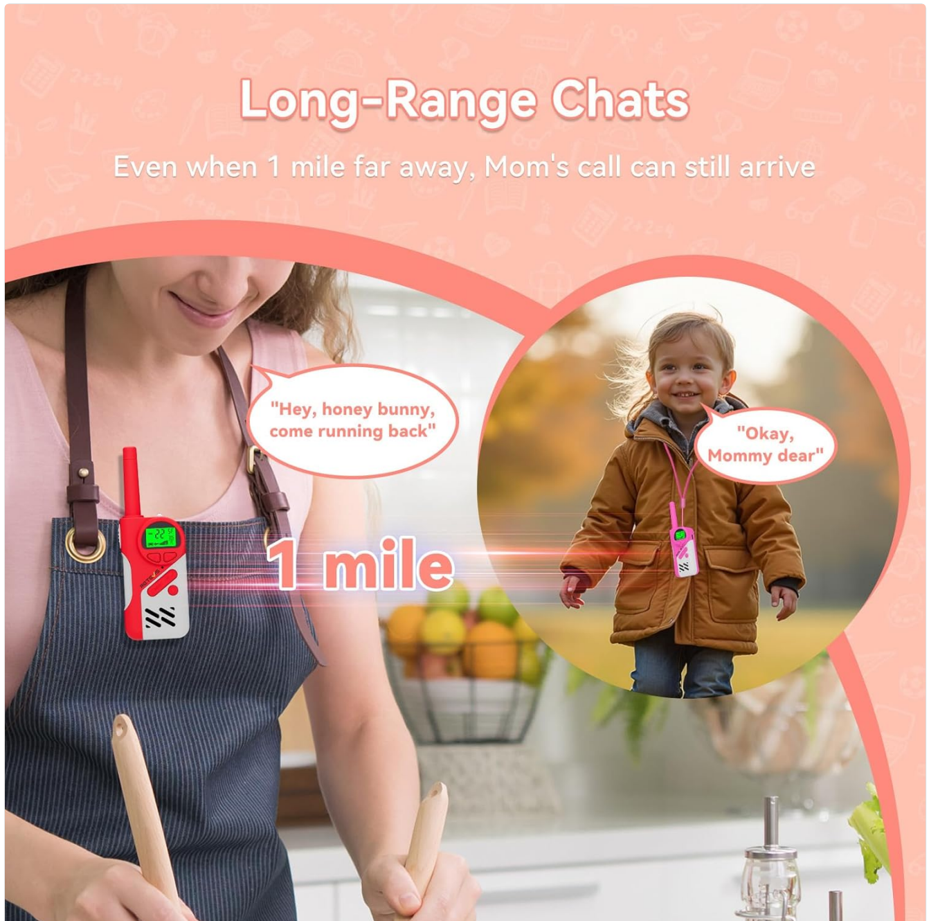
Image: A mother and child using walkie-talkies to communicate over a distance of 1 mile, demonstrating the long-range chat capability.