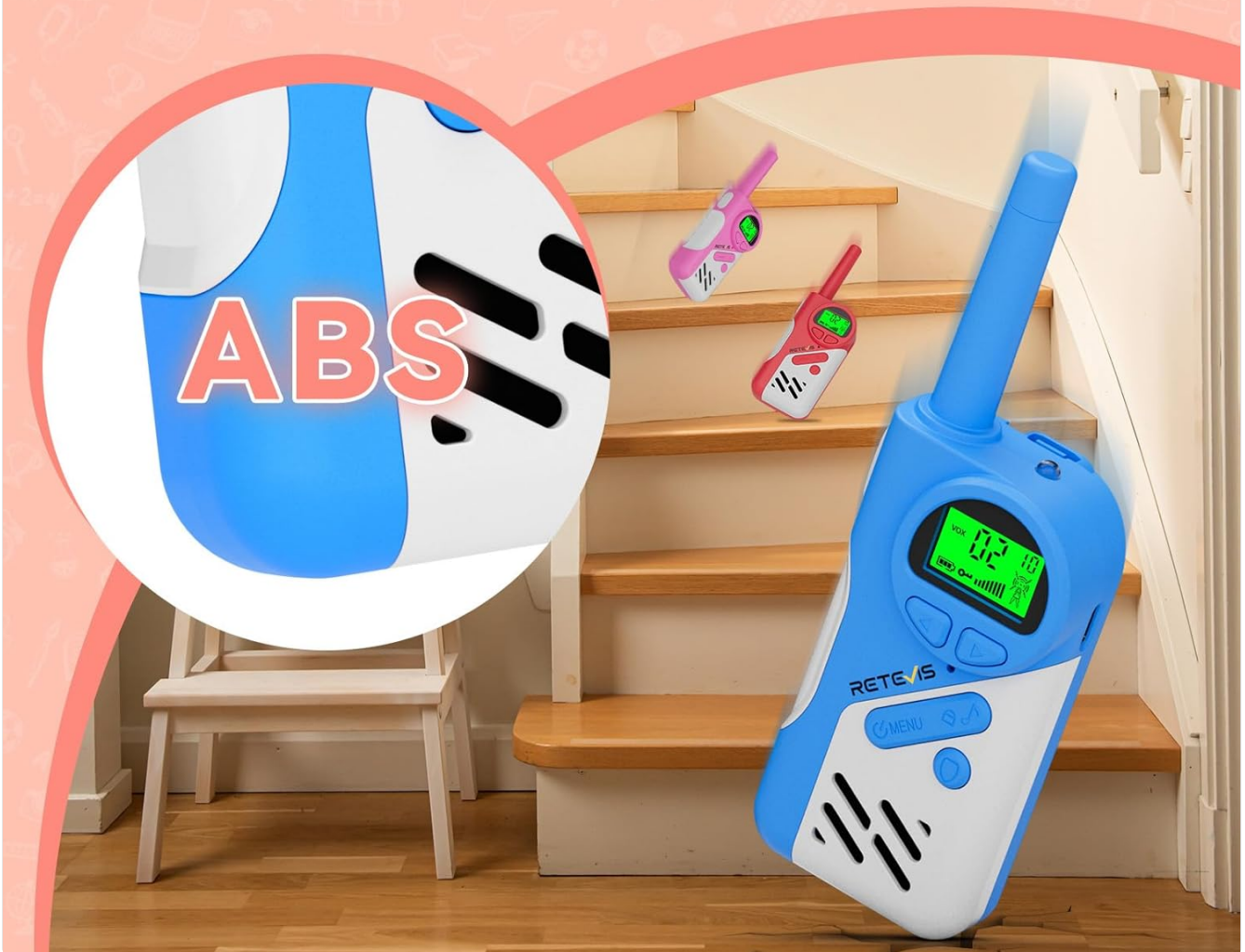
Image: A close-up view of a blue Retevis EZTalk 70 walkie-talkie, emphasizing its durable ABS material construction.

Play worry-free with the safe ABS material