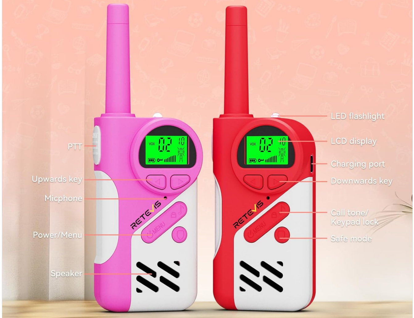
Image: Diagram illustrating the various parts of the walkie-talkie, including the PTT button, microphone, speaker, power/menu button, upwards/downwards keys, LED flashlight, LCD display, charging port, call tone/keypad lock button, and safe mode button.