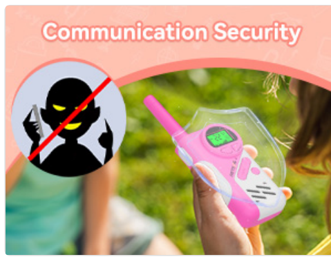
Image: An icon representing "Communication Security" with a red cross over a silhouette, indicating the blocking of strangers' messages.