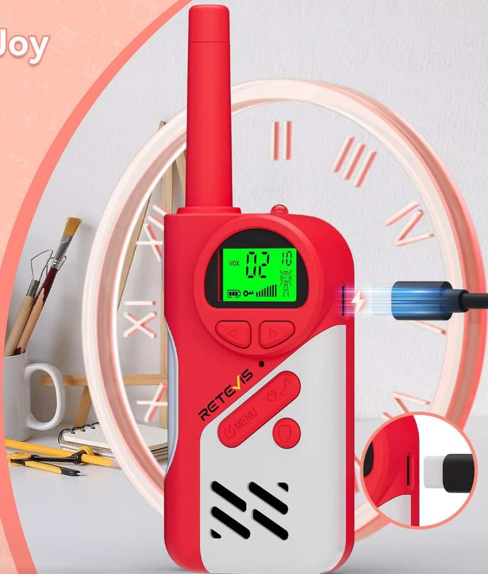
Image: A red walkie-talkie being charged via a Type-C cable, with icons indicating 1000mAh battery and 29 hours of runtime.