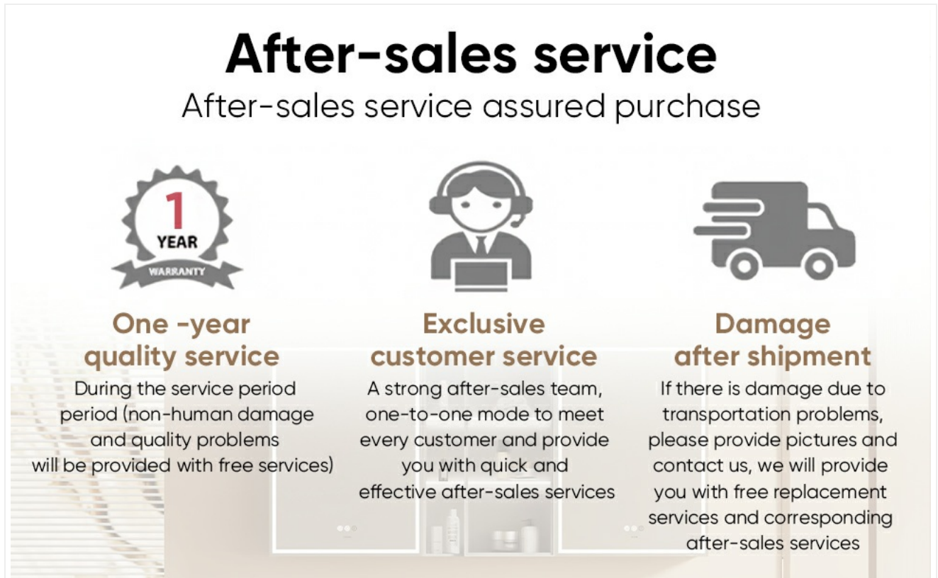
Image: LUTHXAY's after-sales service commitment, covering one-year quality service, exclusive customer support, and handling of shipping damage.

If your product arrives damaged due to transportation issues, please provide pictures of the damage and contact customer service. We will provide replacement services and corresponding after-sales support.