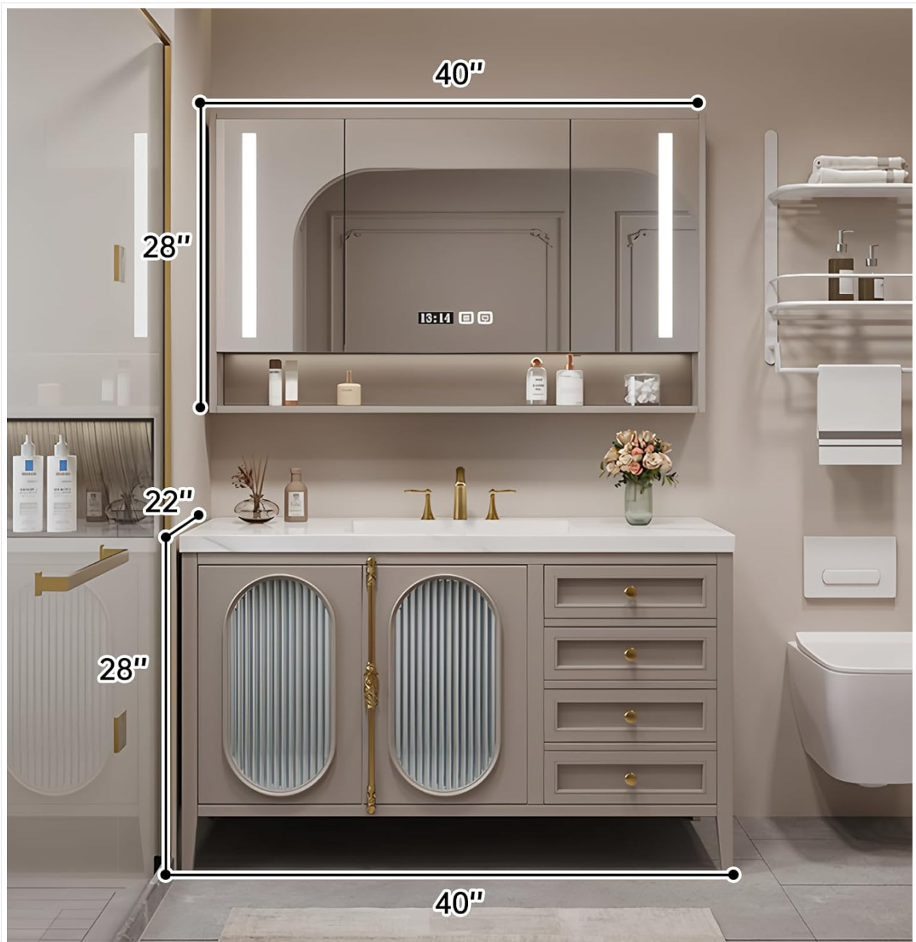
Image: Detailed dimensions of the LUTHXAY 40-inch bath vanity and mirror. The vanity measures 40 inches wide, 22 inches deep, and 28 inches high. The mirror is 40 inches wide and 28 inches high.

inch model has specific measurements for depth, width, and height.