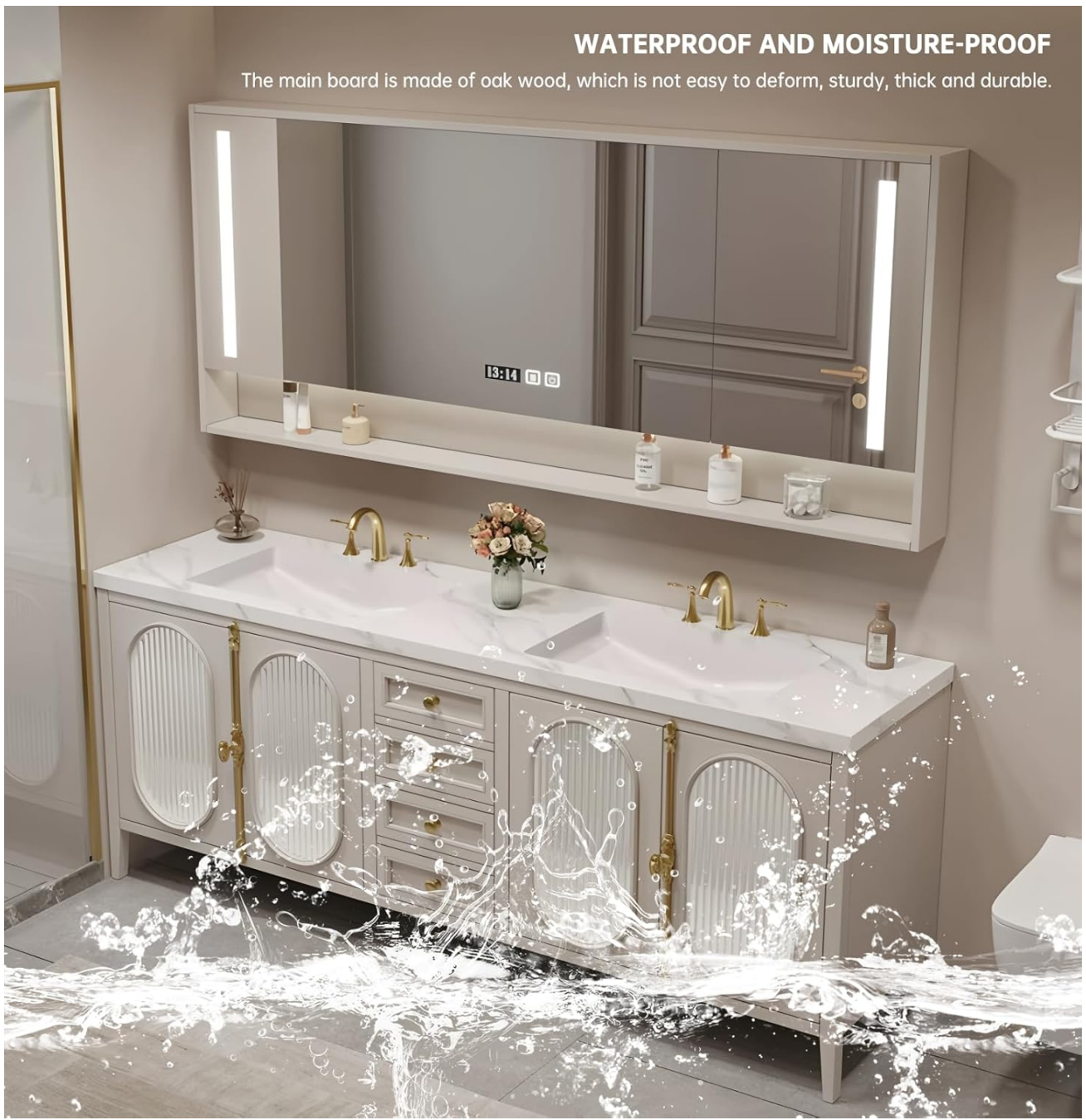
Image: The vanity cabinet demonstrating its waterproof and moisture-proof properties, highlighting the durable oak wood construction.

The main board is made of oak wood, which is not easy to deform, sturdy, thick and durable.