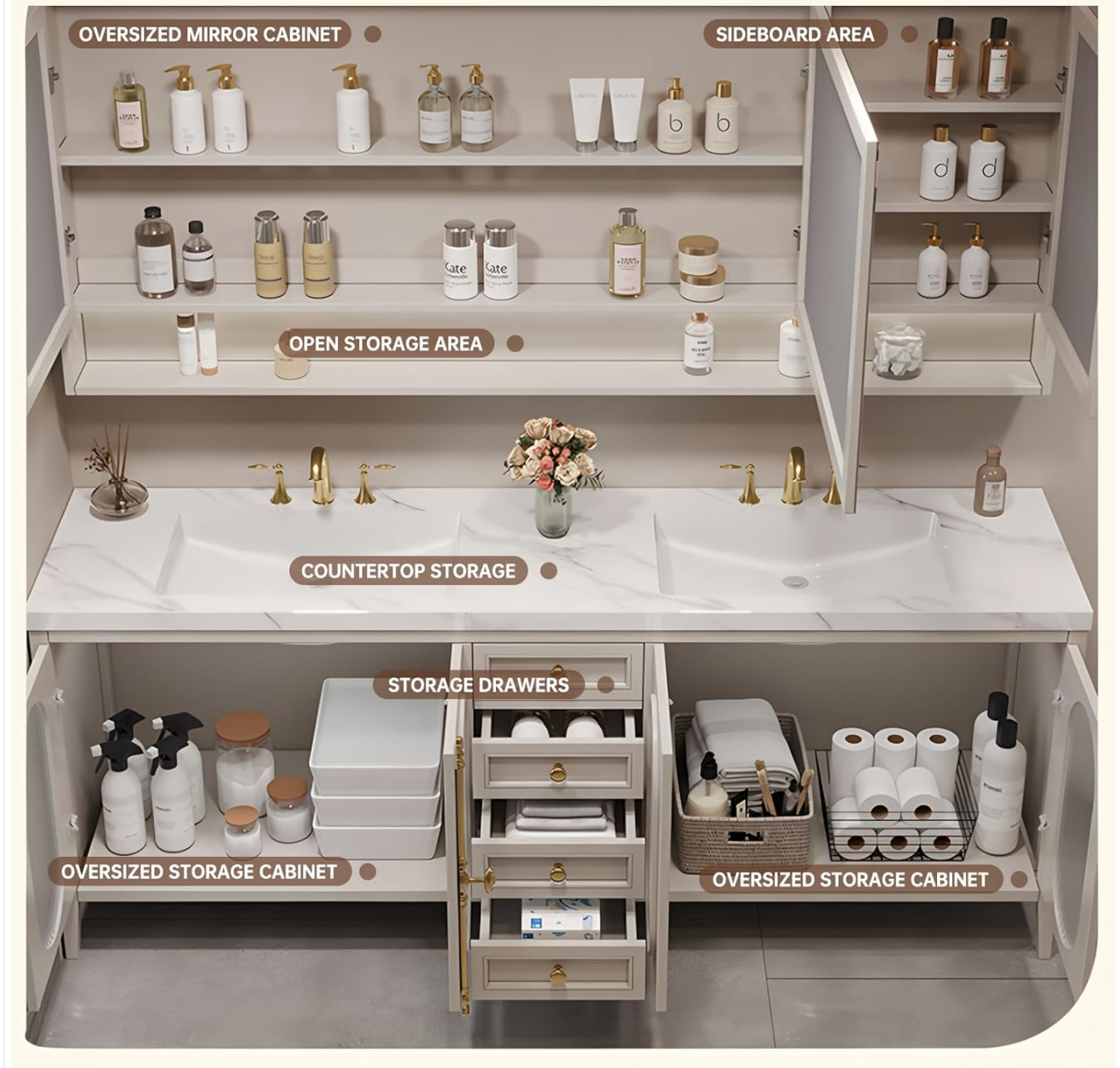
Image: Overview of the vanity's powerful storage and organization, detailing the mirror cabinet, open shelf, countertop, drawers, and lower cabinets.

Closed and open storage design with scientific division of access and storage to keep life organized.