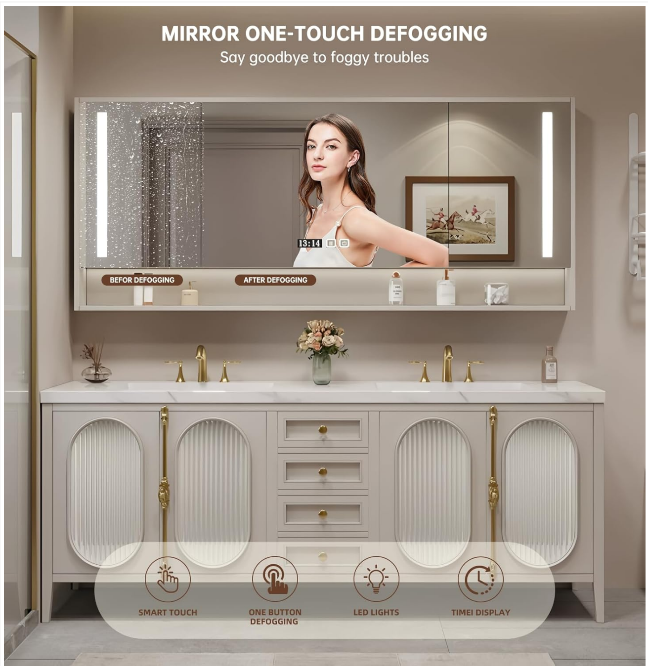
Image: The smart LED mirror demonstrating its one-touch defogging capability. The image shows the mirror with condensation (before defogging) and clear (after defogging), highlighting smart touch controls, defogging, LED lights, and time display.