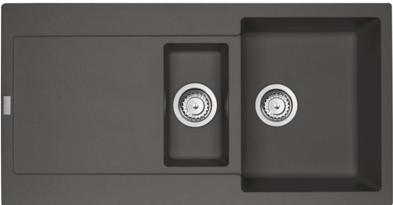
Figure 3.1: Top-down view of the Franke Maris MRG 651-97 kitchen sink. This image displays the slate grey Fraganite material,