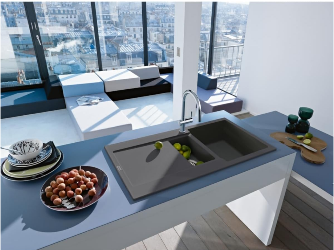
Figure 3.2: The Franke Maris MRG 651-97 sink integrated into a contemporary kitchen setting. This view shows the sink installed in a light blue countertop, demonstrating its aesthetic appeal and functional use with a modern faucet, fresh fruit, and kitchenware.

the large main bowl, the smaller secondary bowl, and the integrated drainer area. Both bowls feature standard drain openings.