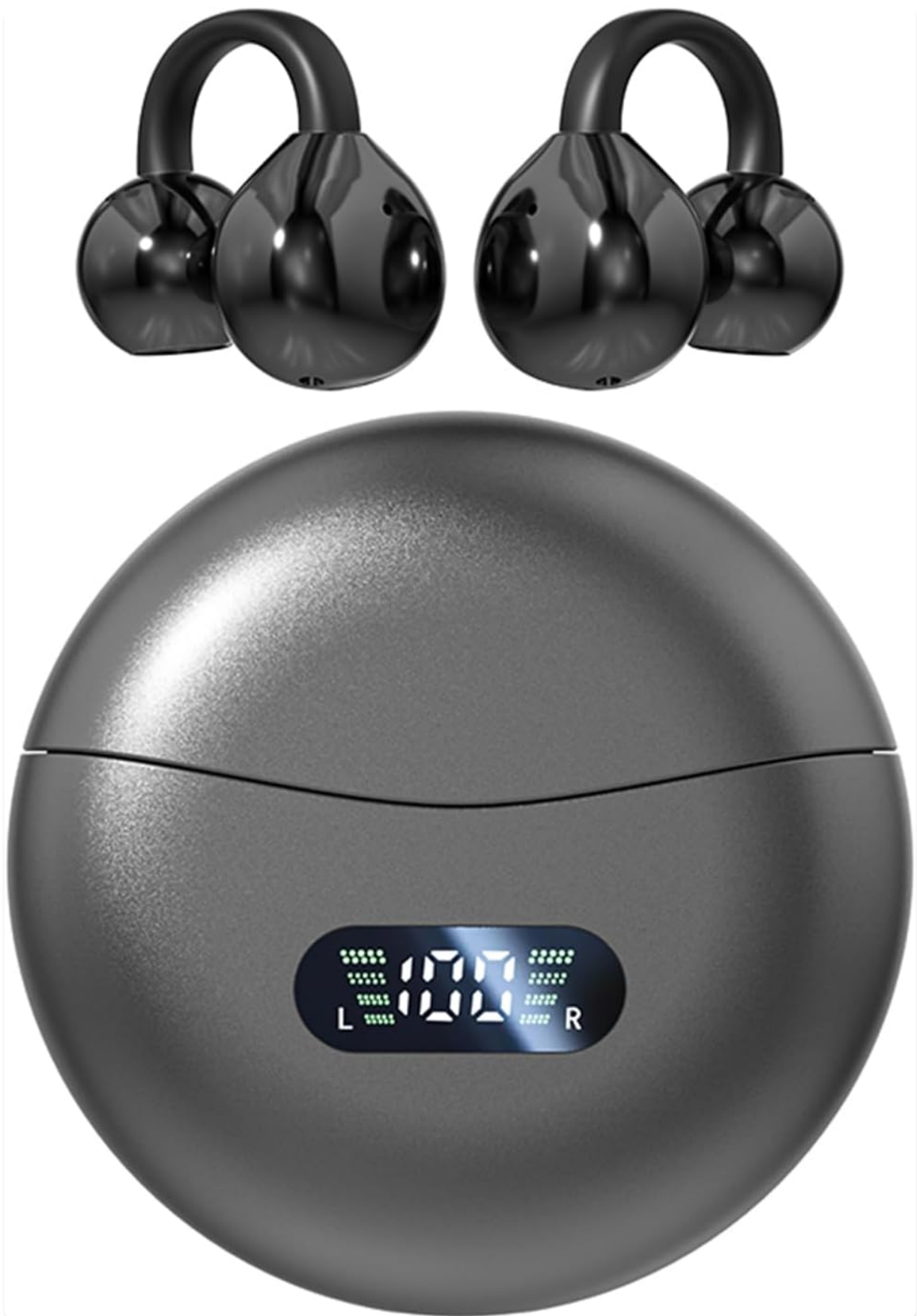
Image: Piluyaa M79 Open-Ear Headphones and charging case.