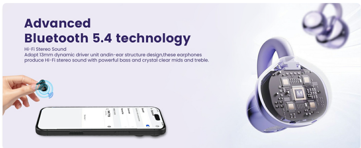
Image: Visual guide for initial headset setup and pairing.