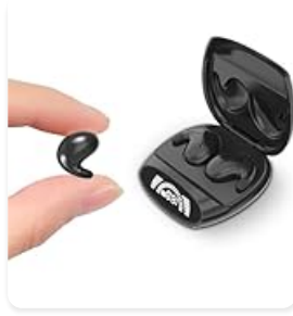
Image: Comparison of earbud fit types, highlighting the secure open-ear design.