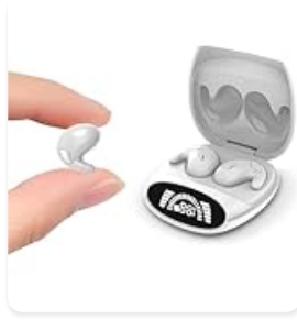
Image: Earbud with internal components and phone showing Bluetooth 5.4 connection.