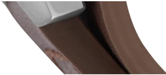
Side view of the Fossil Coachman watch, showing the crown and chronograph pushers on the right side of the case.