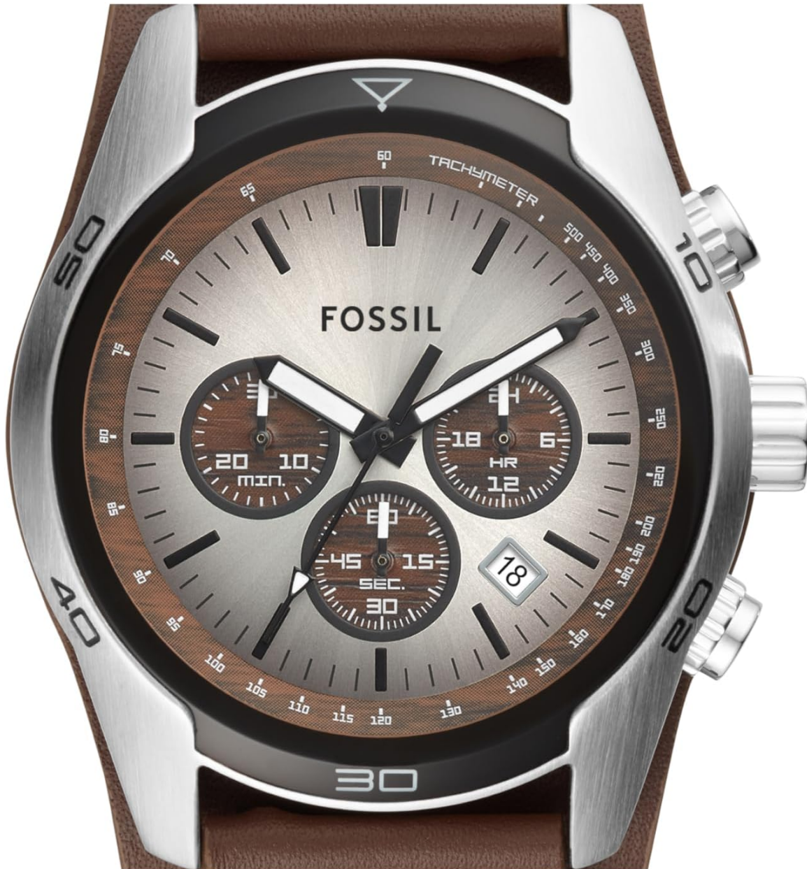
Close-up of the watch dial, highlighting the three subdials for minutes, seconds, and 24-hour time, along with the date window.