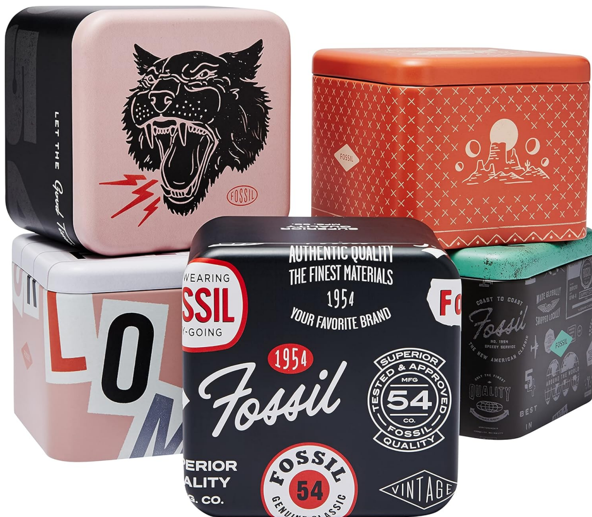
Various designs of Fossil watch tins, suitable for storing your watch when not in use.

When not in use, store your watch in a cool, dry place away from direct sunlight and extreme temperatures. The original Fossil tin (if available) provides suitable protection.