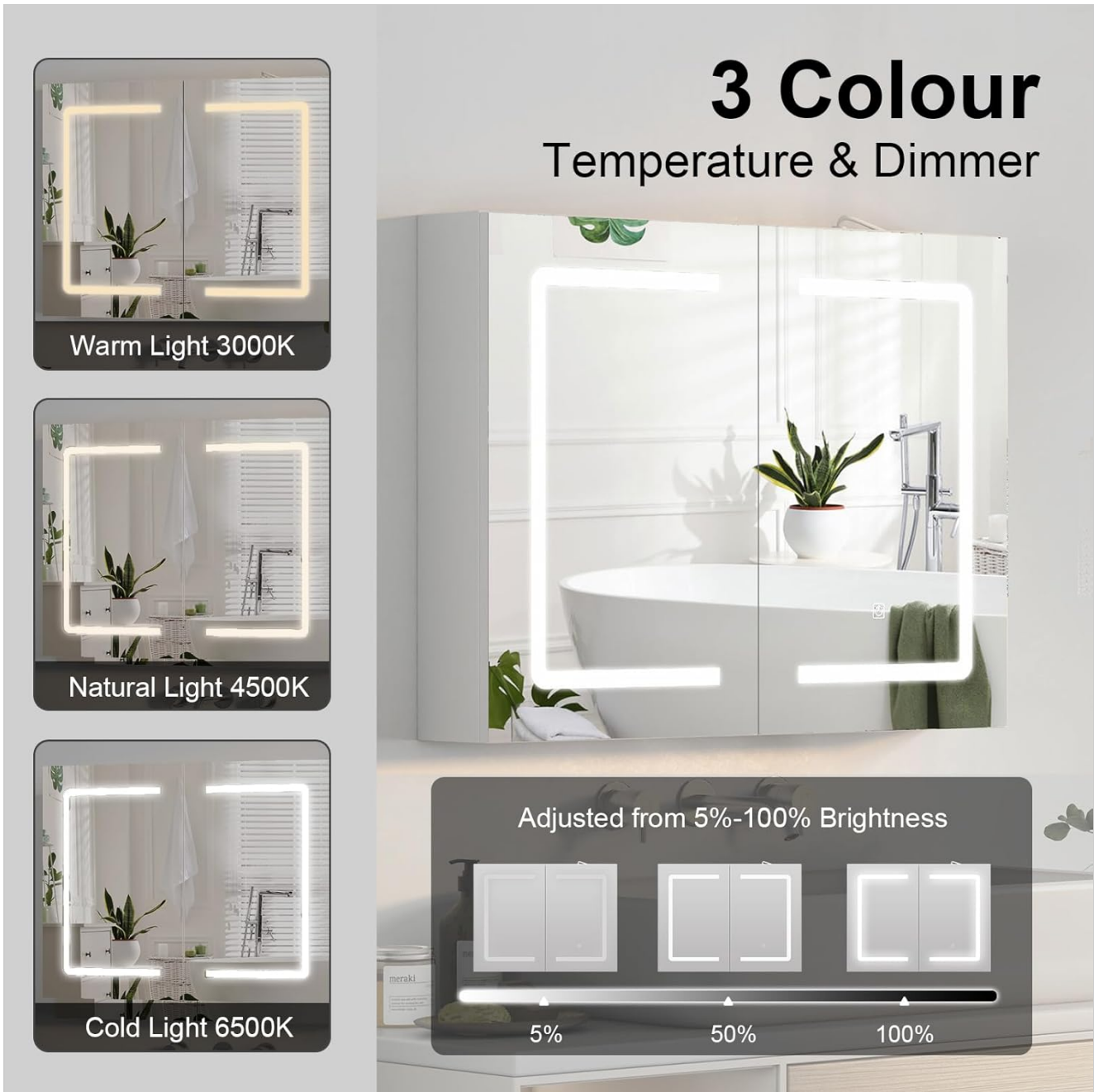
Figure 4: LED Color Temperature and Dimmer Controls