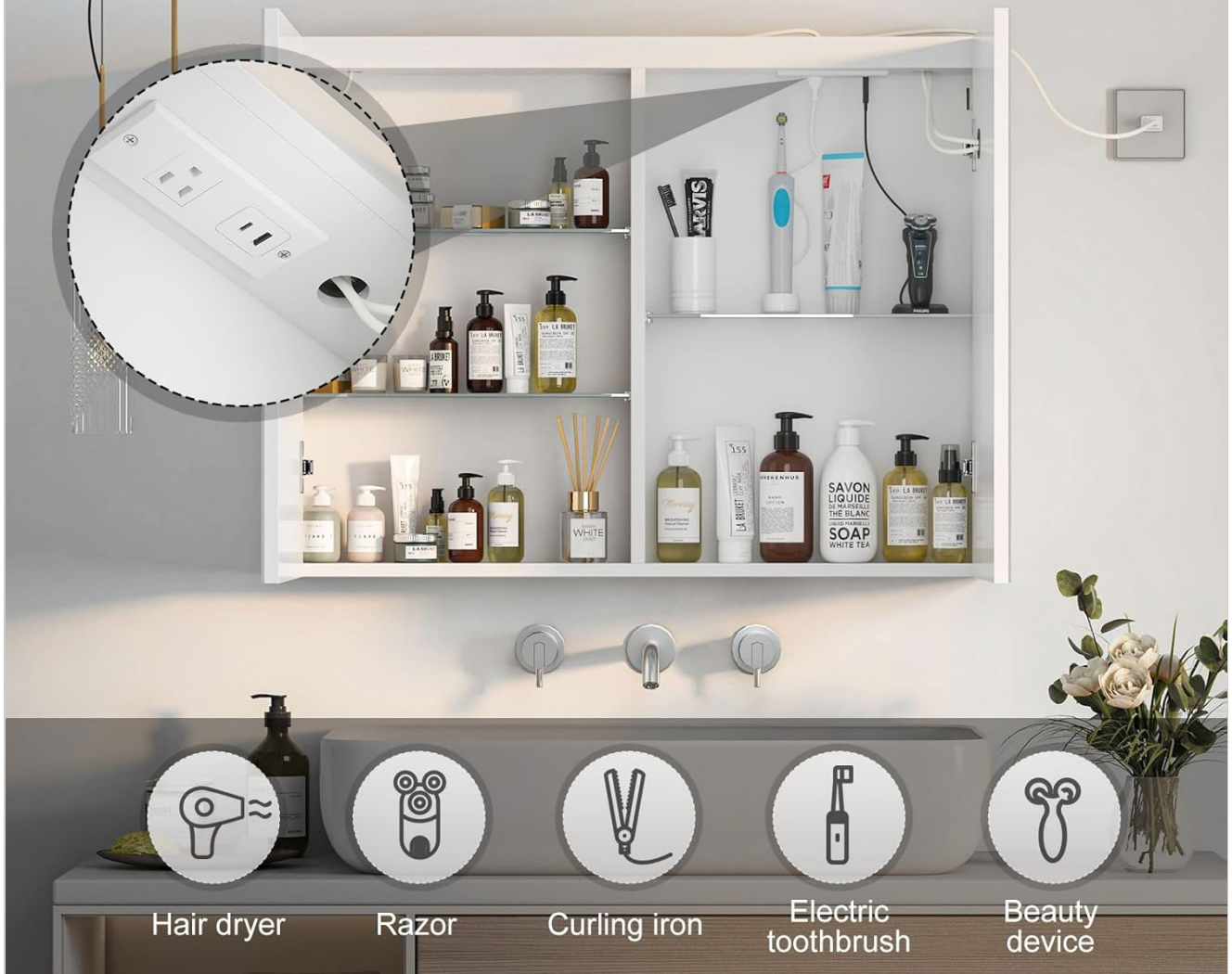
Figure 5: Built-in Power Strip with USB and Electrical Outlet

Easy to power your everyday bathroom appliances