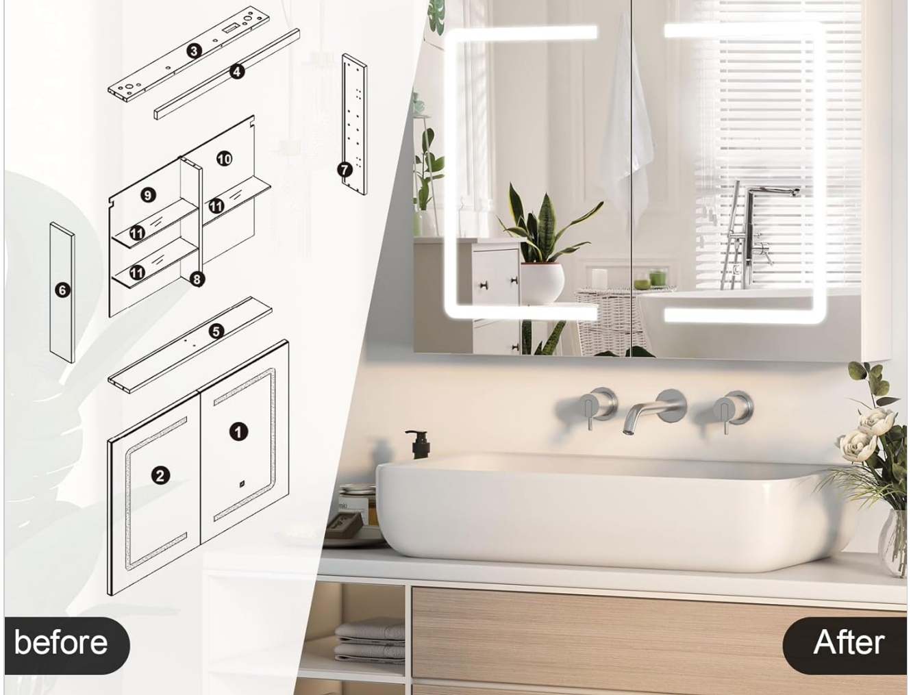
Figure 2: Assembly Diagram