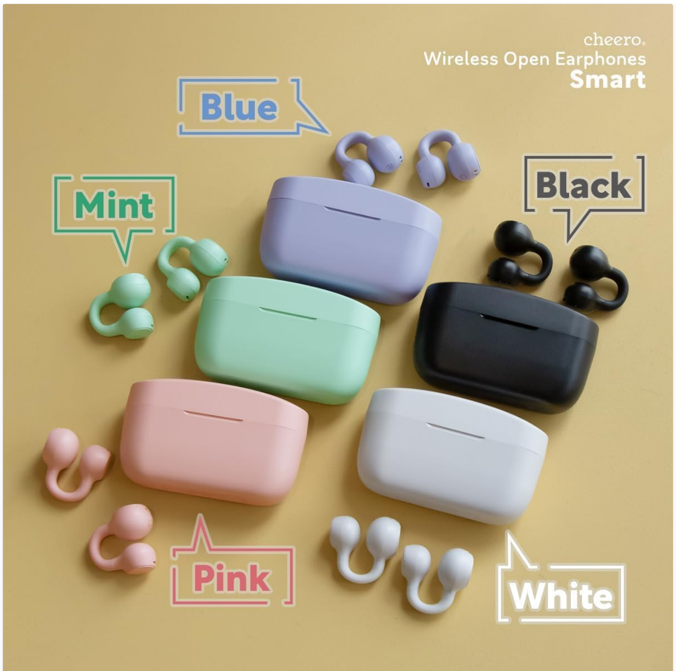
Image: The cheero Wireless Open Earphones Smart and their charging case, displayed on a clean surface.