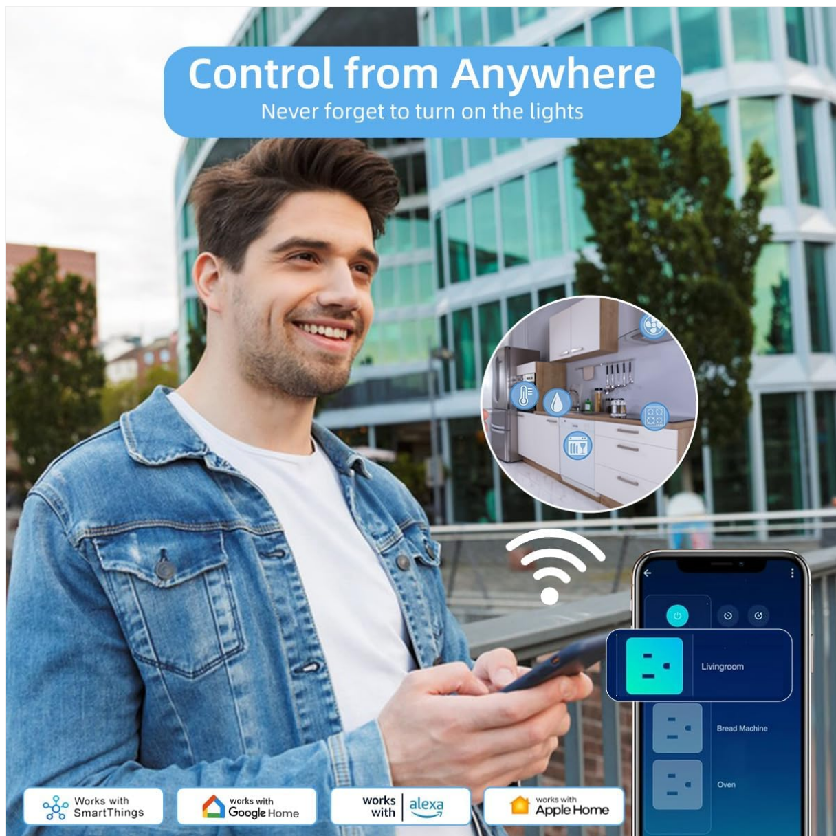
Image 4.2: A user controlling home appliances remotely using a smartphone app, demonstrating the "Control from Anywhere" feature.