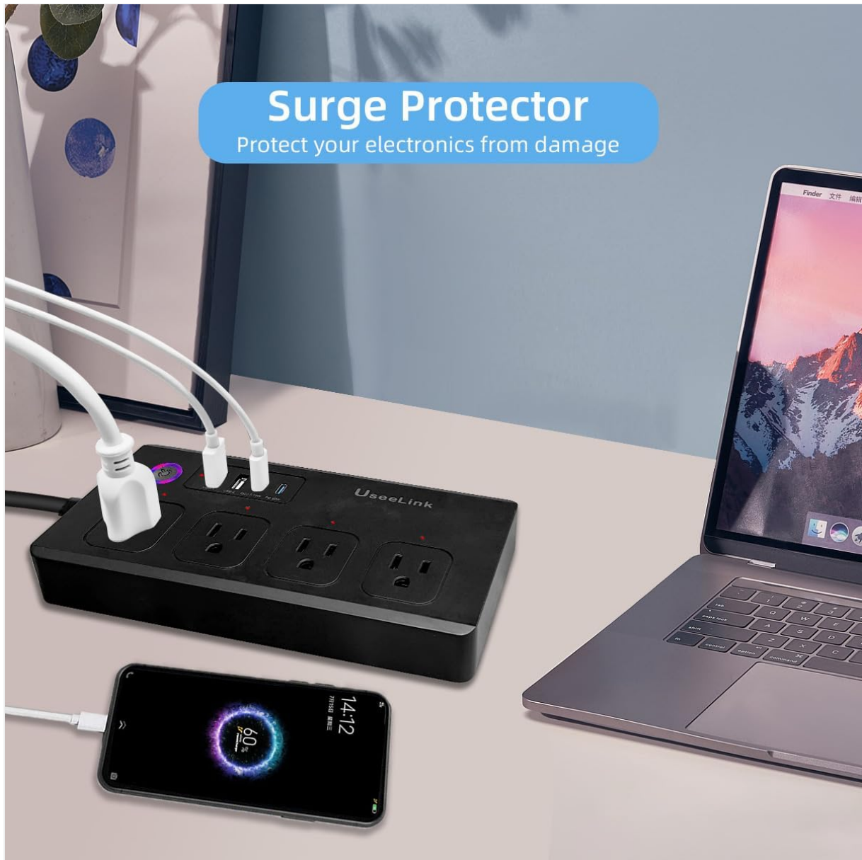
Image 5.1: The power strip acting as a surge protector, safeguarding connected devices from electrical damage.

Always ensure the total power consumption of connected devices does not exceed the maximum rating of 16A / 3500W. Avoid using the power strip for extended periods at its maximum power capacity.