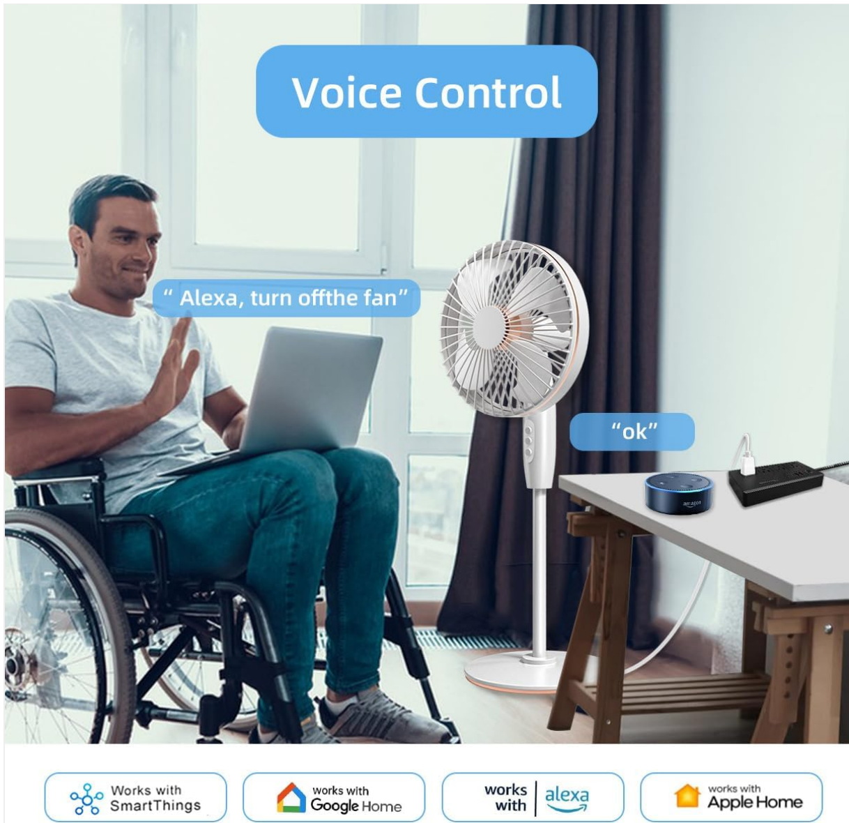
Image 4.1: A user demonstrating voice control with an Alexa device to turn off a fan connected to the smart power strip.