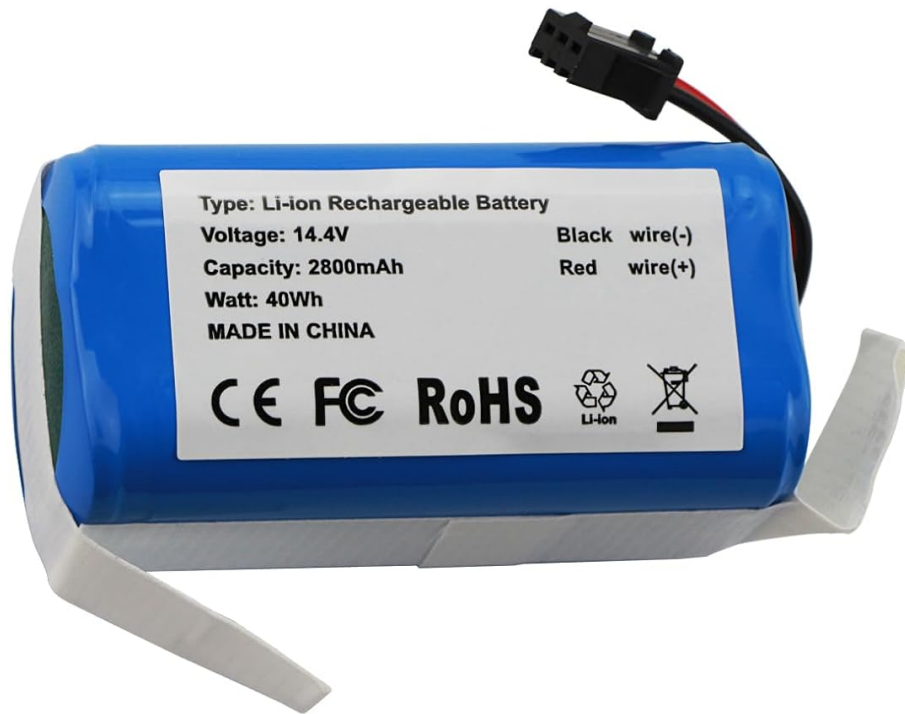
Image: Detailed product parameters including battery type, voltage, and capacity.