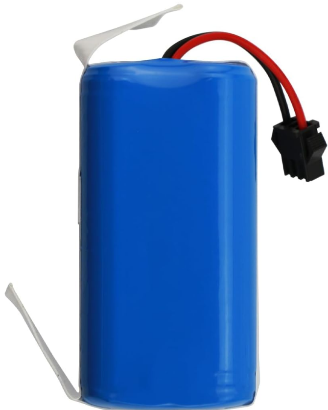
Image: Close-up view of the battery connector, highlighting its design for proper connection.