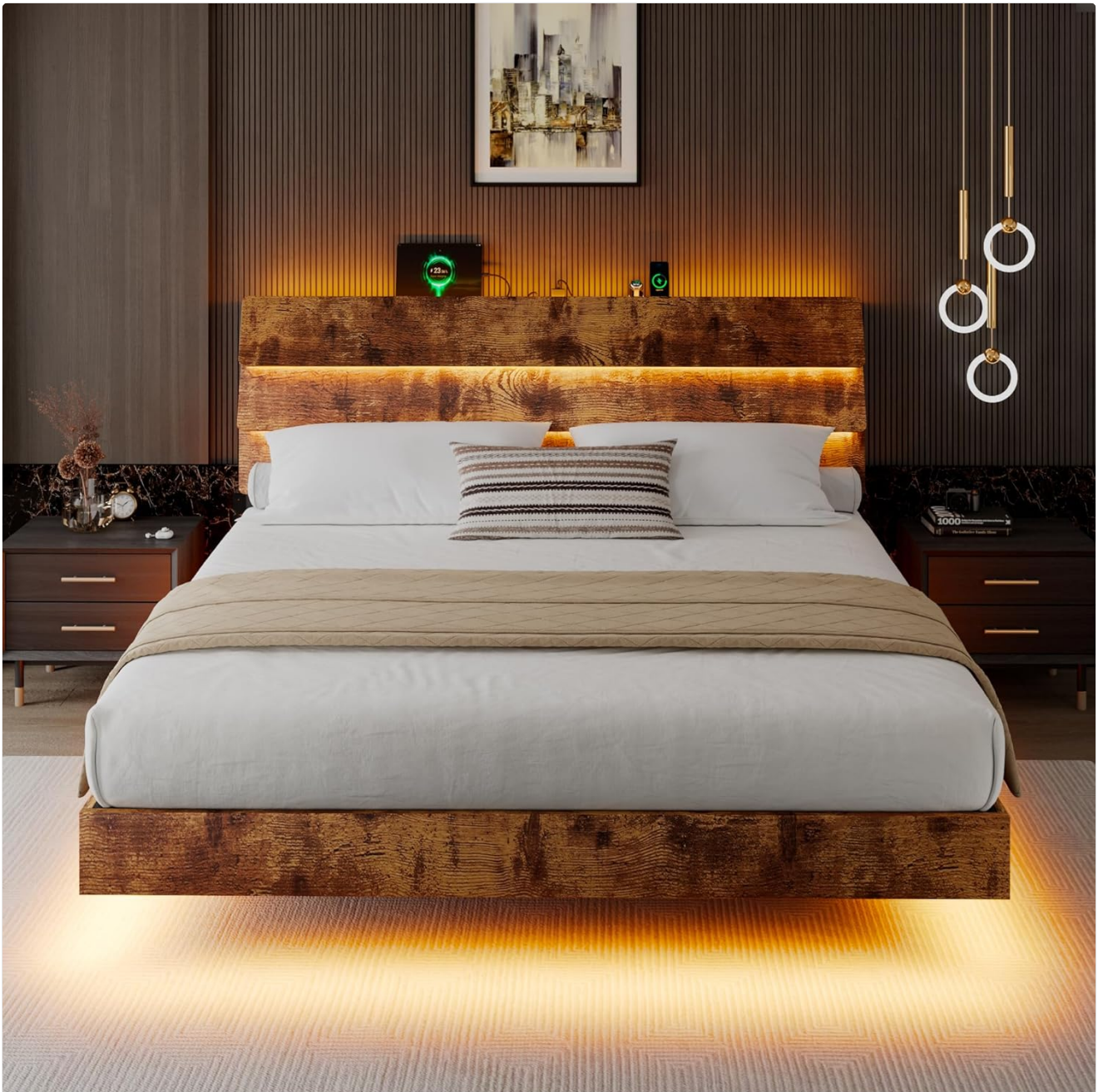
Image 1.1: The iPormis King Size Floating Bed Frame, showcasing its wooden headboard, under-bed LED lighting, and overall design.