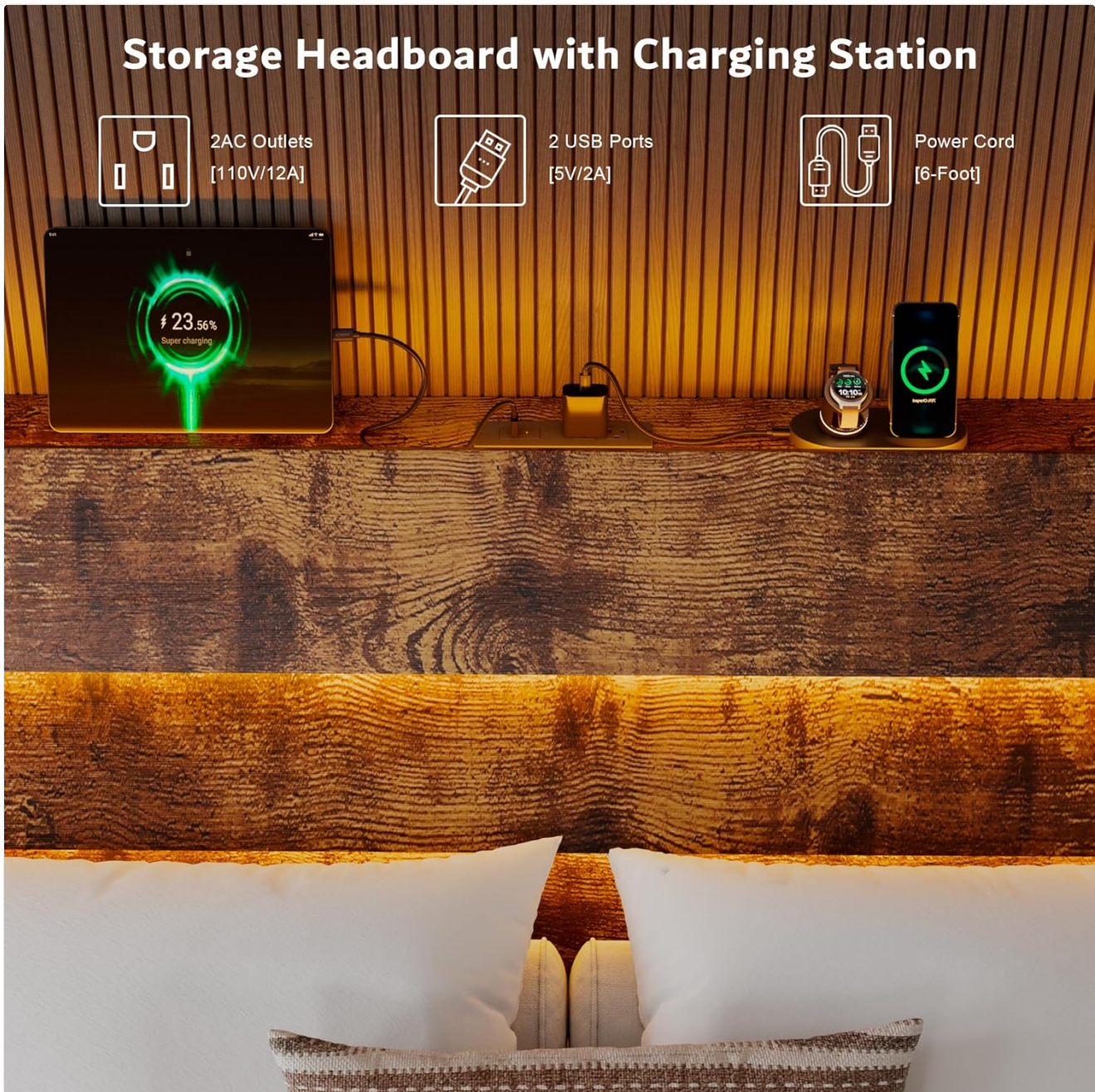
Image 5.2: The storage headboard with its integrated charging station, featuring AC outlets and USB ports.