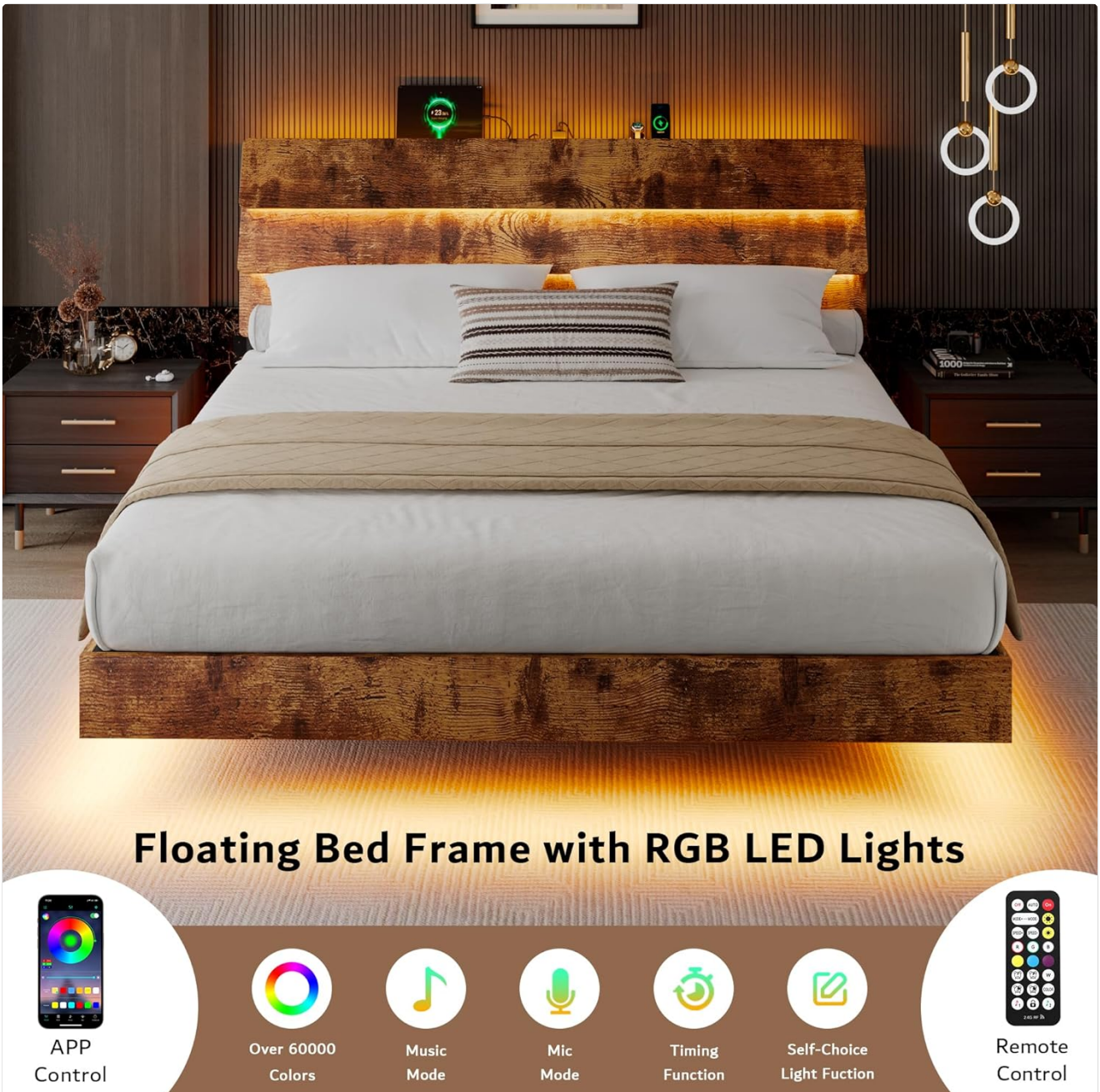
Image 5.1: Control options for the LED lights, including APP and remote control, with various functions like color selection and music