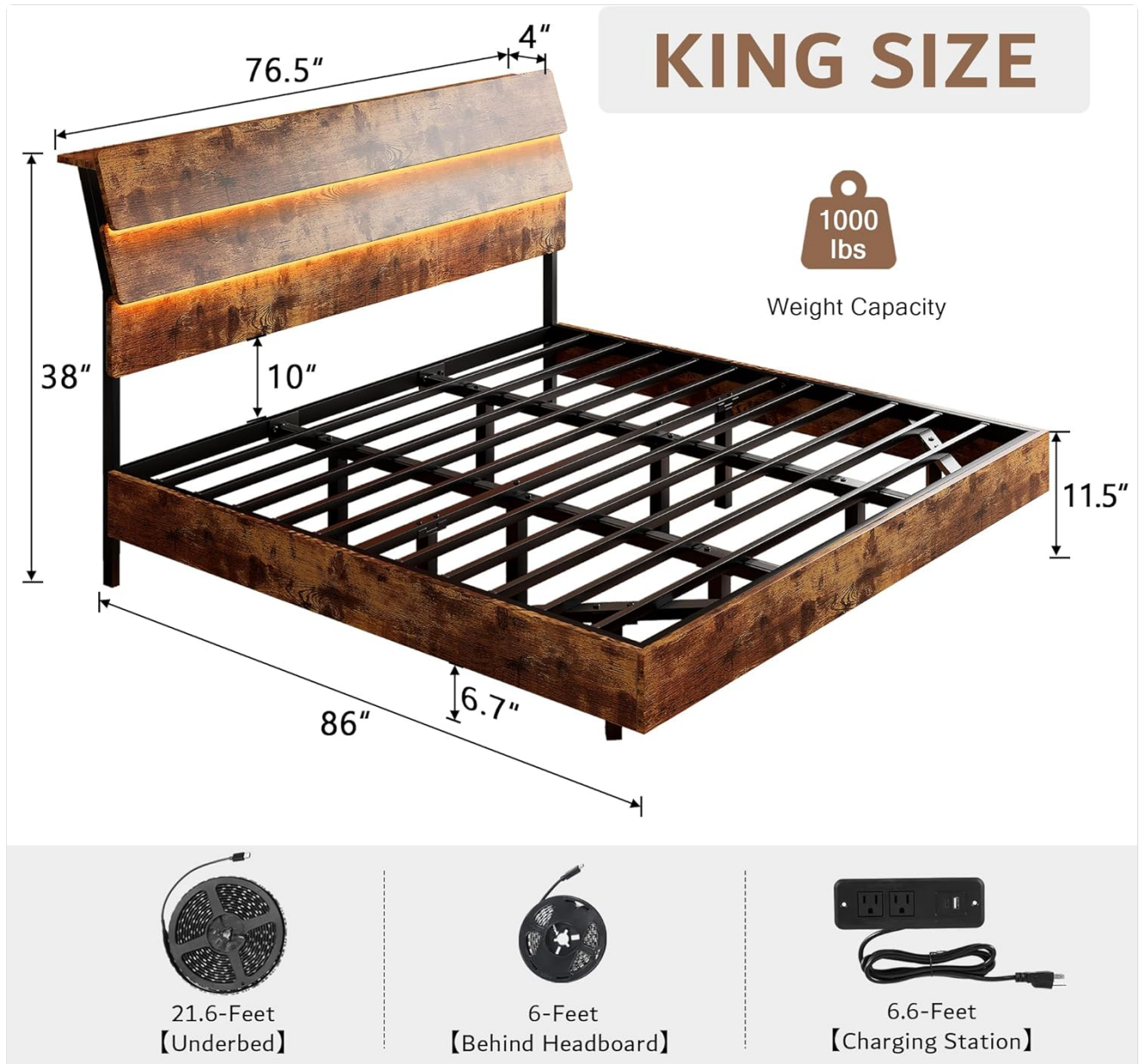
Image 3.1: Overview of bed frame dimensions and key included components like LED strips and charging station.