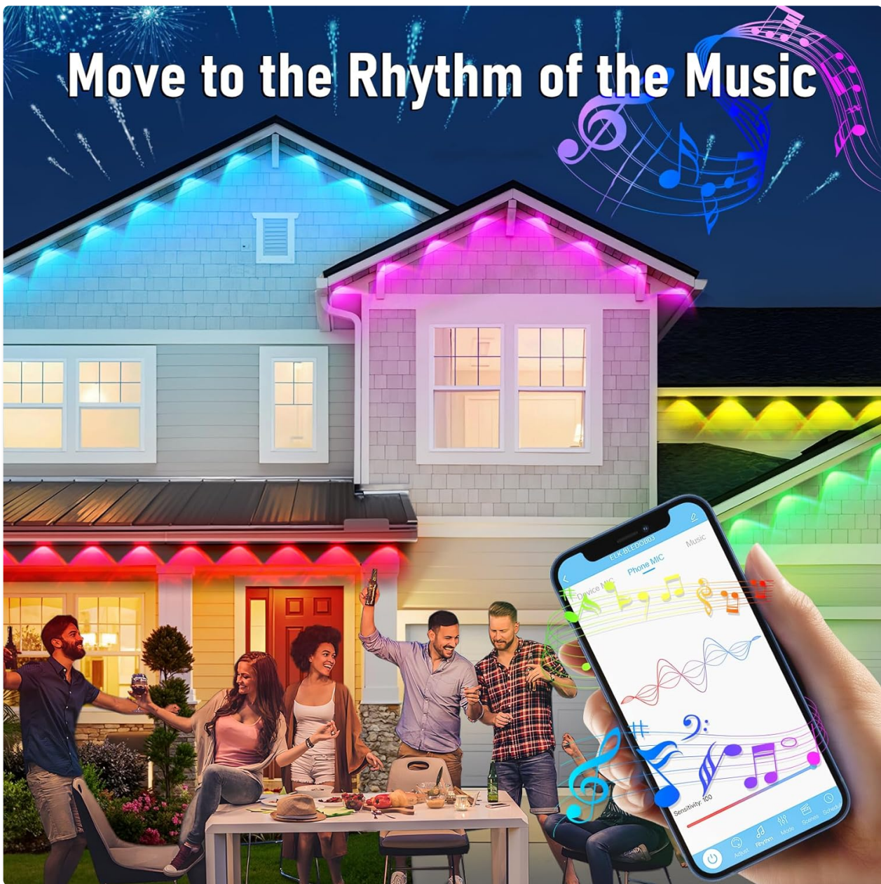
Figure 4: Music Sync Feature