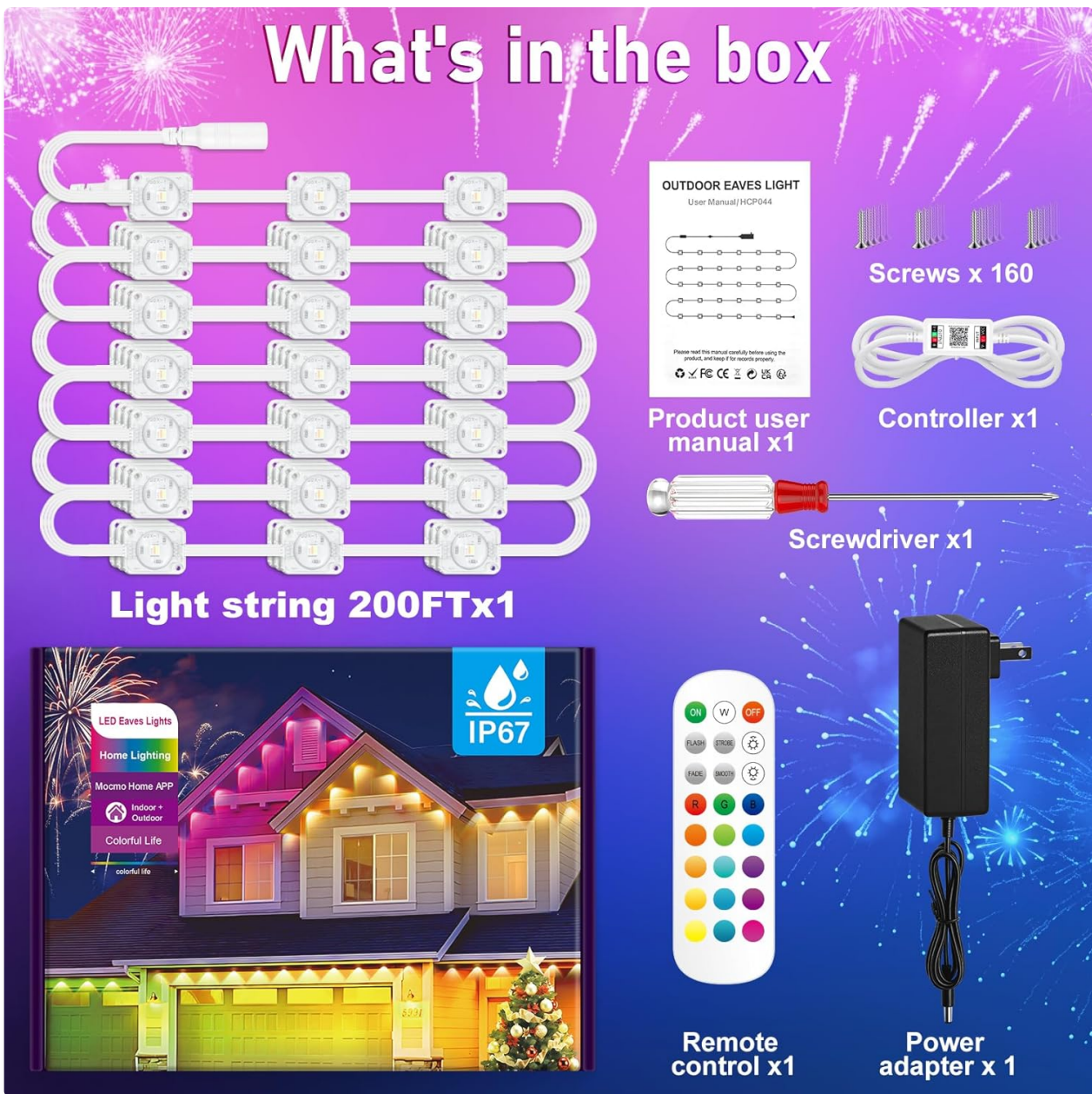
Figure 1: Package Contents