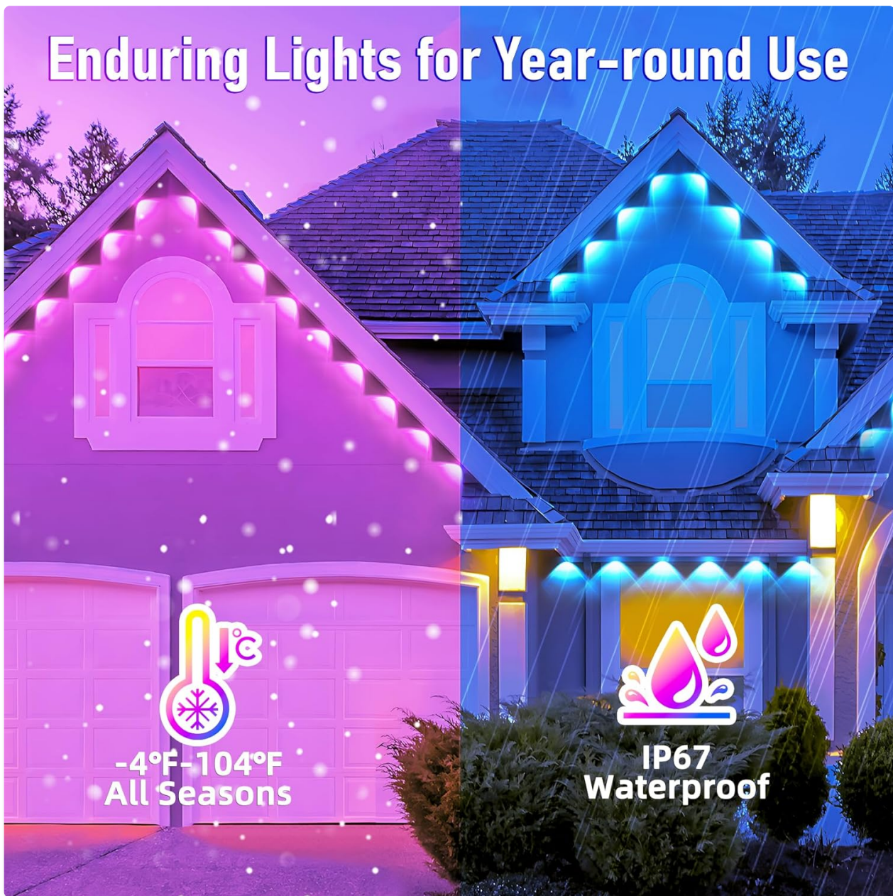
Figure 5: All-Season Durability