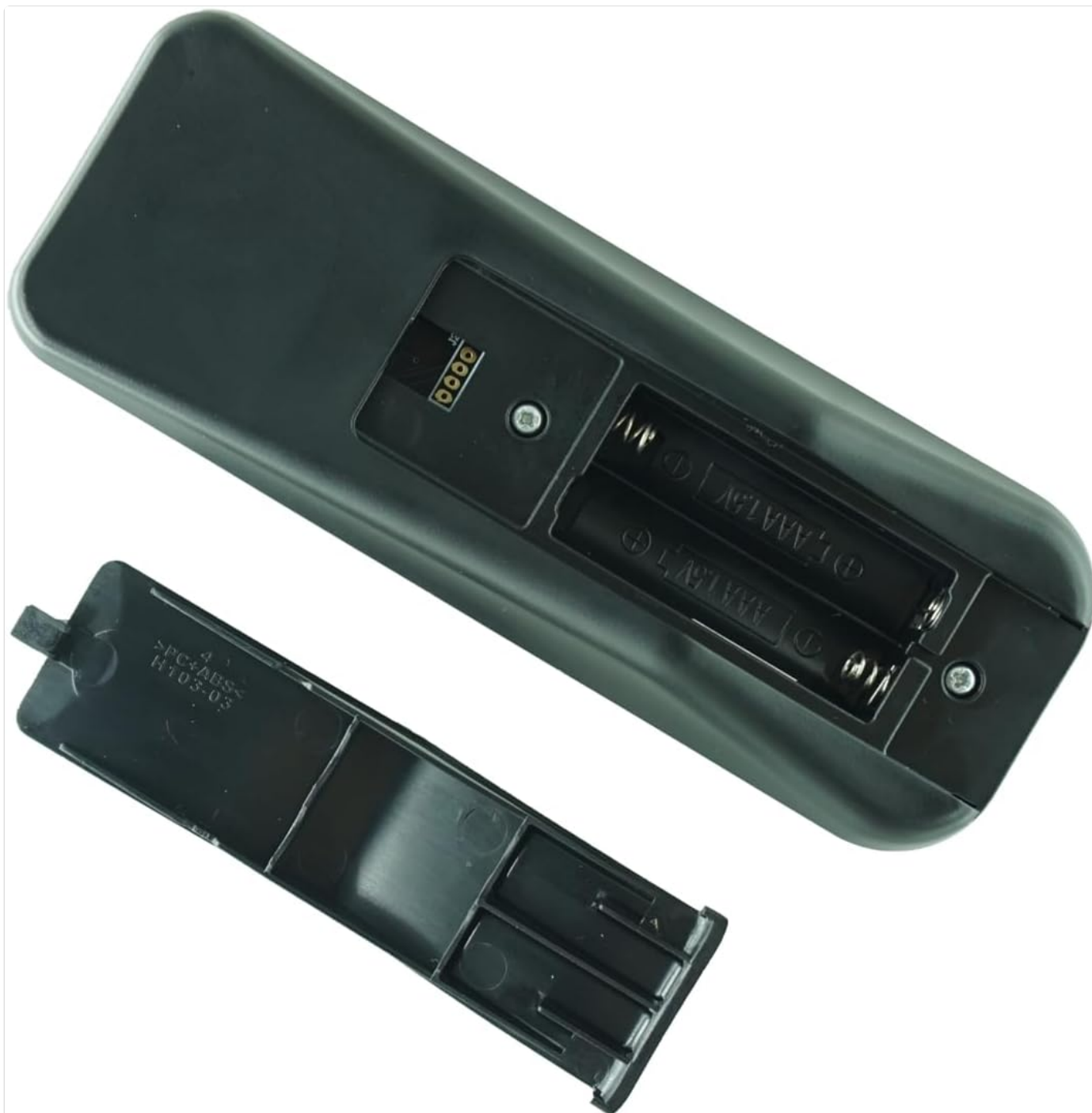
Figure 3: Rear view of the remote control, illustrating the battery compartment. Ensure 2 AAA batteries are correctly inserted according to polarity markings.