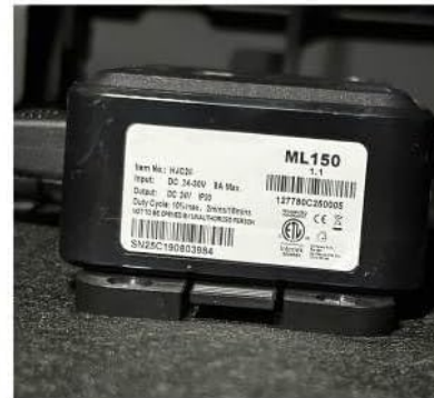
Figure 2: Visual guide for identifying your control box and old remote for compatibility verification. This image highlights the importance of matching the control box model and the appearance of your previous remote.