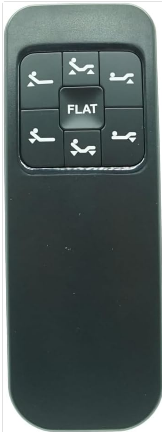
Figure 1: Front view of the replacement remote control. It features dedicated buttons for adjusting head and foot positions, as well as a 'FLAT' button to return the bed to a flat position.