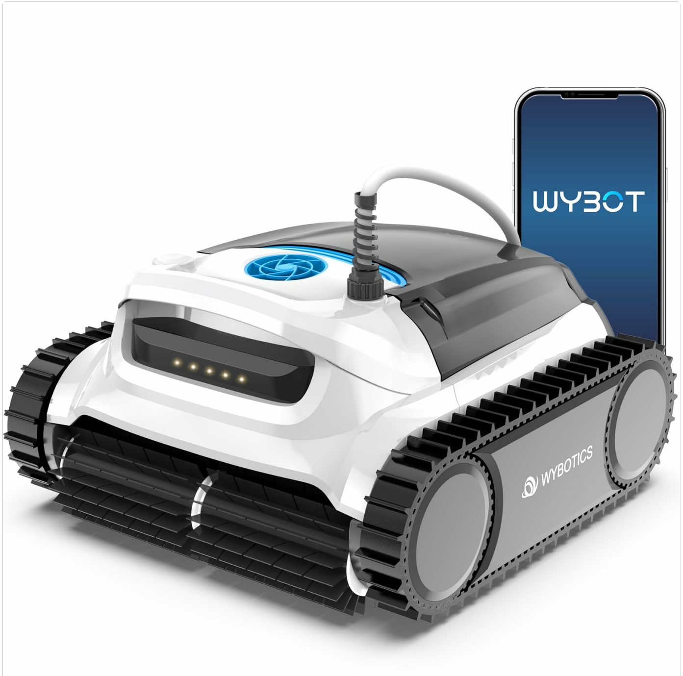
Figure 4.1: WYBOT M100 in pool with power supply connection.

Carefully remove the WYBOT M100 from its packaging. Place the robotic cleaner into the pool. Ensure the power supply unit is positioned outside the pool, at a safe distance (minimum 3.5 meters / 11.5 feet) from the pool edge, and in a dry, shaded area.