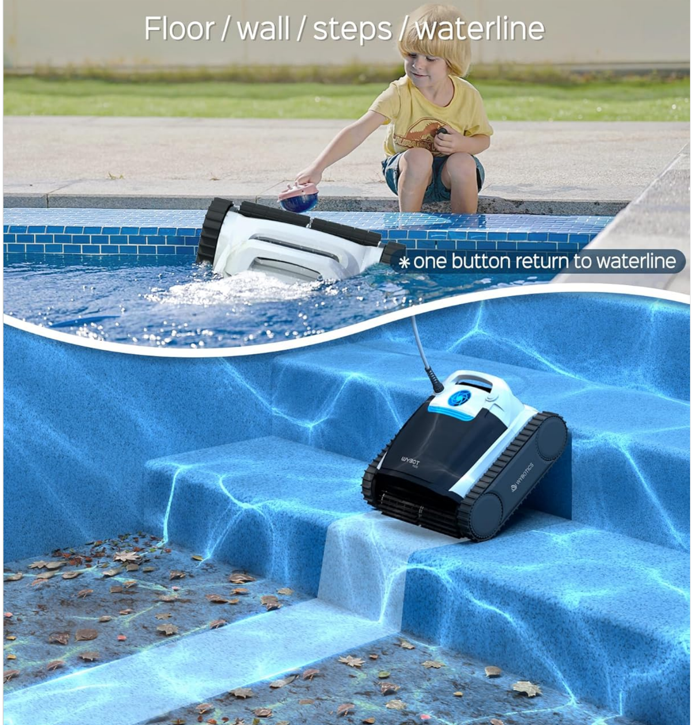
Figure 5.3: Full Coverage Cleaning of Pool Surfaces.