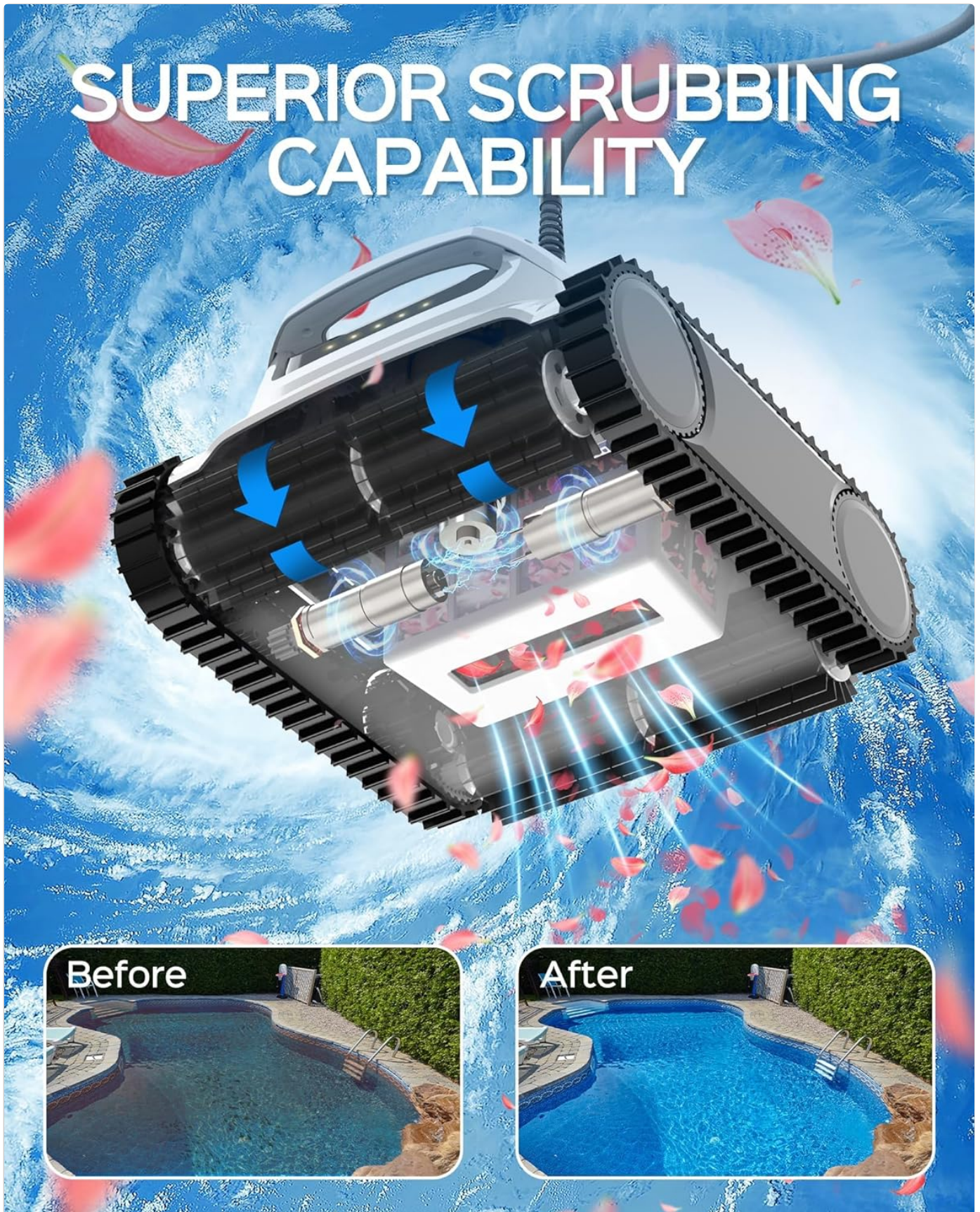
Figure 5.4: Superior Scrubbing Capability.