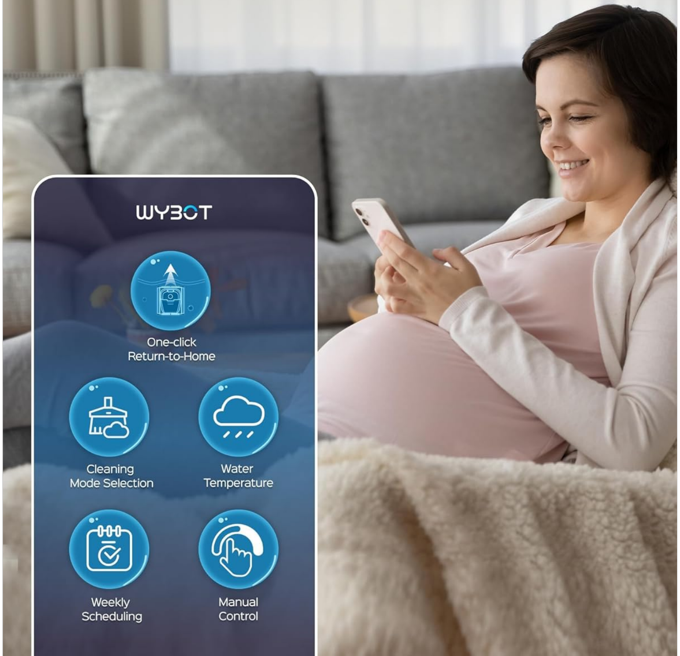
Figure 5.1: WYBOT M100 App Interface.