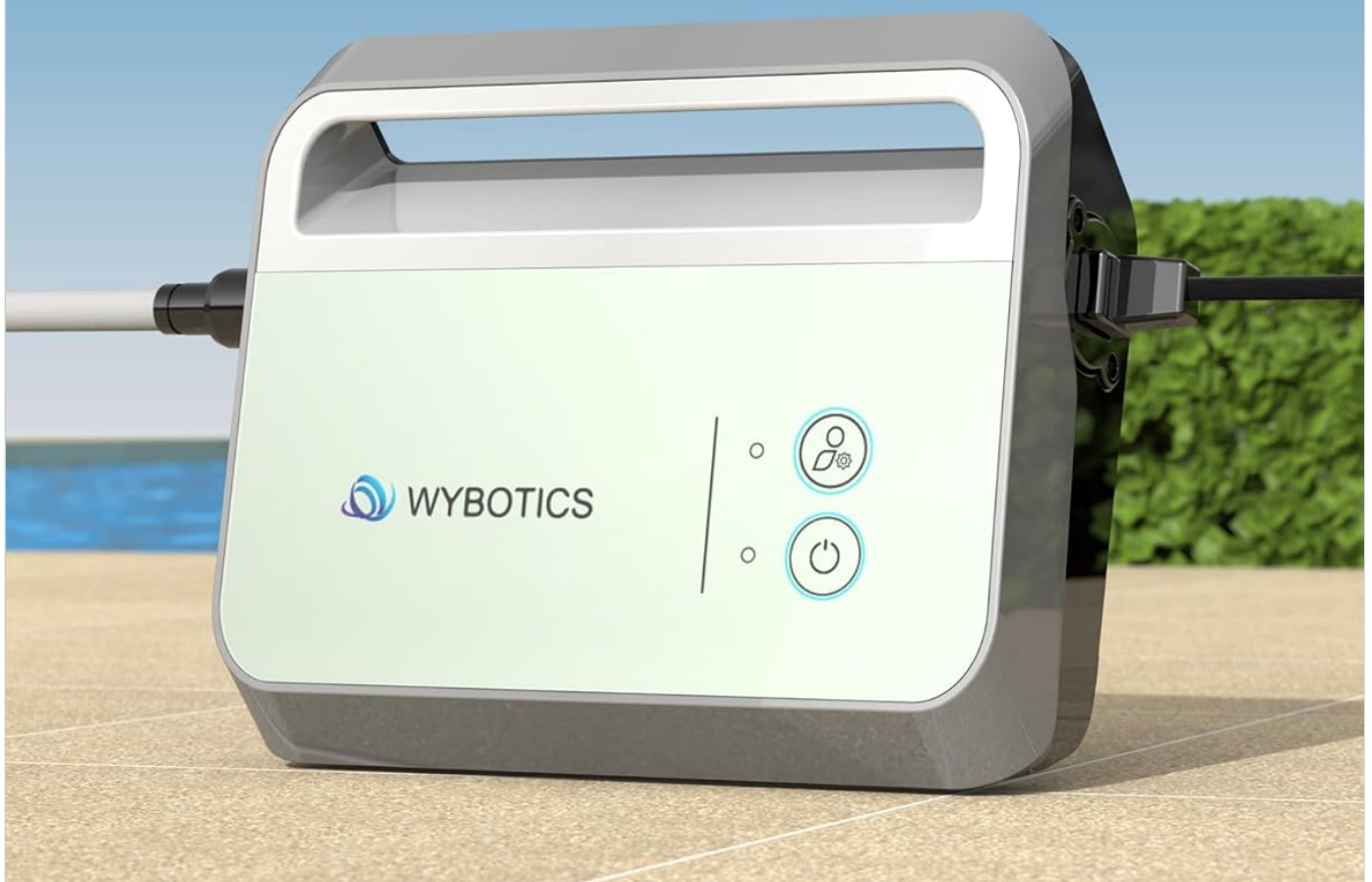
Figure 4.2: WYBOT M100 Power Supply Unit.