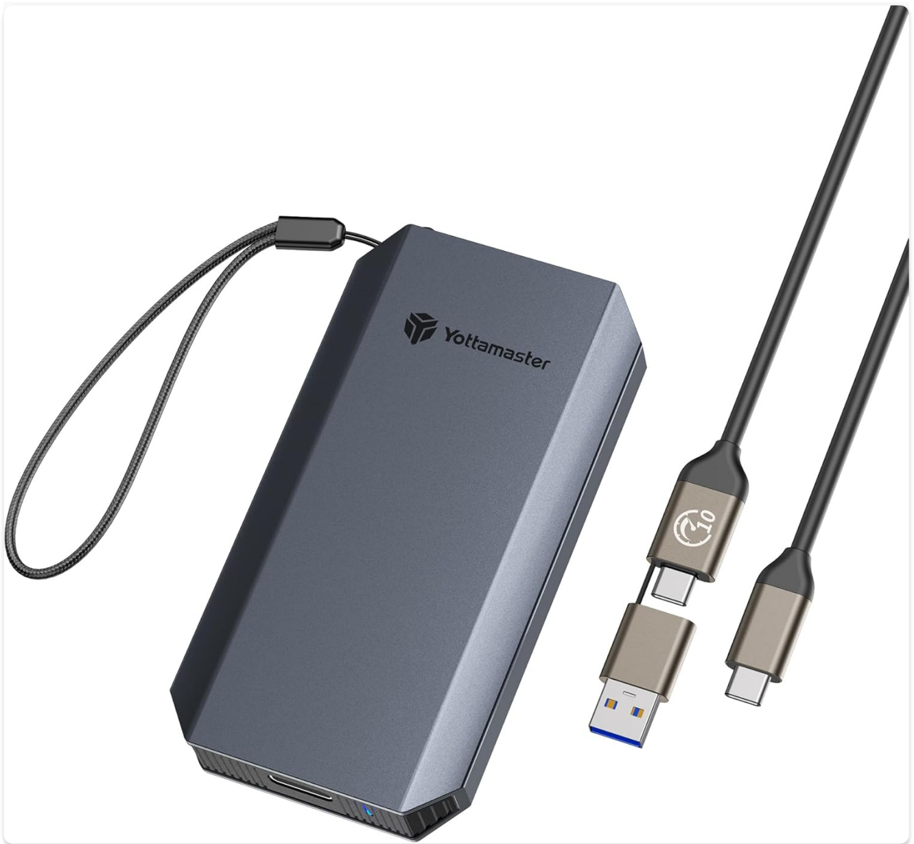
Image: The Yottamaster YM5 External SSD, featuring its compact design, included 2-in-1 USB-C cable, and lanyard.