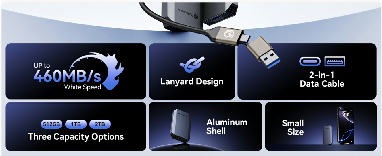
Image: A visual summary of the Yottamaster YM5's key features, including its high-speed performance, lanyard design, 2-in-1 data cable, available storage capacities, durable aluminum shell, and compact size.