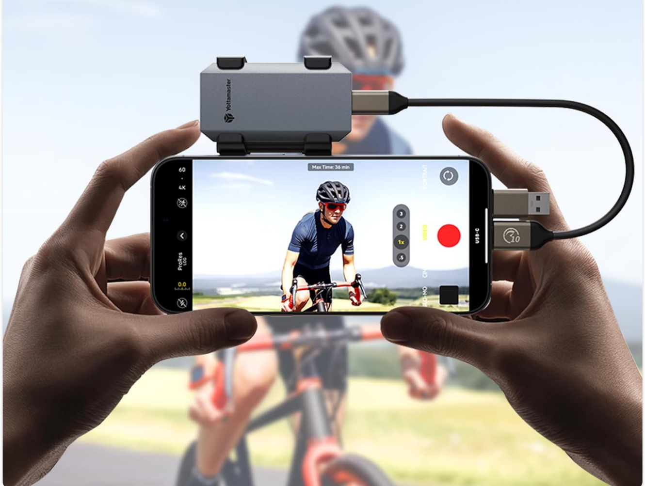
Image: The Yottamaster YM5 External SSD connected to an iPhone, demonstrating its capability to record 4K ProRes video directly to the drive.

Compatible with iPhone 15/16 Pro/Pro Max