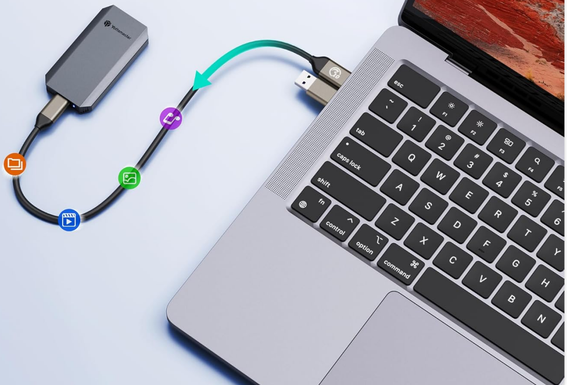
Image: The Yottamaster YM5 External SSD connected to a laptop, demonstrating its use for data transfer with an arrow indicating the flow of data.