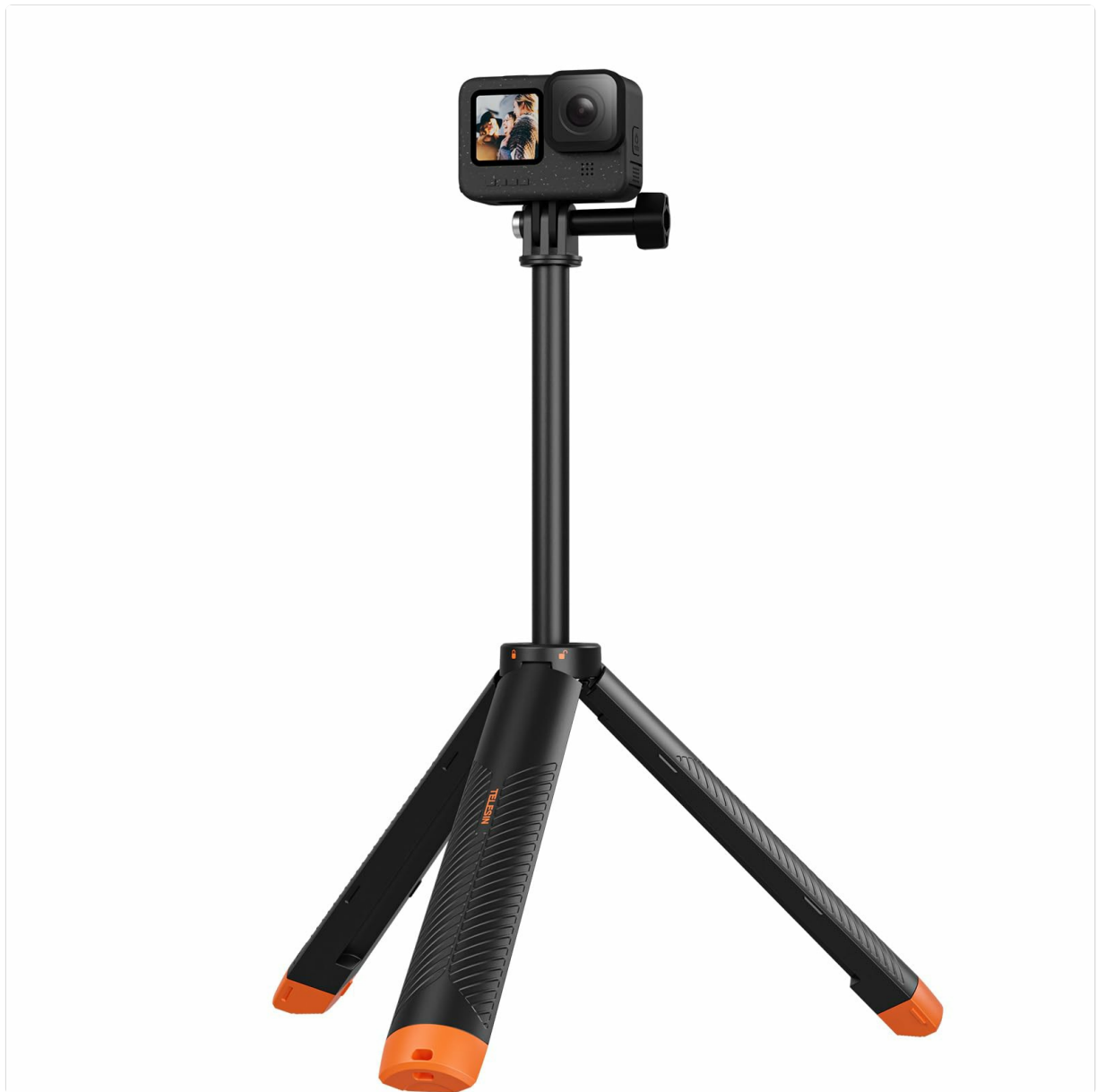
Image: The TELESIN 4-in-1 Floating Selfie Stick Tripod in its compact form.

Your browser does not support the video tag.