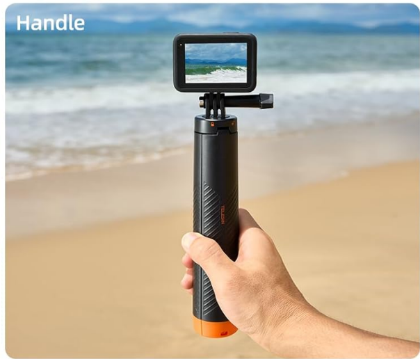
Image: Visual representation of the four modes: Buoyancy Stick, Extendable Selfie Stick, Tripod, and Handle.