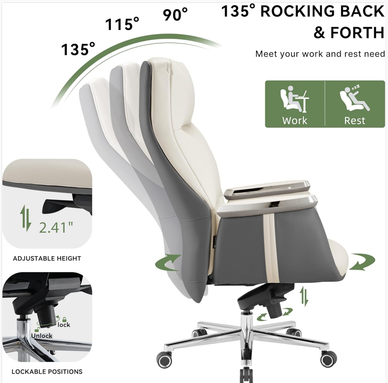
Image 5.1: Illustration of the chair's adjustable height and rocking/recline capabilities, allowing for various working and resting positions.