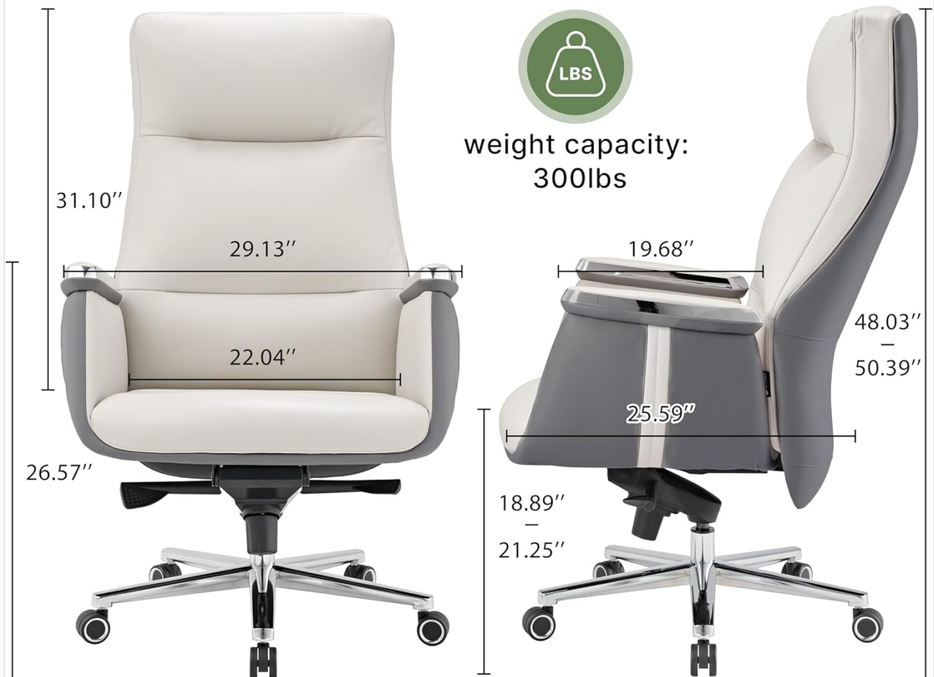
Image 8.1: Detailed product dimensions, including backrest height, seat width, and overall chair dimensions.