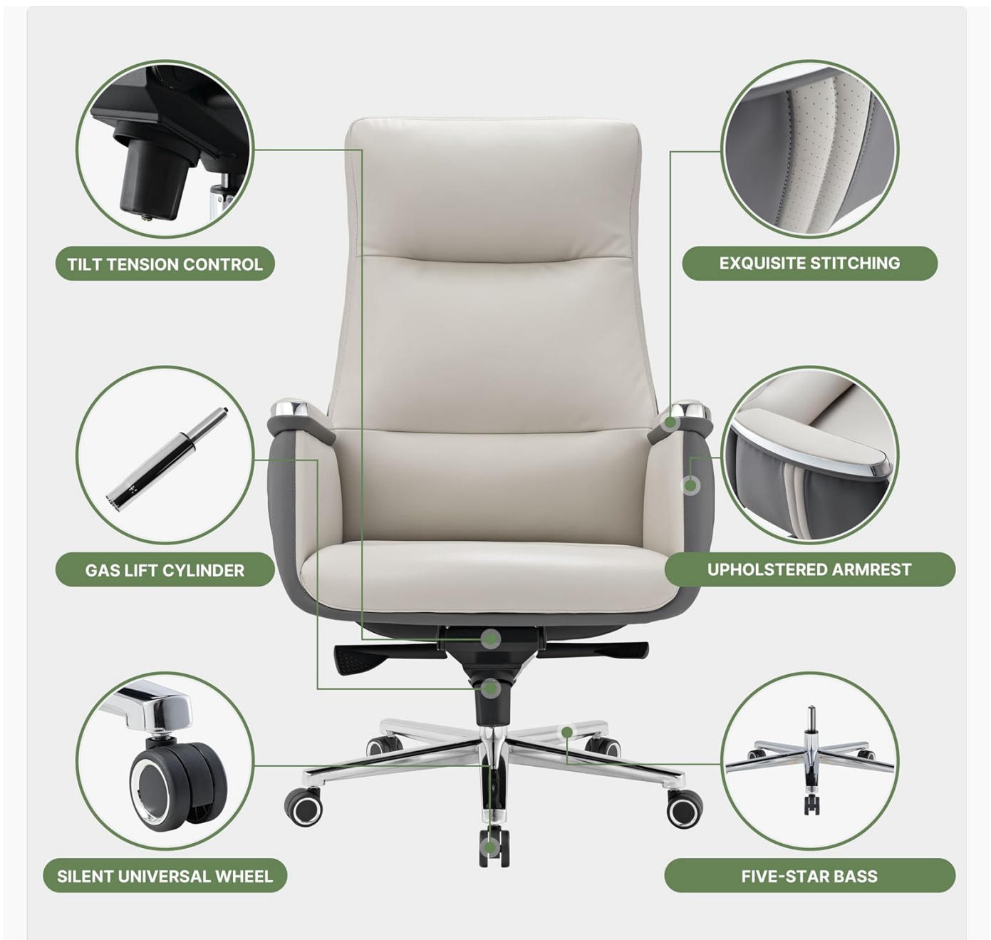
Image 3.1: Exploded diagram illustrating the various components of the Royal II Executive Office Chair.