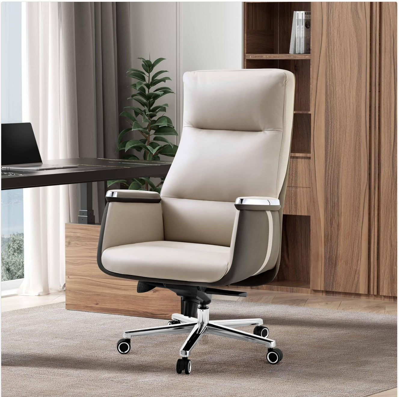
Image 1.1: The EUREKA ERGONOMIC Royal II Executive Office Chair, showcasing its design and presence in an office environment.