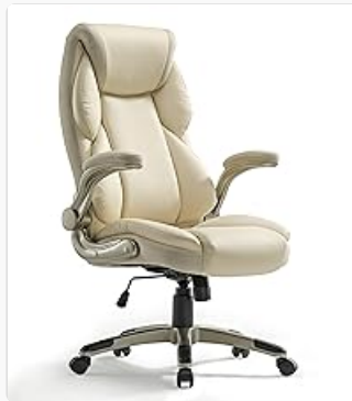
Image 5.3: Detail of the integrated and padded armrests, providing soft support.

The chair is equipped with fixed, upholstered armrests designed for comfort and support. These armrests are not adjustable in height or position.