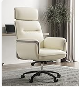
Image 5.2: Visual representation of the chair's head and neck support and the ergonomic lumbar zone designed to relieve back pressure.

The chair features an S-curve lumbar support design integrated into the backrest, providing ergonomic support to the lower back. This is a fixed ergonomic design and does not require manual adjustment.