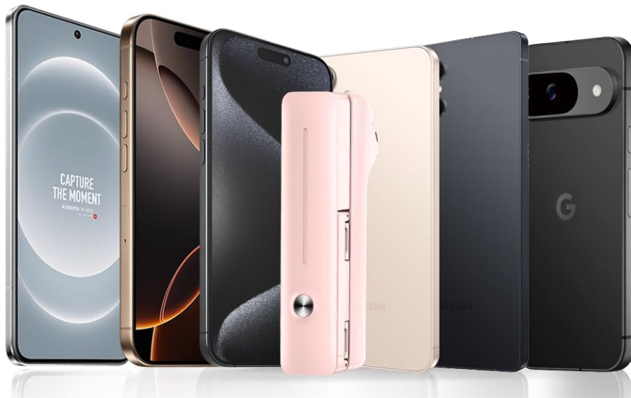
Figure 3: Wide Smartphone Compatibility

This image demonstrates the selfie stick's wide compatibility, showing it can hold various smartphone models ranging from 4 to 7 inches, with an adjustable clip from 2.4 to 3.9 inches.