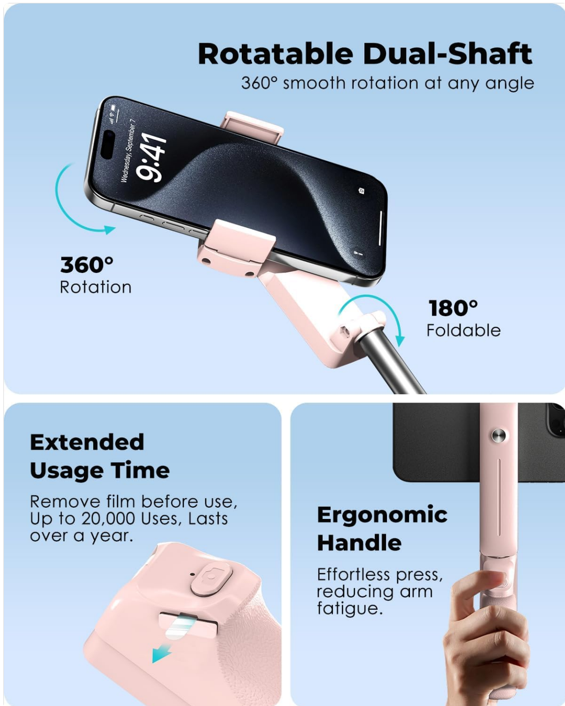
Figure 5: Rotatable Dual-Shaft and Ergonomic Handle

This image highlights the selfie stick's rotatable dual-shaft, allowing for 360-degree smooth rotation, and its ergonomic handle designed for comfortable use.