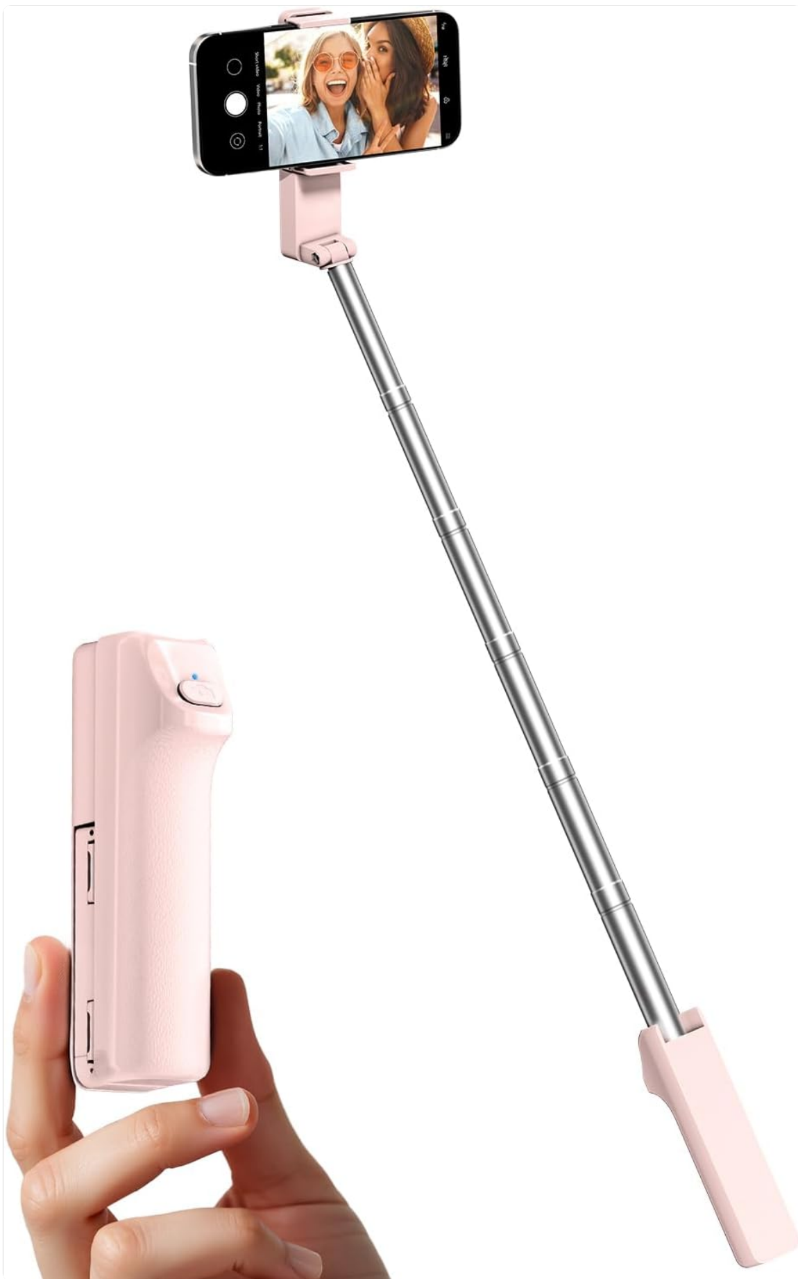
Figure 1: Viozon Portable Selfie Stick (Pink)

This image displays the Viozon Portable Selfie Stick in its extended form with a smartphone mounted, alongside a separate view of the compact remote control held in a hand. The product is pink.