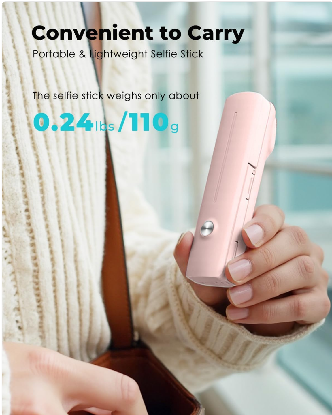
Figure 6: Compact and Lightweight Design

This image shows the Viozon selfie stick in its compact, folded state, being held in a hand and placed into a small bag, illustrating its portability and light weight of 0.24 lbs (110g).