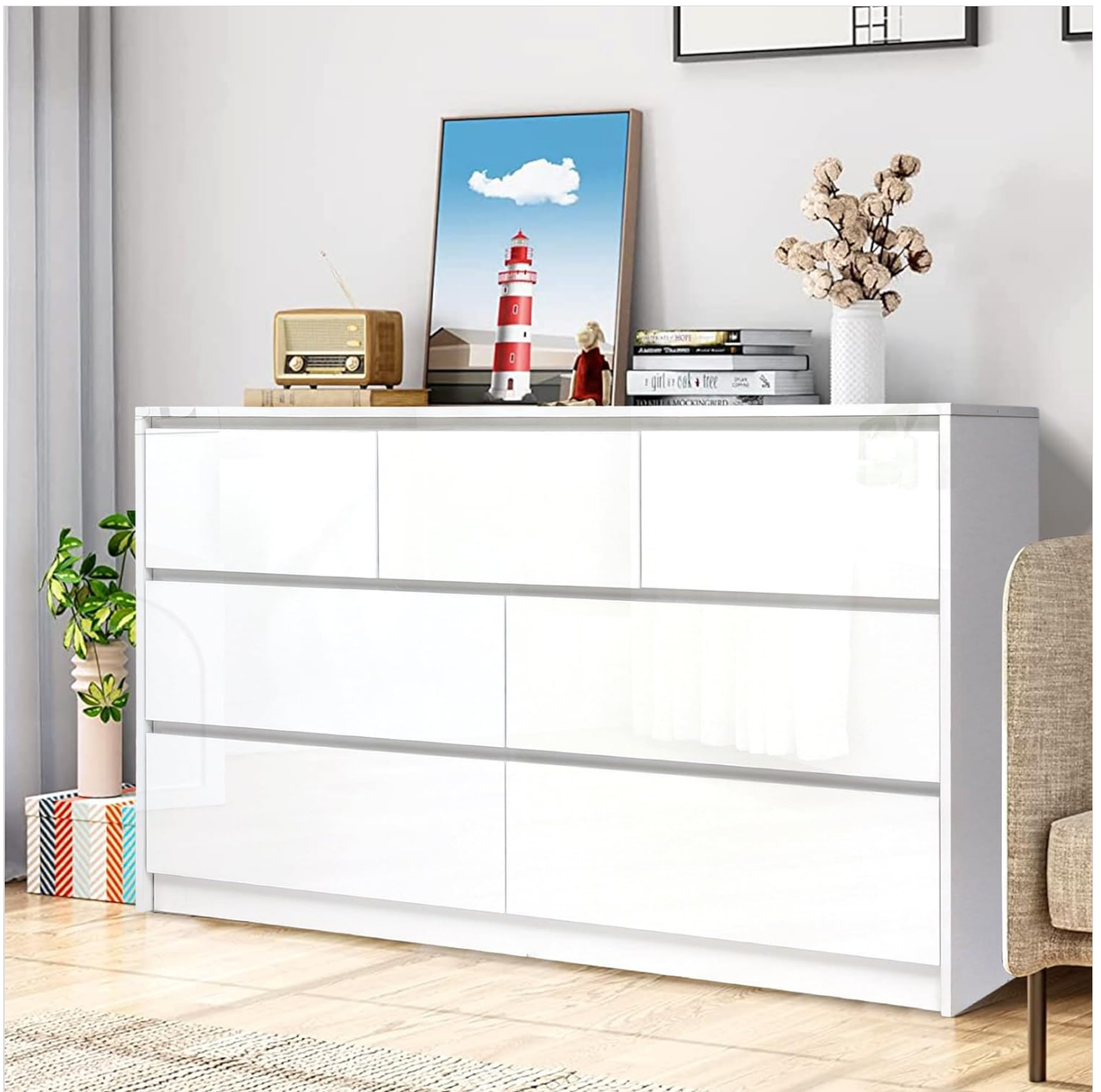
Image: The Dephet White Malm 7 Drawer Dresser, showcasing its sleek, handle-free design and high-gloss finish, positioned in a modern bedroom setting.