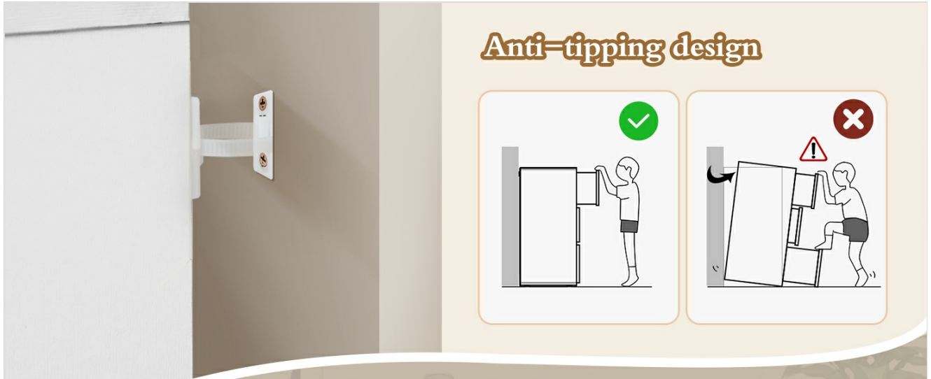
Image: A visual guide illustrating the correct method for installing the anti-tipping device, showing how it securely fastens the dresser to the wall to prevent accidental tip-overs.