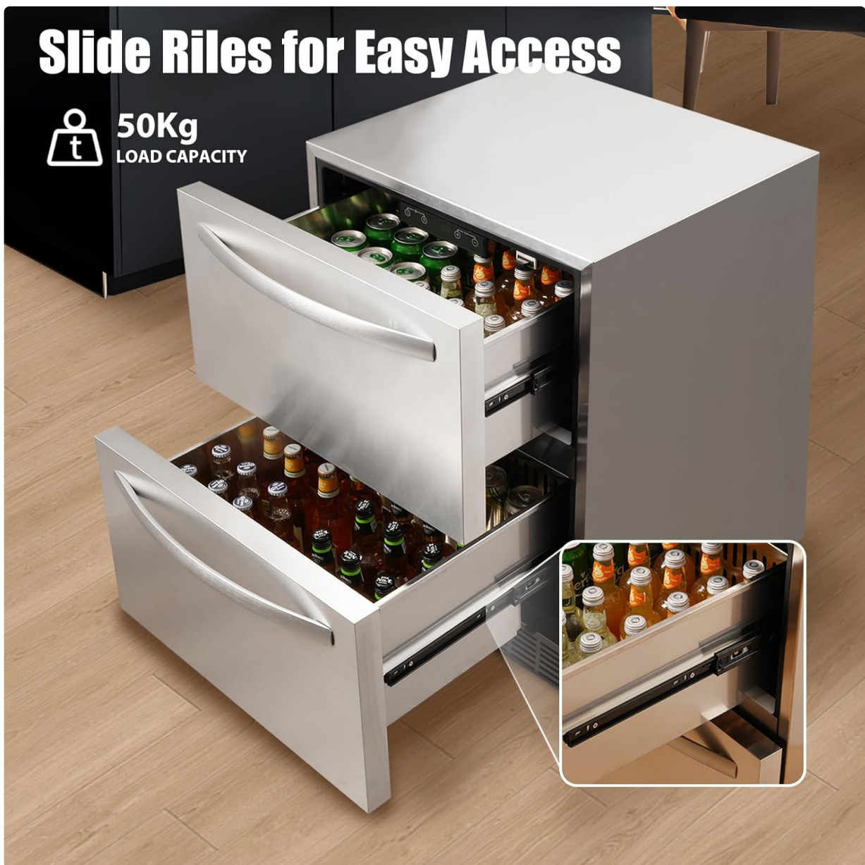
Image 4.2: The open drawers of the HCK refrigerator, showcasing the robust slide rails and the organized arrangement of various beverages using the internal dividers.