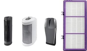
Image: A visual representation of compatible Holmes and Bionaire air purifier models, alongside an image of the filter.

BAP260, BAP815, BAP825, BAP9200, BAP9700, BAP520.