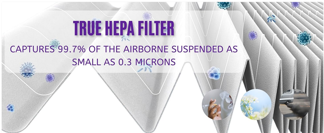
Image: An illustration demonstrating how a True HEPA filter captures 99.7% of airborne suspended particles as small as 0.3 microns, including smoke and environmental pollutants.