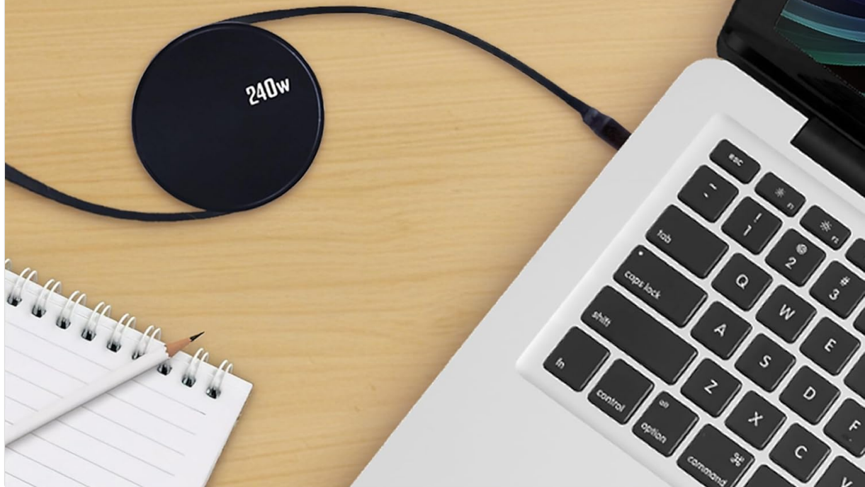
Image: A laptop connected to a power source using the BoxWave PD miniSync 240W cable, illustrating power delivery.

PD miniSync offers high performance charging with a power output of up to 240W