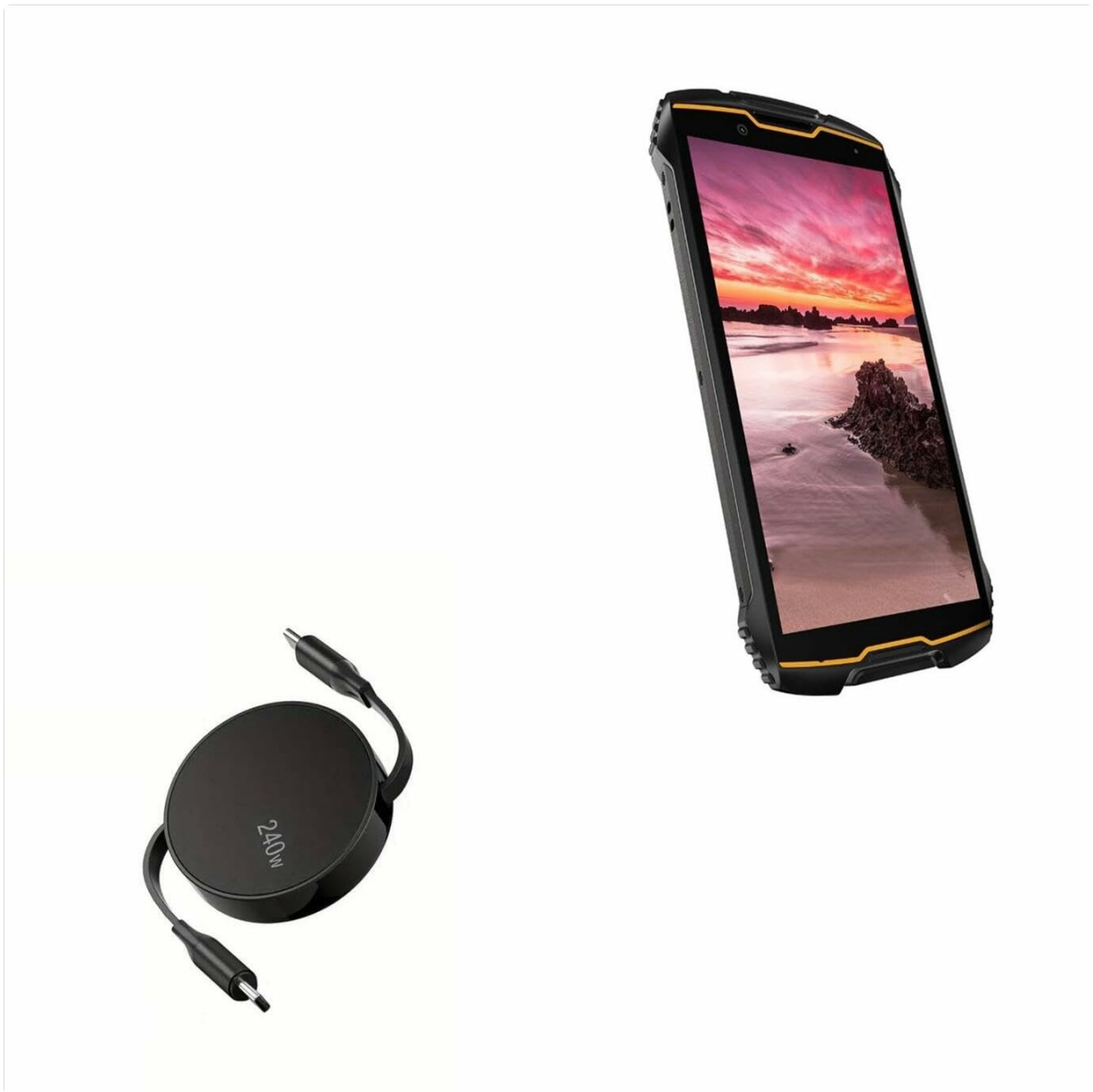
Image: The BoxWave PD miniSync 240W Retractable USB Type-C Cable in its compact, retracted state.