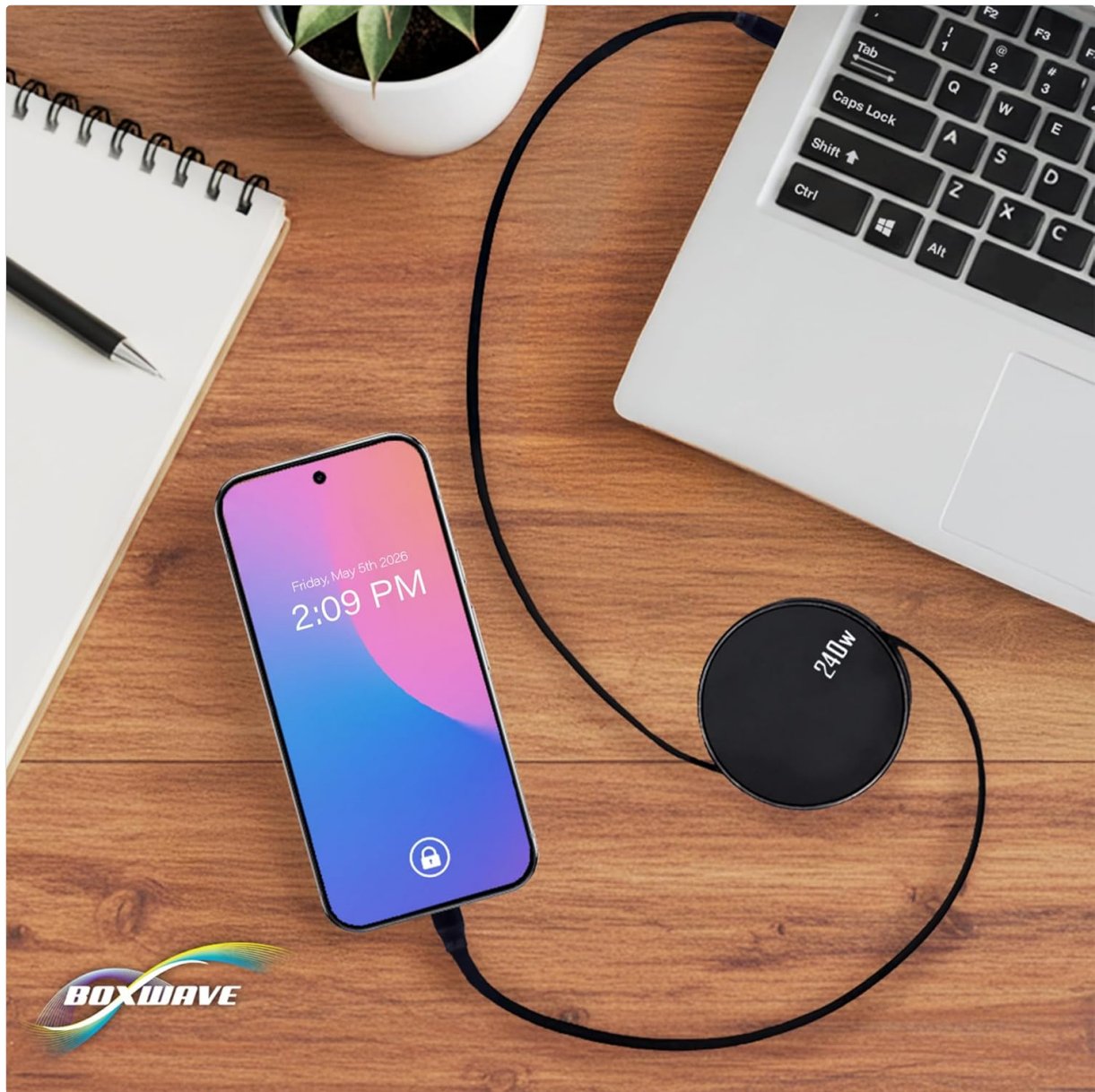
Image: A smartphone connected to a laptop via the BoxWave PD miniSync cable, demonstrating a typical setup.