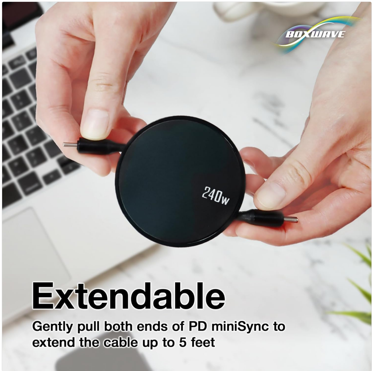
Image: Hands demonstrating how to gently pull both ends of the PD miniSync to extend the cable.