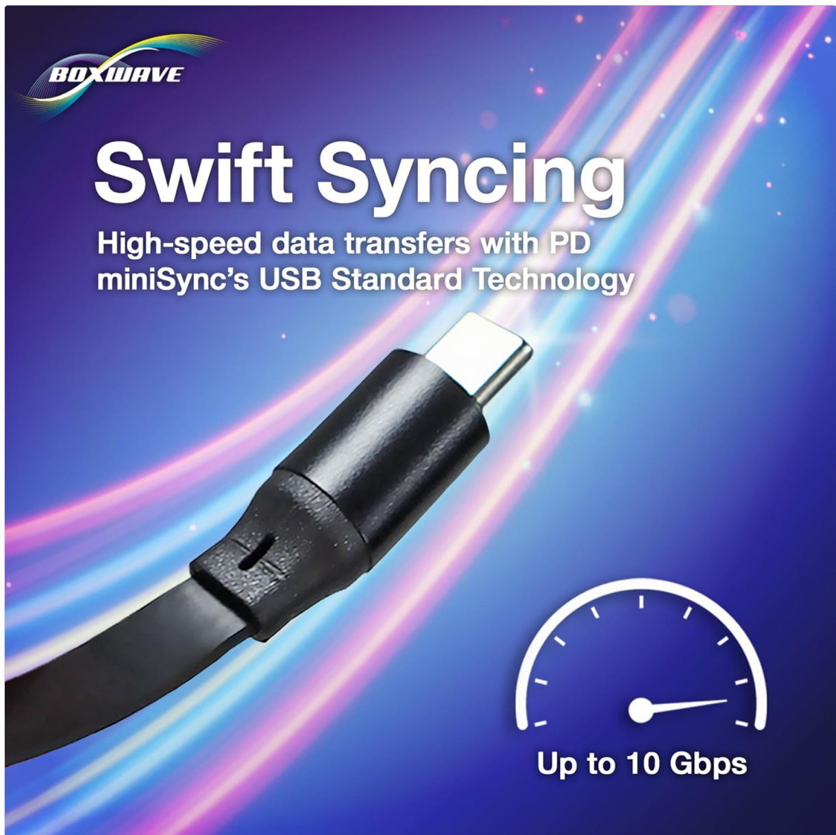
Image: Close-up of a USB Type-C connector, highlighting its role in swift data syncing.