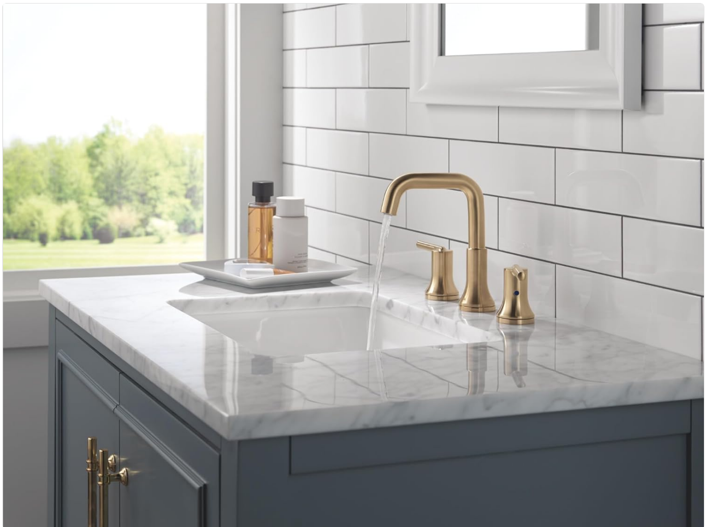
Figure 7: The Delta Trinsic faucet installed and in operation on a bathroom vanity, demonstrating its functional elegance.