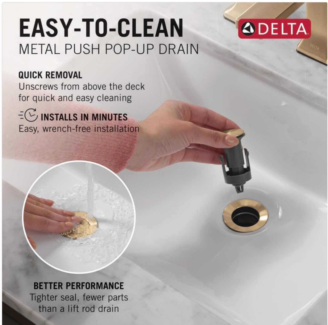
Figure 8: Visual guide demonstrating the easy removal and cleaning of the metal push pop-up drain, ensuring better performance and hygiene.