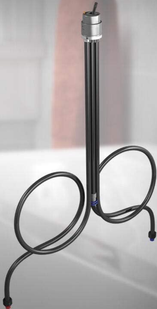
Figure 5: Visual representation of InnoFlex PEX supply lines, integrated into the faucet to resist cracks, kinks, and corrosion.

MADE TO RESIST CRACKS, KINKS AND CORROSION