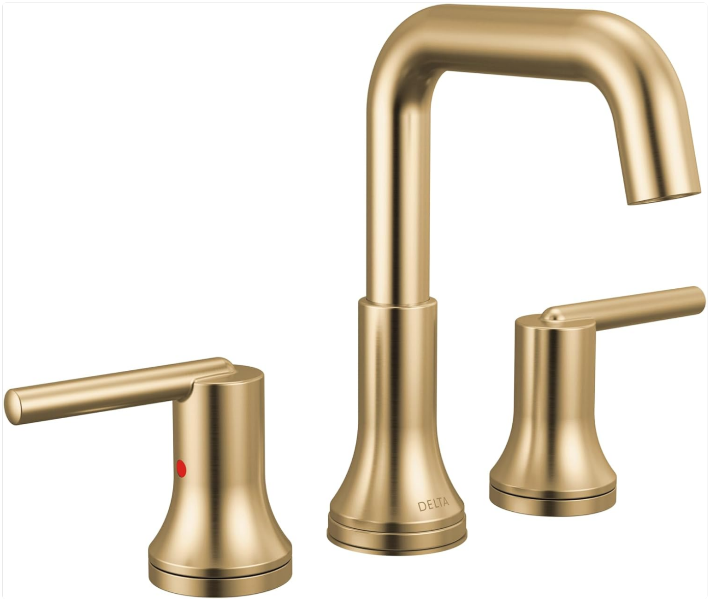
Figure 1: The Delta Trinsic U-Spout Widespread Bathroom Faucet in Champagne Bronze finish, featuring a high arc spout and two lever handles.