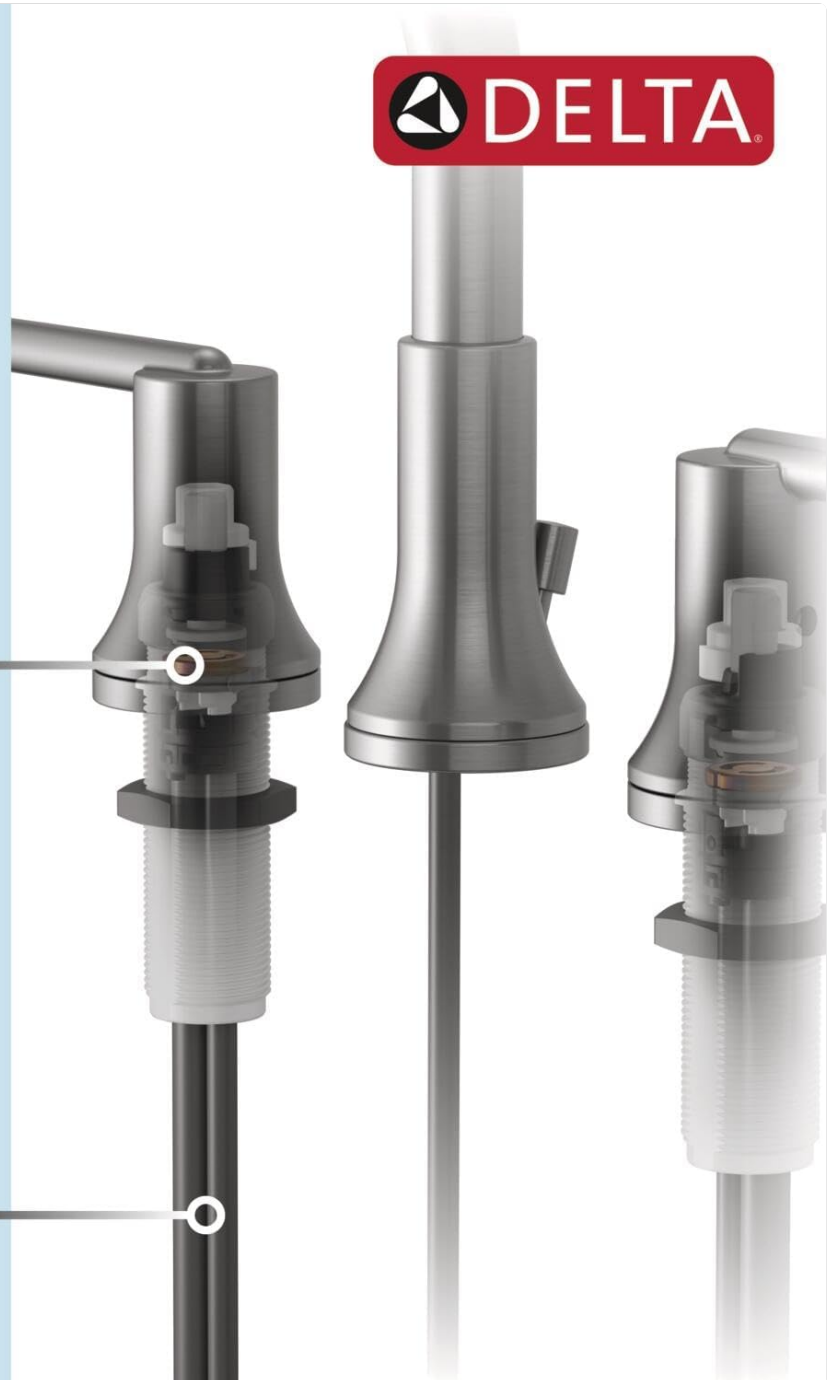
Figure 2: Illustration of Delta's DIAMOND Seal Technology, highlighting the DIAMOND Valve and InnoFlex PEX supply lines for leak-free operation.

*Industry standard is based on ASME A112.18.1 of 500,000 cycles