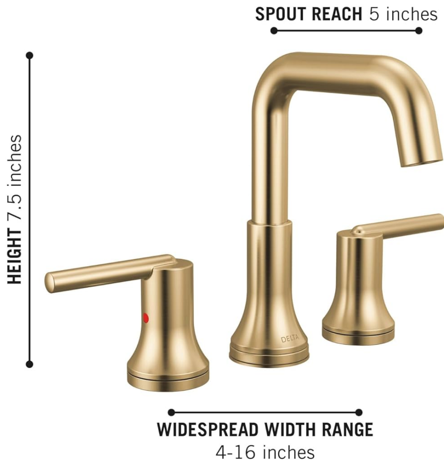
Figure 6: Detailed dimensions for the Delta Trinsic Widespread Bathroom Faucet, including height, spout reach, and installation hole requirements.