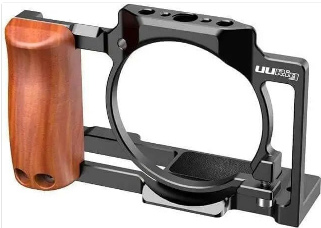
Figure 2.1: The Ulanzi UURig R056 L-Plate. This image displays the black metal L-plate with a brown wooden grip on the left side. The plate is designed to fit around the camera body, providing a secure attachment point and multiple threaded

The Ulanzi UURig R056 L-Plate is a custom-fit accessory that provides a secure base and additional mounting points for your Sony ZV1 camera. It features a robust metal construction with a comfortable wooden grip, designed for ergonomic handling and enhanced stability.