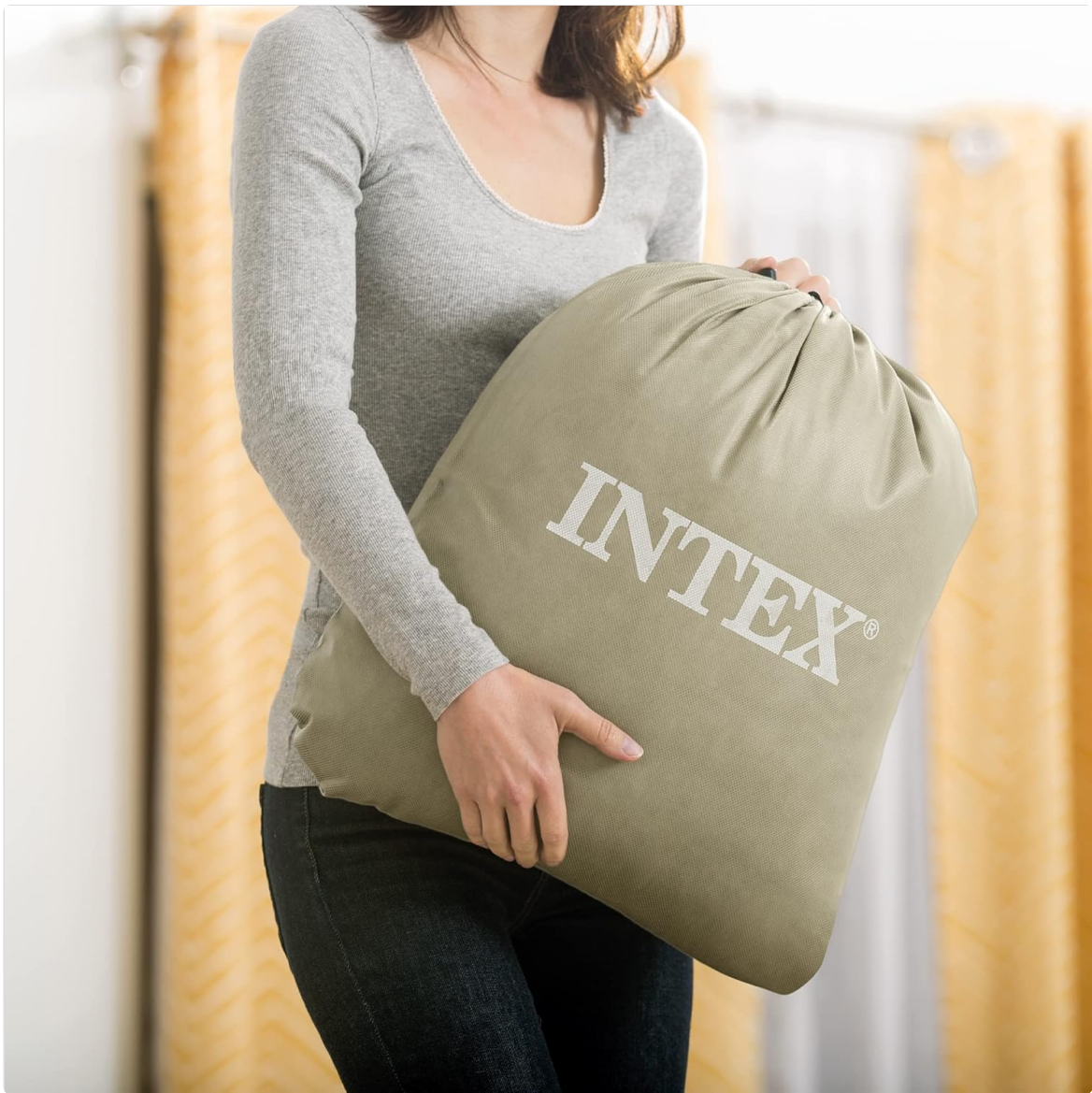
Image: A person holding the Intex carry bag, designed for easy transport and storage of the deflated air mattress.