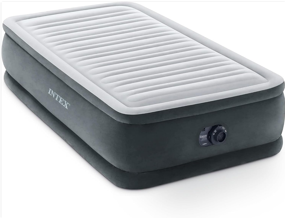
Image: The Intex Dura-Beam Deluxe Comfort-Plush Mid-Rise Air Mattress in Twin size, grey color, showcasing its elevated design and integrated pump.