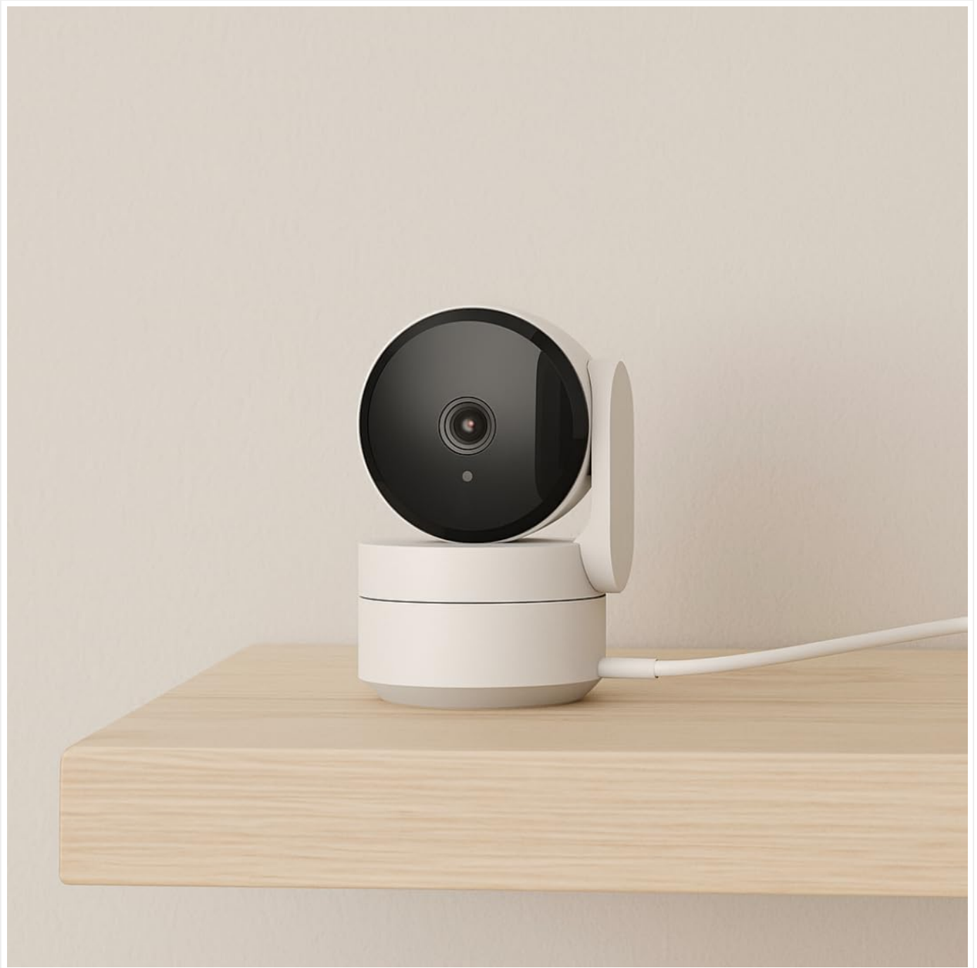
Image 2.1: The Daewoo IP506P indoor camera, featuring a privacy function where the lens retracts when not in use.