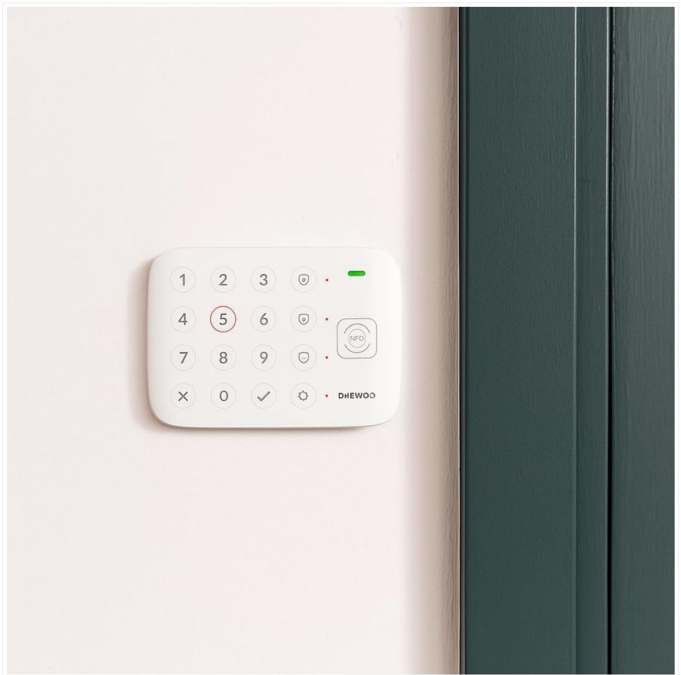
Image 2.2: The Daewoo Vigilias alarm keypad, typically mounted near an entry point for easy arming and disarming.