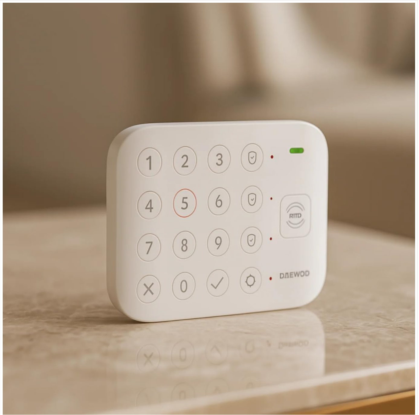
Image 4.1: The Daewoo Vigilia alarm keypad, highlighting the integrated RFID reader for badge access.