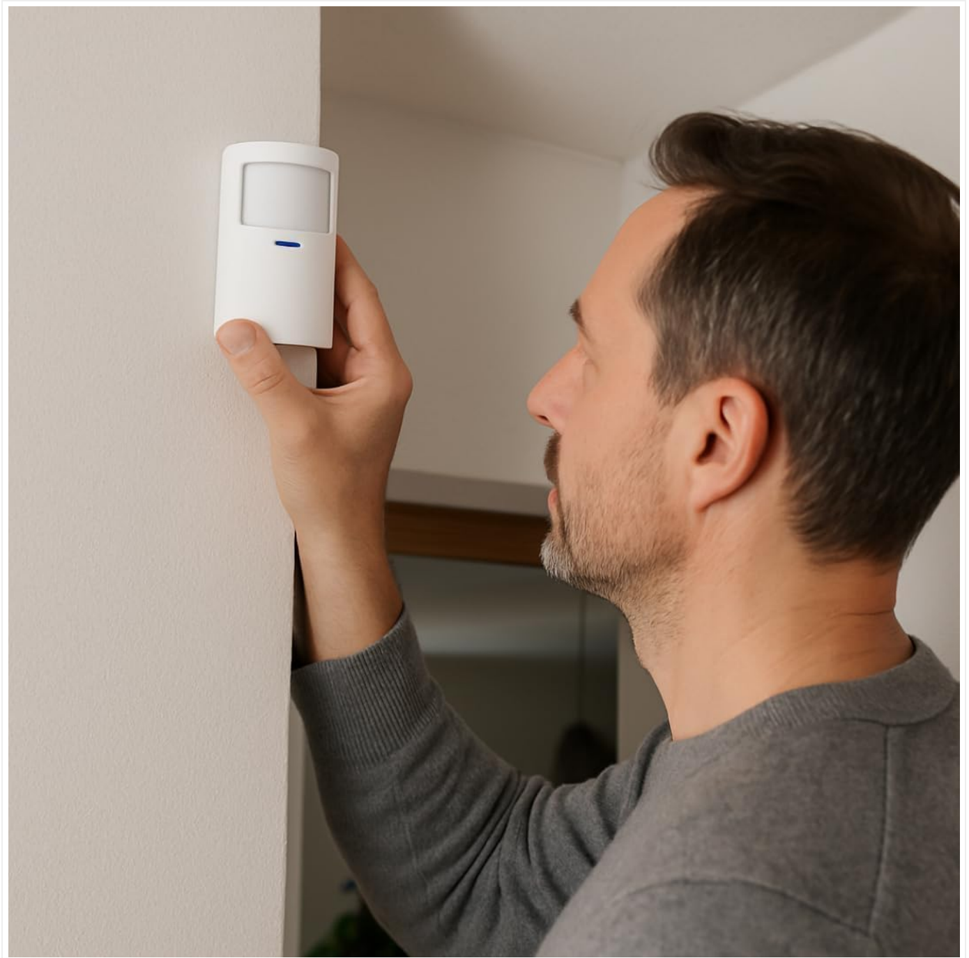
Image 3.1: A user installing the Daewoo Vigilia motion detector on a wall, demonstrating typical placement for optimal coverage.

Refer to the detailed installation guide provided with your product and available tutorial videos for specific instructions.