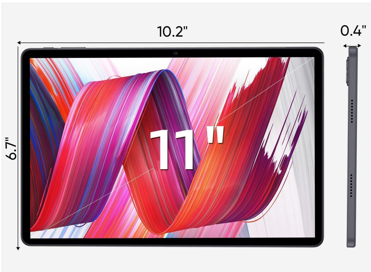
Image: Dimensional diagram of the tablet, indicating its length, width, and thickness.

The tablet features an 11-inch display with a compact design for easy handling.