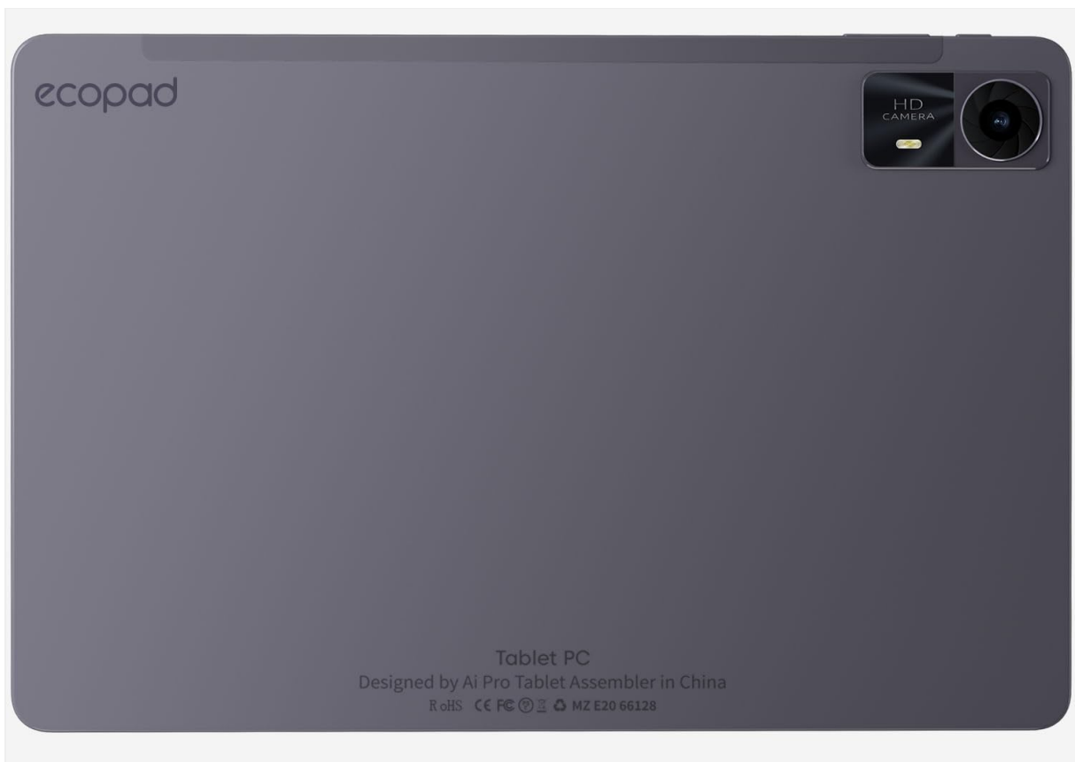
Image: Rear view of the ECOPAD tablet, highlighting the camera and branding.