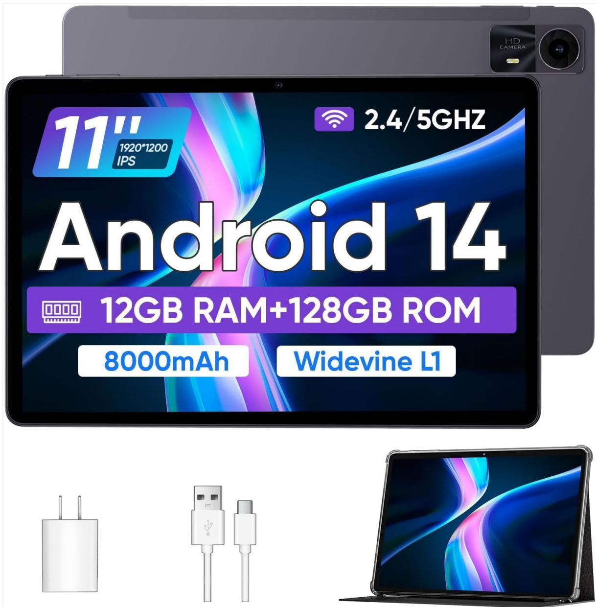
Image: The ECOPAD 11-inch Android 14 Tablet displayed with its accompanying Type-C charging cable, protective case, and power adapter.