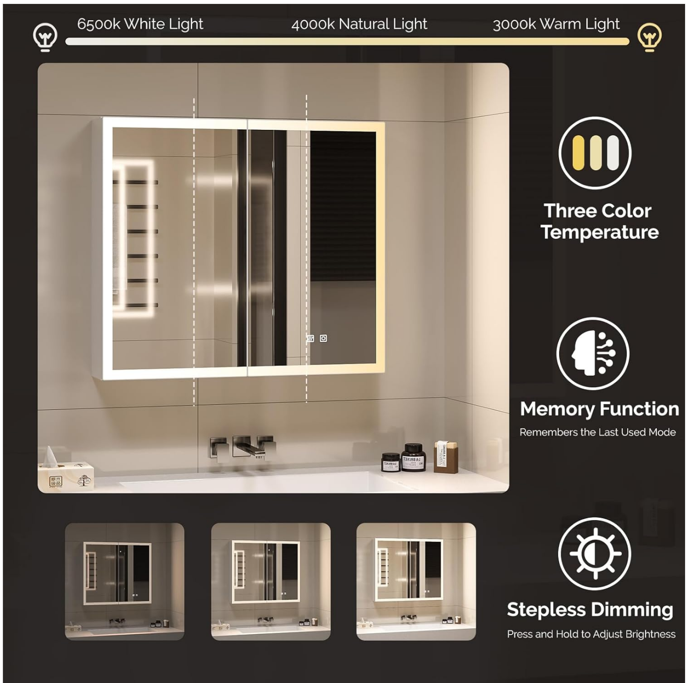
Image 6.2: Demonstrates the three available color temperatures and dimming functionality.