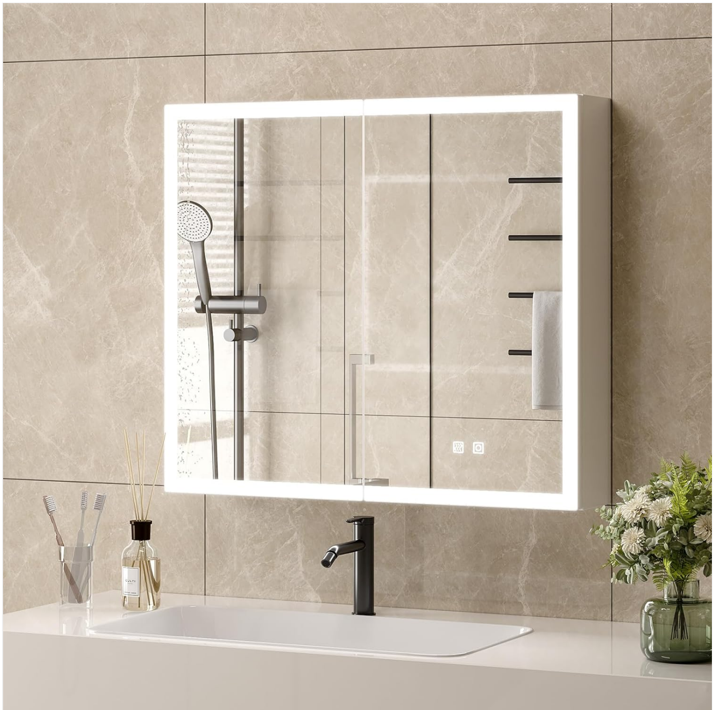
Image 1.1: The VINGLI Lighted Medicine Cabinet, showcasing its illuminated mirror and sleek design above a bathroom sink.