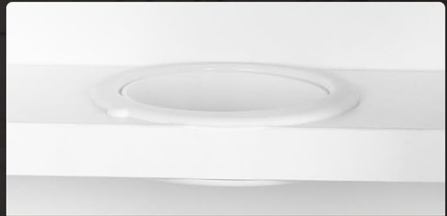
Hairdryer Slot Design Easily solves hairdryer storage issue