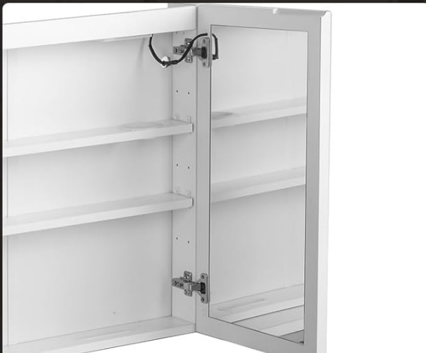
Inside HD Mirror Clear reflection for quick touch-ups and makeup