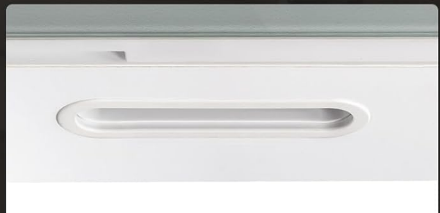
Tissue Slot Design Convenient for daily use