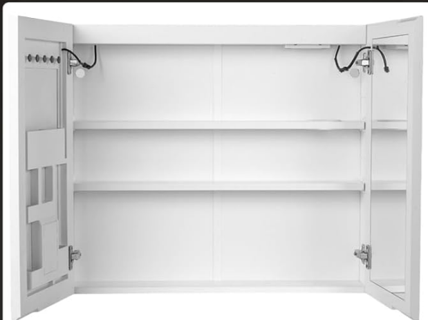
Design of The Door-Back Storage Area Easily take items you want