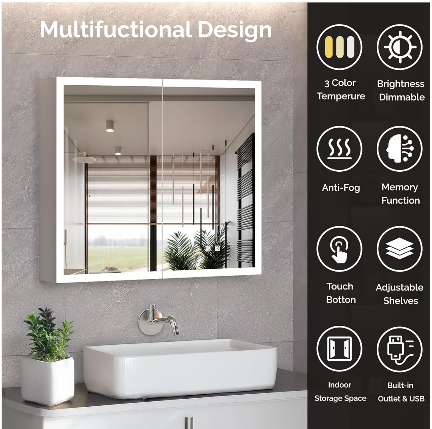
Image 6.1: Overview of the cabinet's multifunctional design and features.