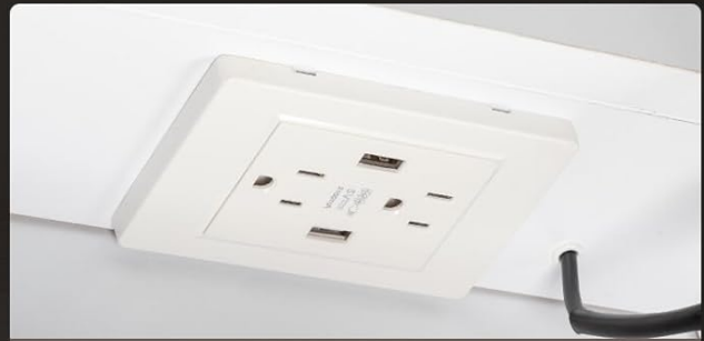
Built-in Outlet & USB Thoughtful details for your convenience