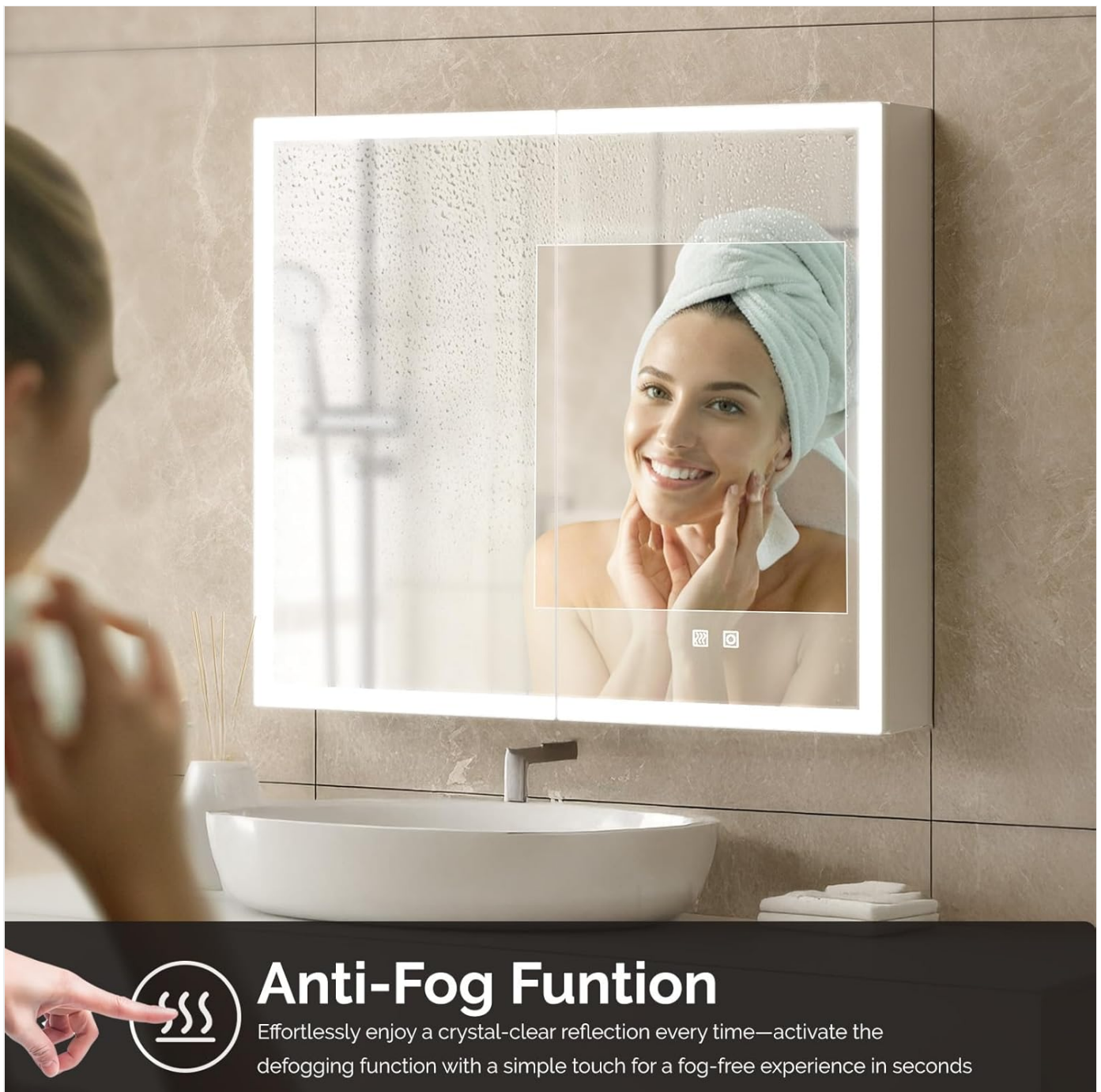
Image 6.3: The anti-fog function ensures a clear mirror surface, even in humid conditions.