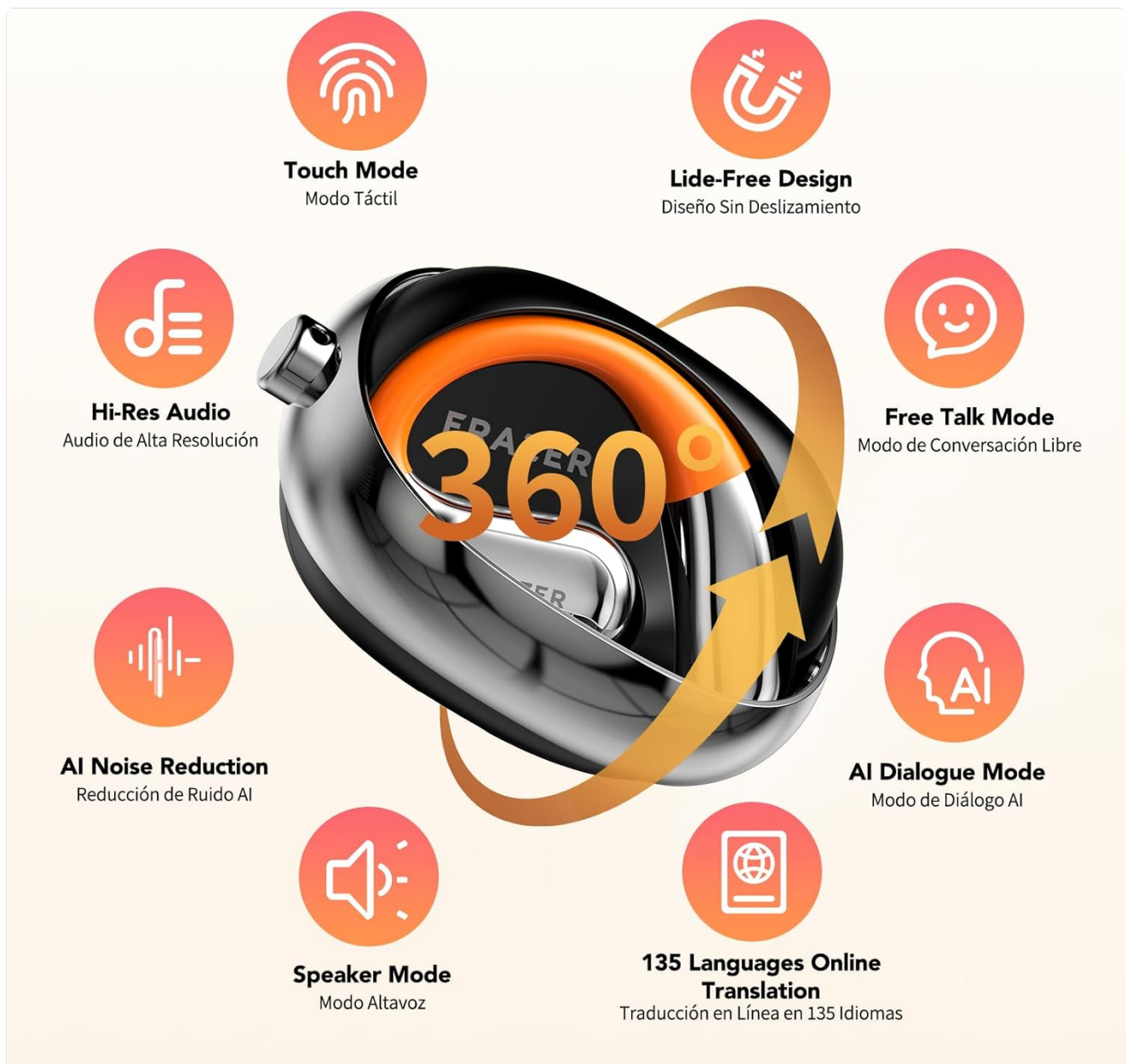
Image: An overview of key features including Touch Mode, Lide-Free Design, Free Talk Mode, AI Dialogue Mode, 135 Languages Online Translation, Speaker Mode, AI Noise Reduction, and Hi-Res Audio.