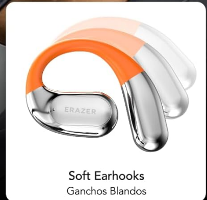
Image: The ERAZER XF31 earbuds highlighting their open-ear comfort, lightweight design, LED light strip, soft earhooks, and IPX5 waterproofing for stress-free sports.