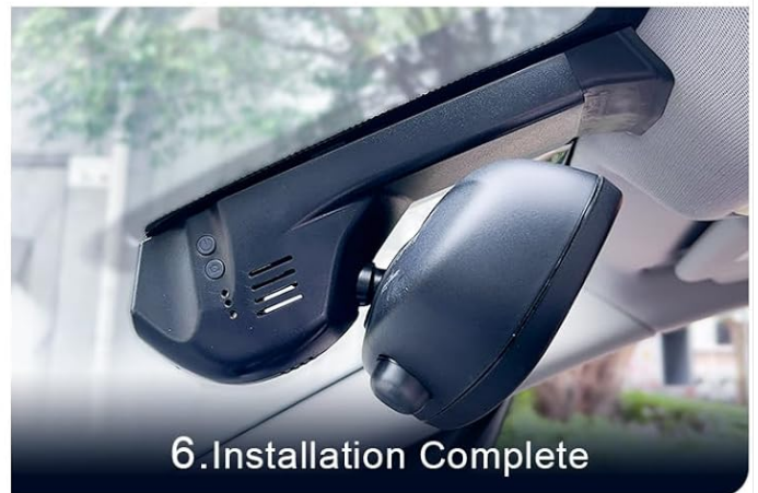
Figure 3: Step-by-step installation process for the Mangoal 4K Dash Cam.