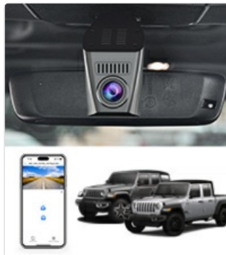
Figure 1: All components included in the Mangoal 4K Dash Cam package.