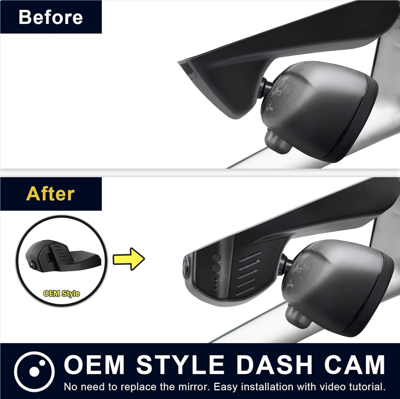
Figure 5: Visual representation of the dash cam's OEM style integration.