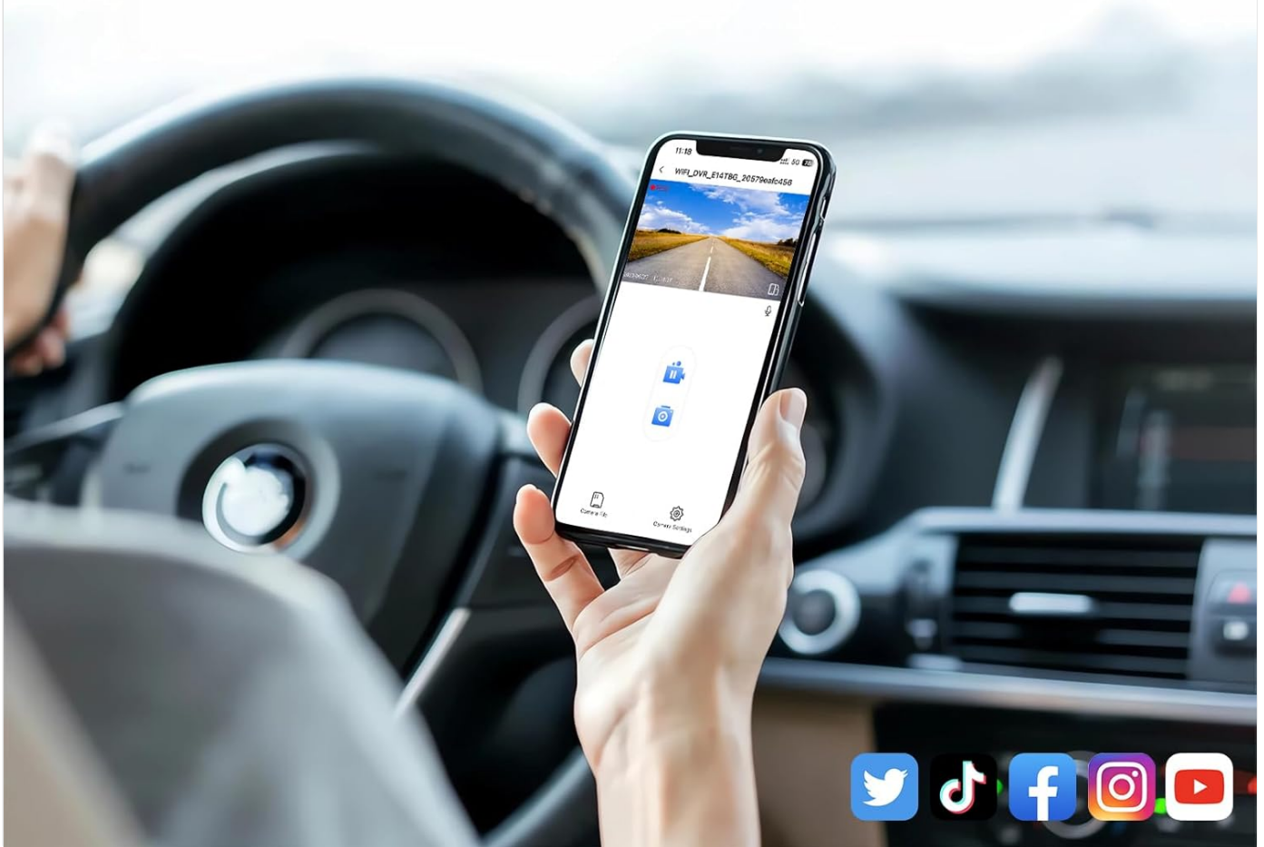
Figure 6: Easy access and control via the SkyCamm mobile application.

Dedicated apps connect to WiFi for live viewing, live photo and video sharing