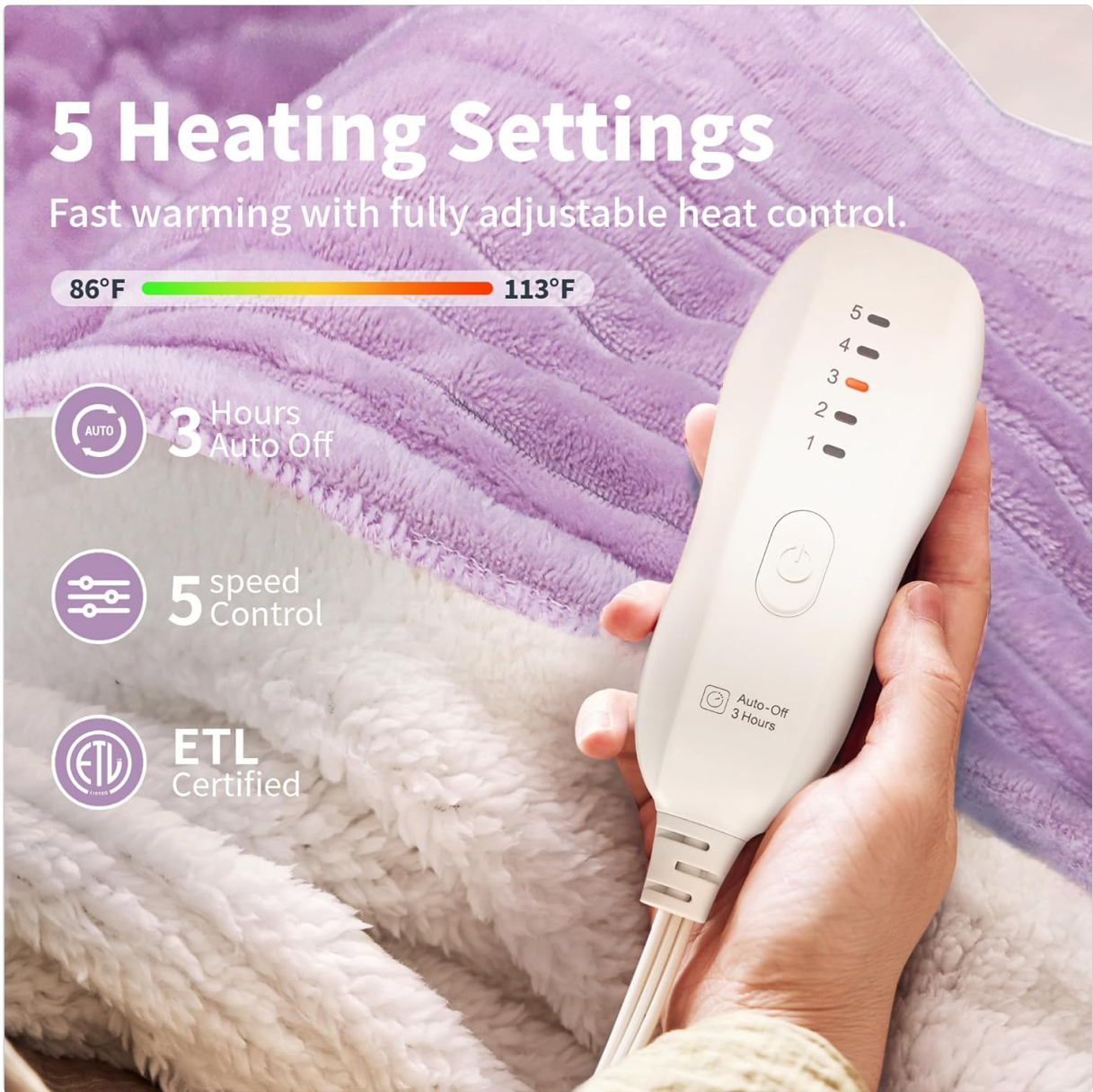
Image: A close-up view of the blanket's digital controller, highlighting the 5 heat settings and the 3-hour auto-off indicator. This demonstrates the user interface for temperature and timer control.