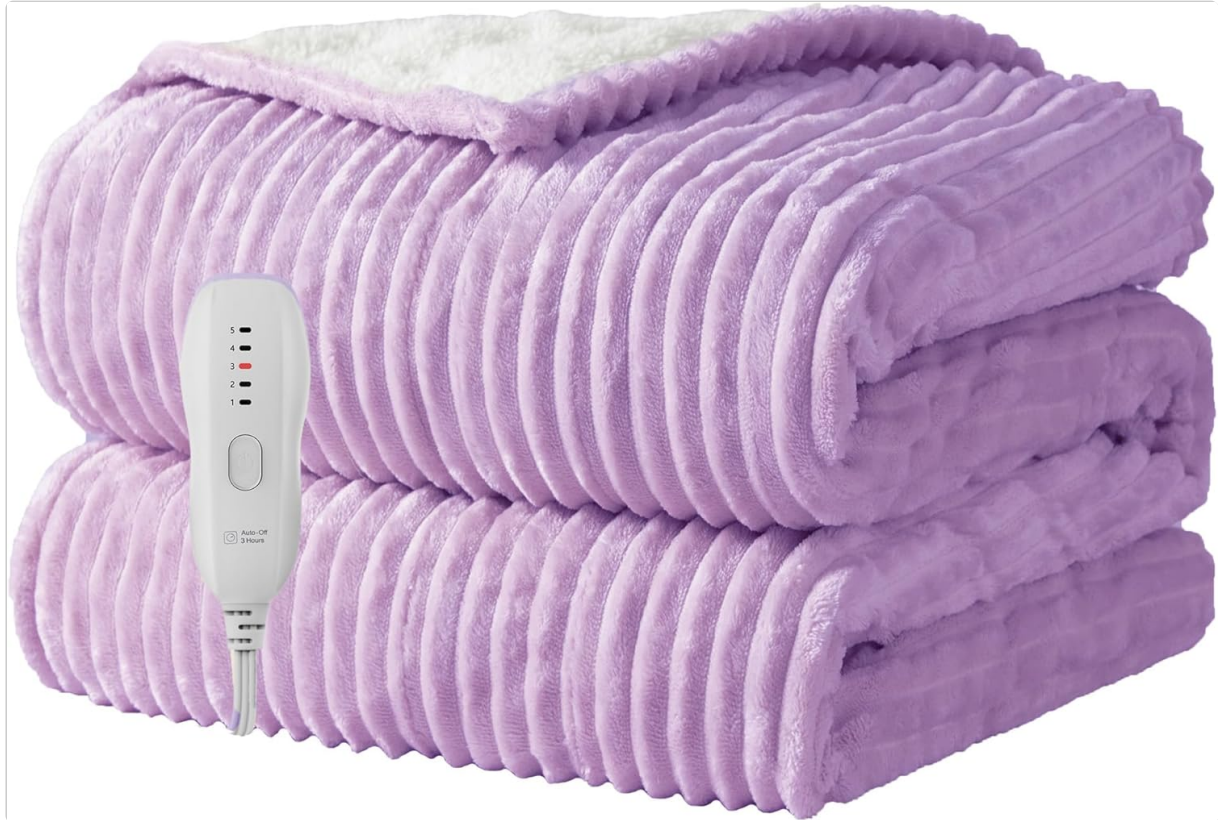
Image: The Texciting Heated Blanket Electric Throw, folded, with its detachable controller. This image illustrates the product's appearance and the controller's connection point.