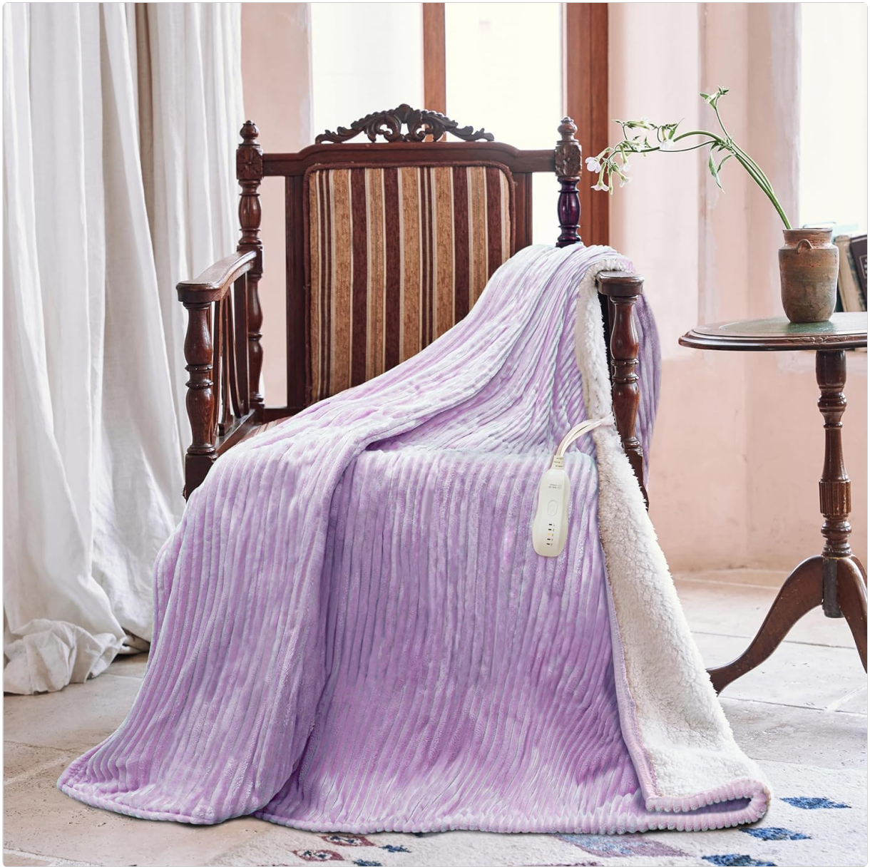
Image: The purple heated blanket draped over a classic wooden chair, showcasing its use as a comfortable throw in a home setting. The controller is visible hanging from the side.