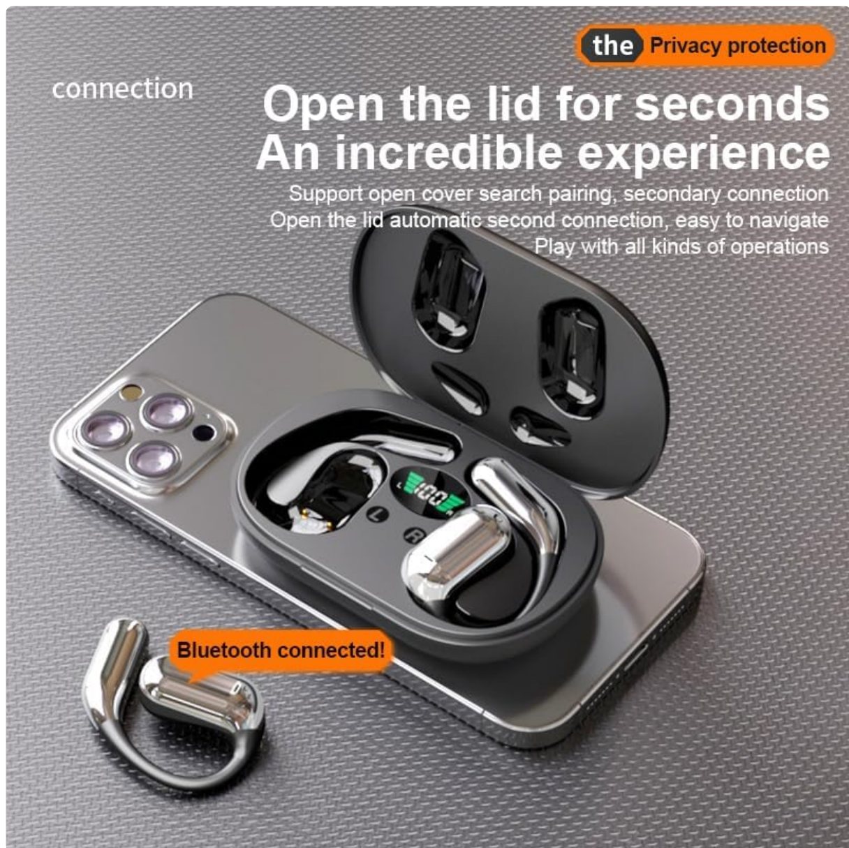
Figure 4.1: The Q16 earbuds connected to a smartphone, indicating successful Bluetooth pairing.