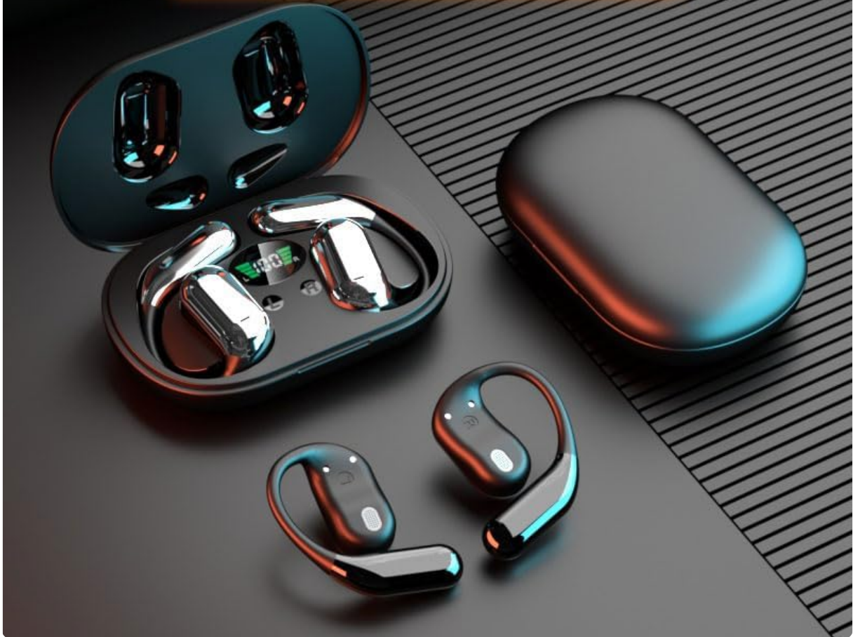
Figure 3.1: Q16 Earbuds in their charging case, showing the left (L) and right (R) indicators along with the digital battery display.

Stereo surround sound quality Light and unflattering