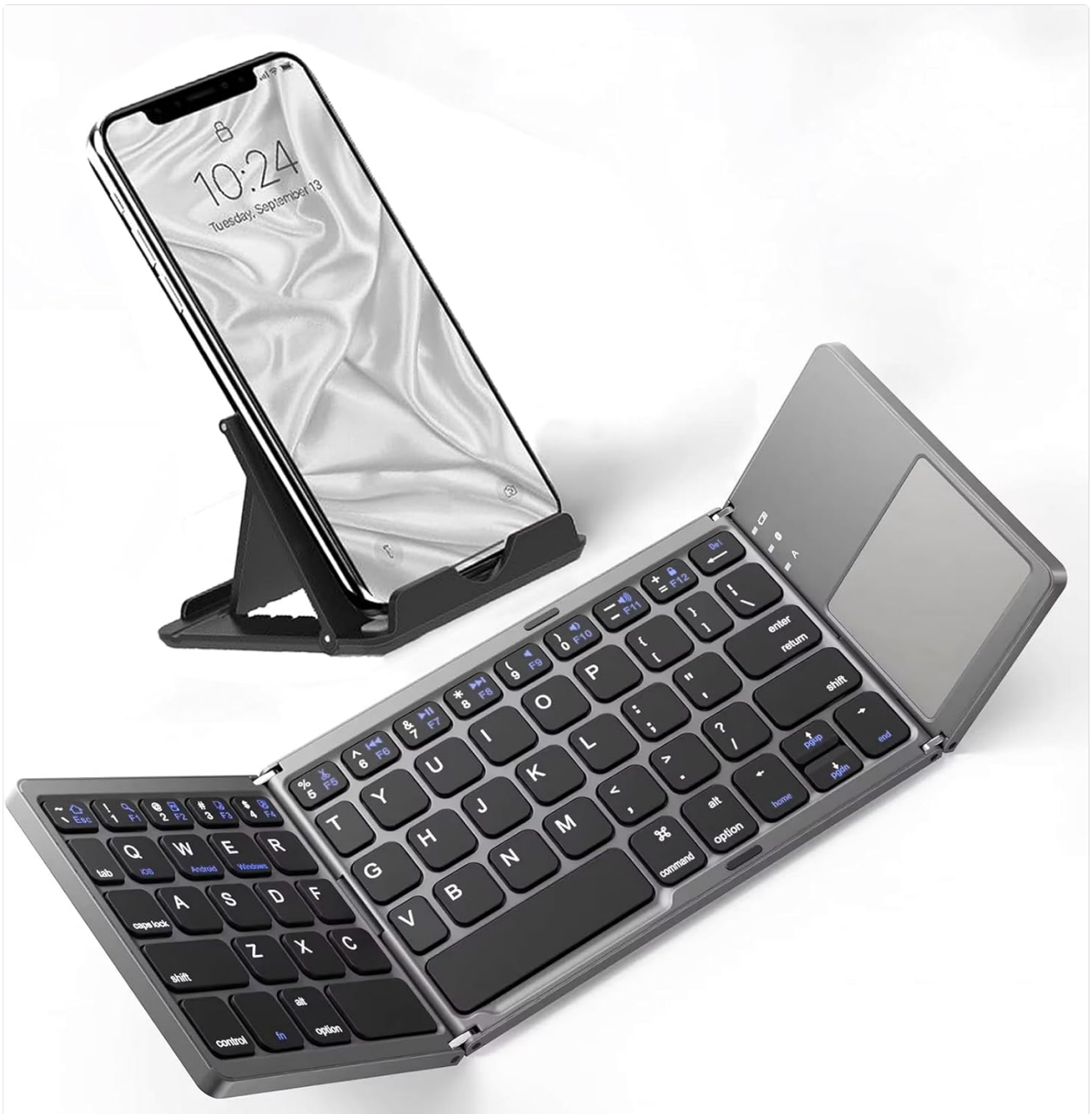
Image 1.1: The keyboard unfolded, shown with a smartphone in a stand (stand not included).