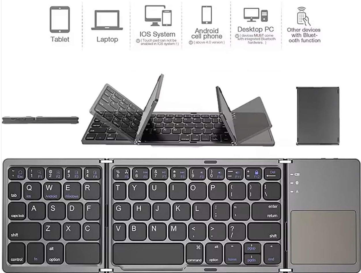
Image 2.2: Multi-connect diagram illustrating compatibility with various operating systems.