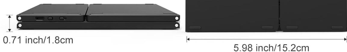
Image 6.1: Detailed dimensions of the keyboard in both unfolded and folded states.