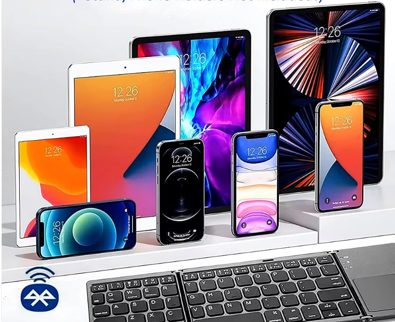
Image 2.3: The keyboard's compatibility with multiple device types.

Your browser does not support the video tag.