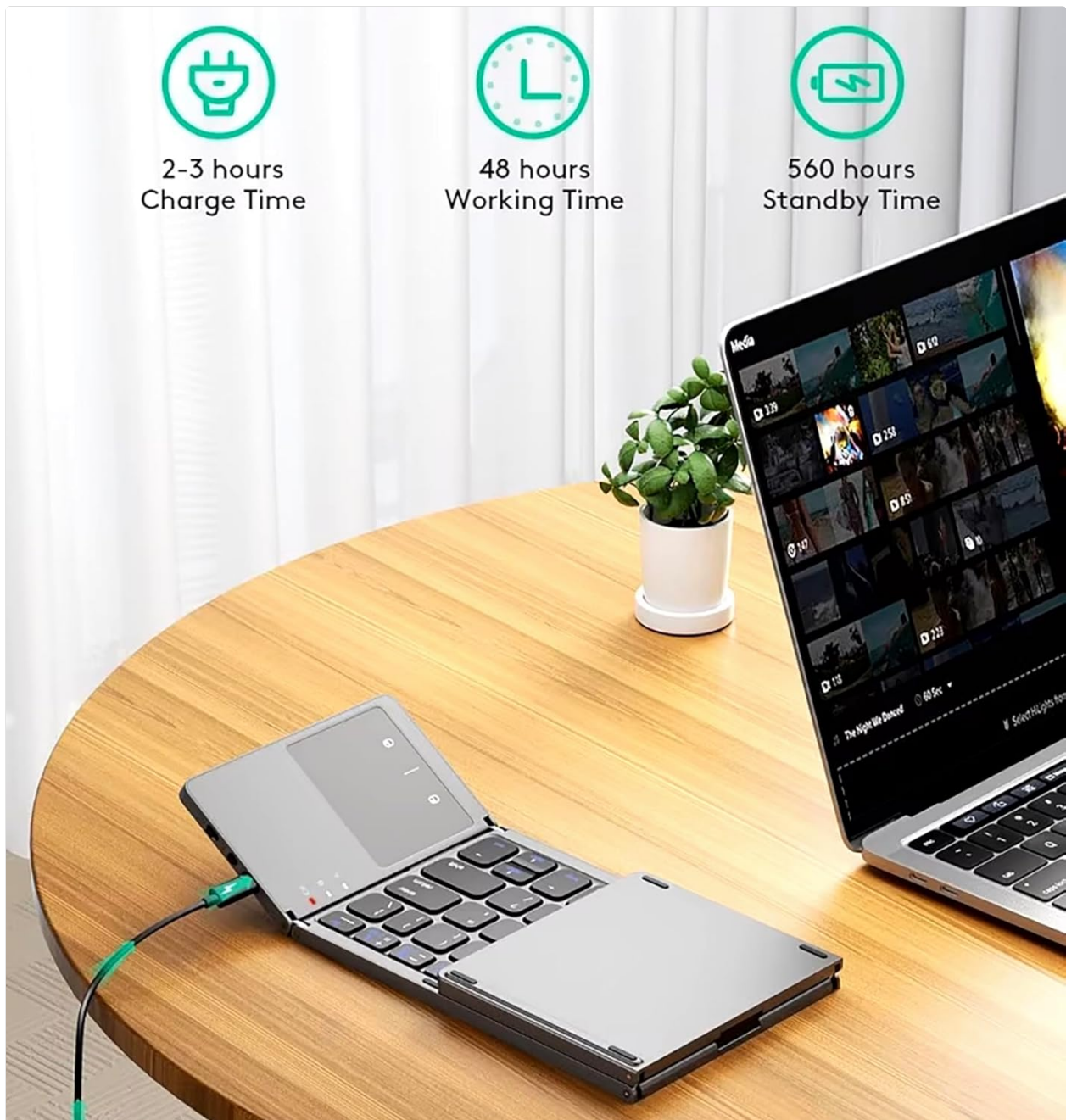
Image 2.1: Visual representation of charging and battery life metrics.