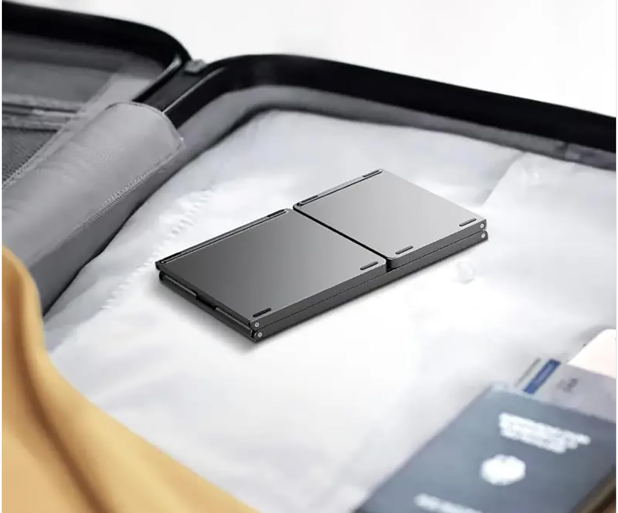
Image 1.2: The keyboard in its folded, compact state, placed inside a suitcase for travel.