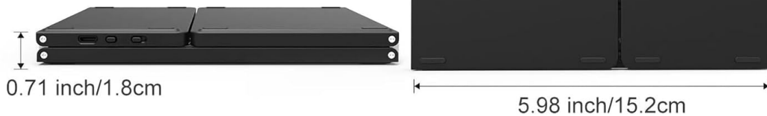
Image: Keyboard dimensions in both unfolded and folded states.