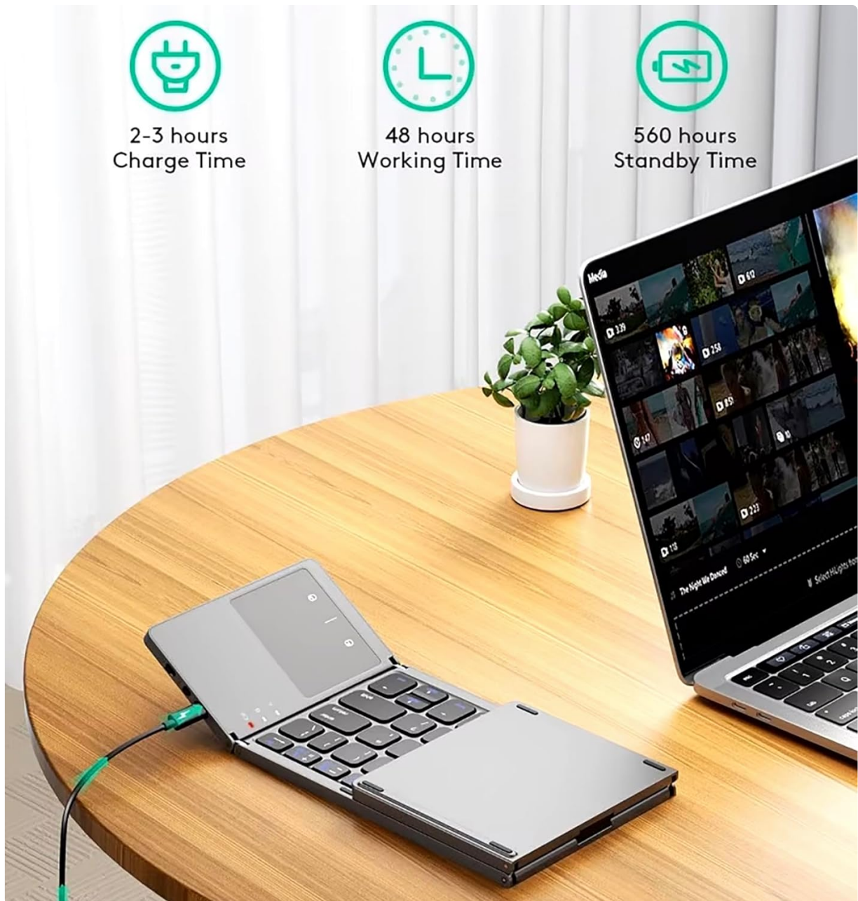
Image: Charging the keyboard and battery life indicators.