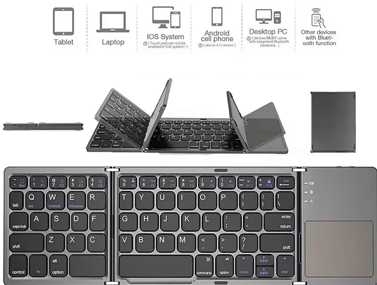
Image: The keyboard supports multiple operating systems and devices.