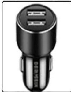
A car bug