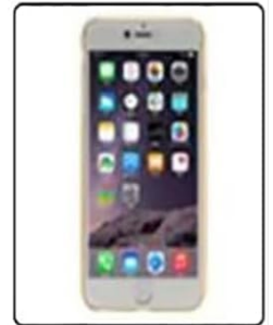
Mobile Trojan monitoring

Image: An illustrative diagram showing various types of illegal monitoring devices the Fyzuf detector can identify, including GPS trackers, watch cameras, pinhole cameras, light bulb cameras, switch cameras, row cameras, in-ear bugs, car bugs, USB flash drive bugs, and mobile Trojan monitoring.