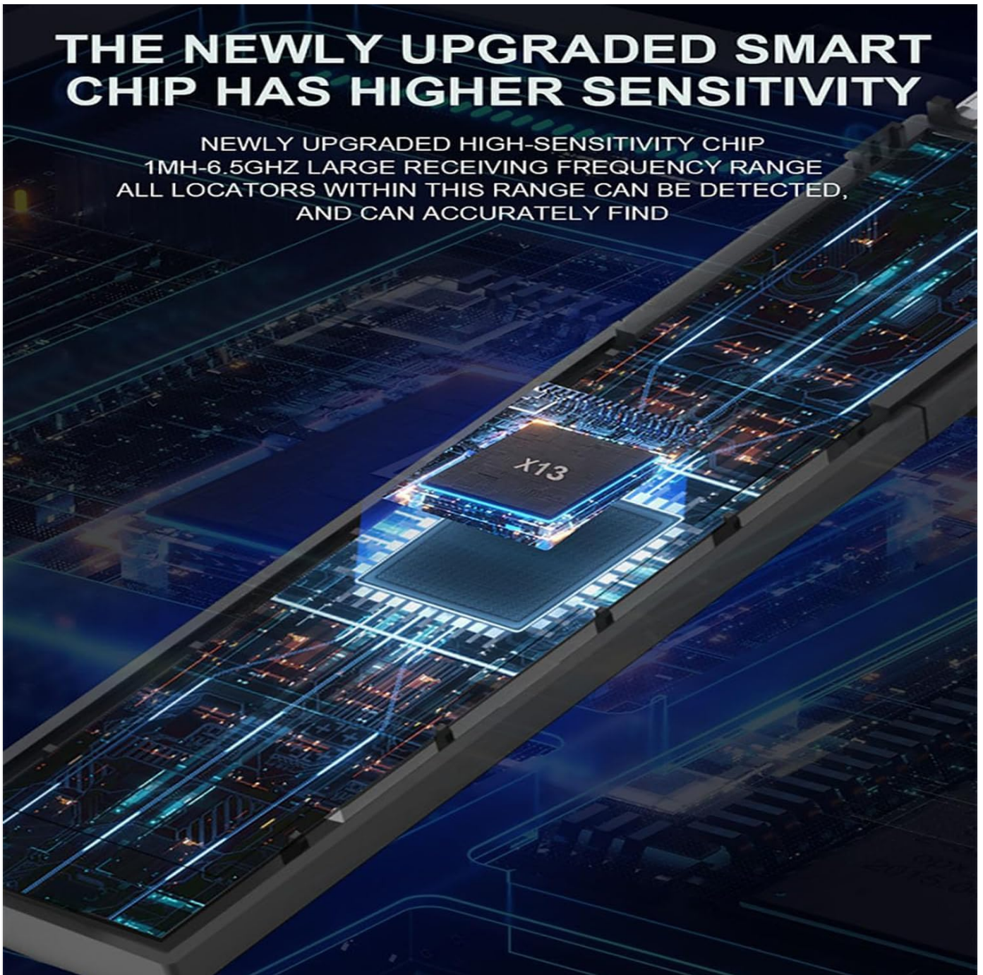
Image: Internal view highlighting the upgraded smart chip, which provides higher sensitivity and a wide receiving frequency range for accurate detection.

NEWLY UPGRADED HIGH-SENSITIVITY CHIP 1MH-6.5GHZ LARGE RECEIVING FREQUENCY RANGE ALL LOCATORS WITHIN THIS RANGE CAN BE DETECTED, AND CAN ACCURATELY FIND