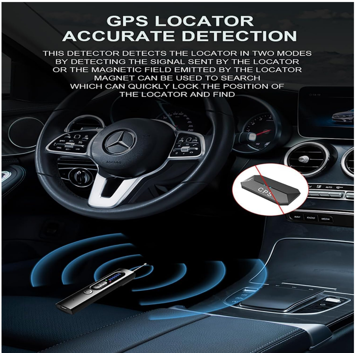
Image: Depicts the detector's use for accurate GPS locator detection within a car, showing how it can identify both signal-emitting and magnetically attached trackers.

THIS DETECTOR DETECTS THE LOCATOR IN TWO MODES BY DETECTING THE SIGNAL SENT BY THE LOCATOR OR THE MAGNETIC FIELD EMITTED BY THE LOCATOR MAGNET CAN BE USED TO SEARCH WHICH CAN QUICKLY LOCK THE POSITION OF THE LOCATOR AND FIND