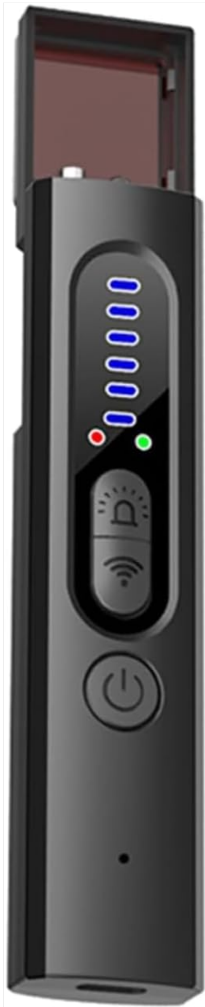
Image: The Fyzuf Hidden Camera Detector, showcasing its sleek black design and indicator lights.