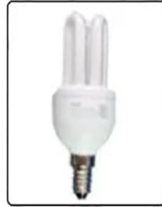
The light bulb camera