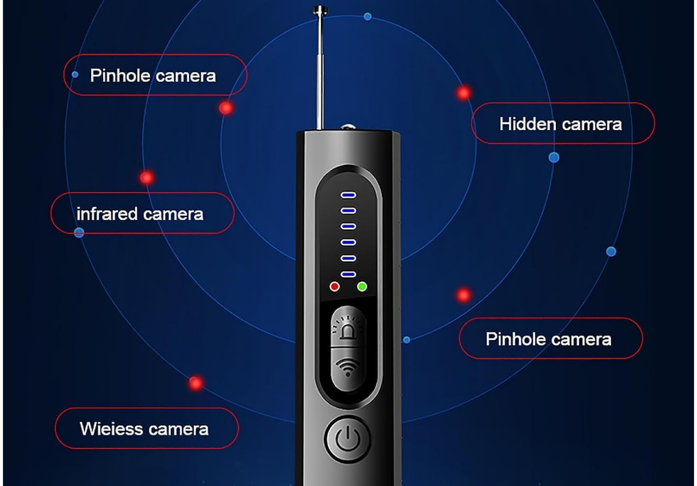
Image: Visual representation of the detector's laser detection capability, showing how it can identify various types of hidden cameras, including pinhole and infrared cameras, by reflecting light.

With military detection capability, laser detection can accurately detect all cameras, including the sleeping camera and the non-infrared flying camera that ordinary detectors cannot detect