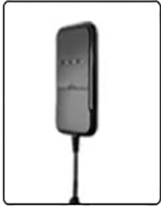
GPS positioning and tracking