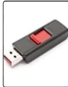
USB flash drive bug