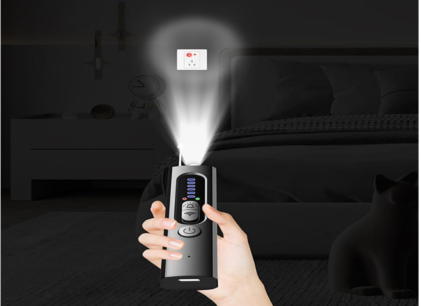
Image: Illustrates the detector being used to scan a room for hidden cameras, with the laser beam highlighting a potential camera lens.

MOVE THE INSTRUMENT UP, DOWN LEFT AND RIGHT TO SCAN THE SURROUNDING ENVIRONMENT IF THERE IS A BRIGHT SPOT FLASHING IN FRONT OF YOU, IT IS THE CAMERA