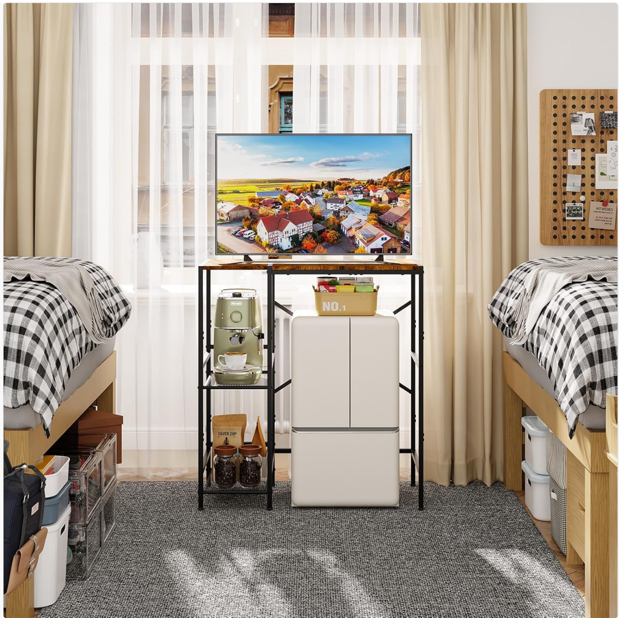
Image 6.1: The stand used in a dorm room, supporting a mini fridge and a television.