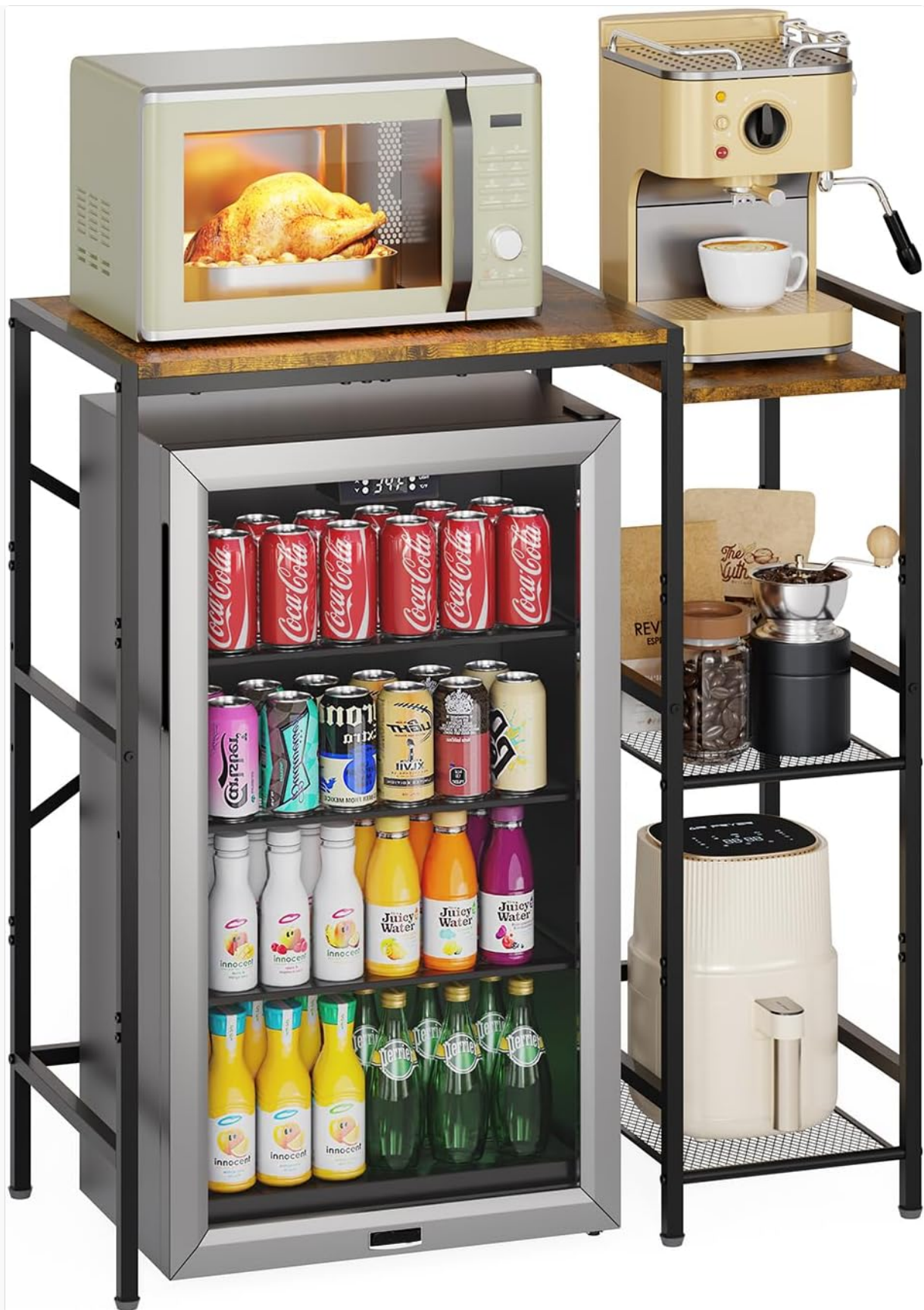
Image 1.1: The Yuyetuyo Mini Fridge Stand configured with a beverage refrigerator, microwave, and coffee station.