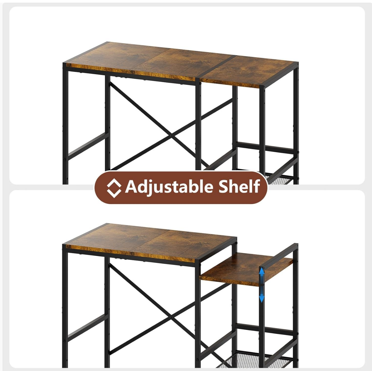
Image 5.2: The small top shelf can be lowered to adjust storage space.