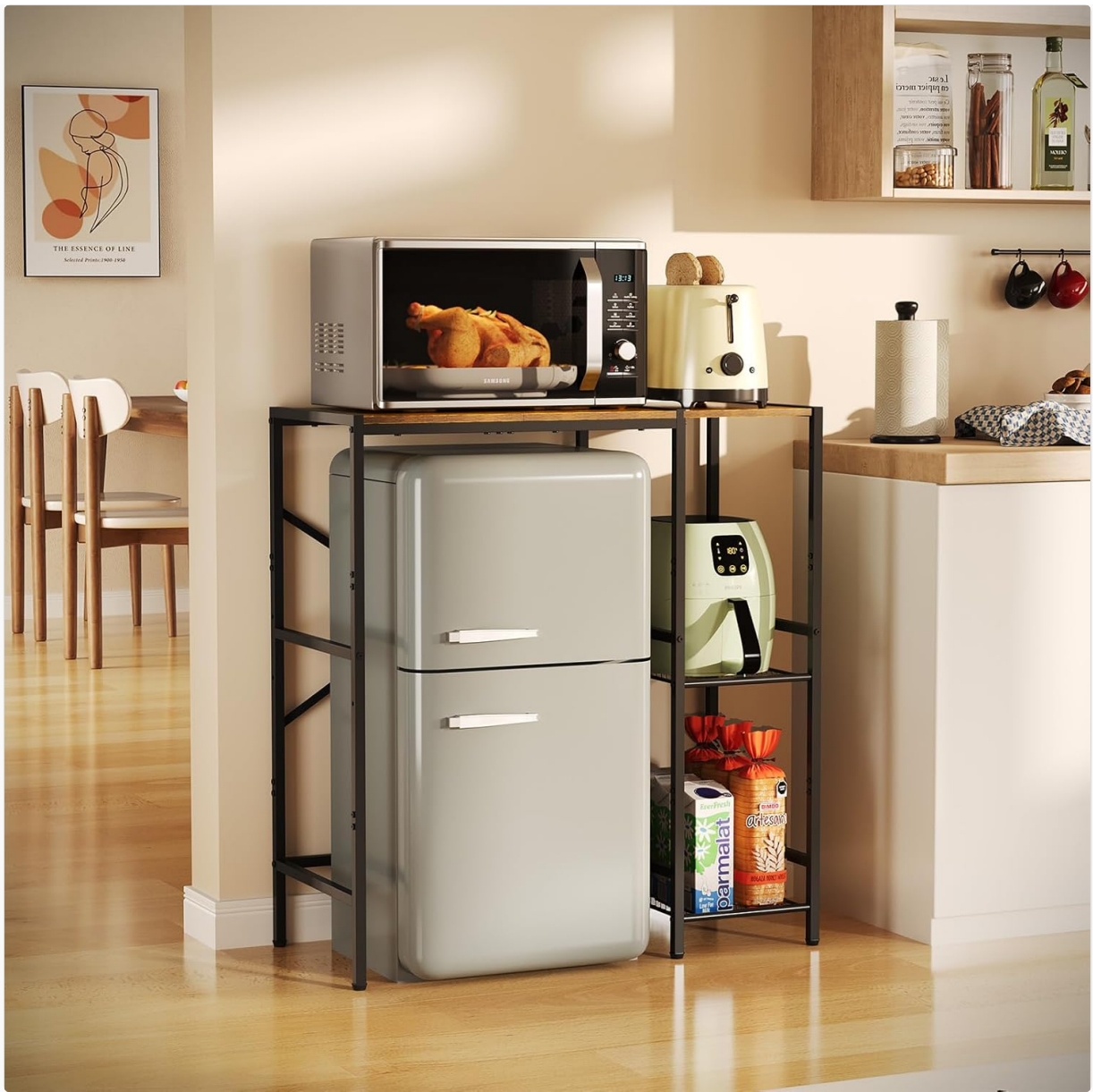
Image 6.3: The stand integrated into a kitchen space, providing storage for a mini fridge and appliances.