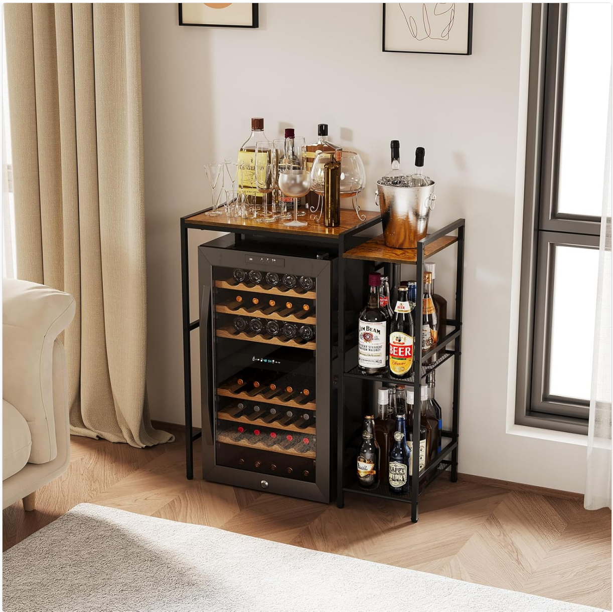
Image 6.2: The stand functioning as a wine cabinet, holding a wine cooler and various bottles.