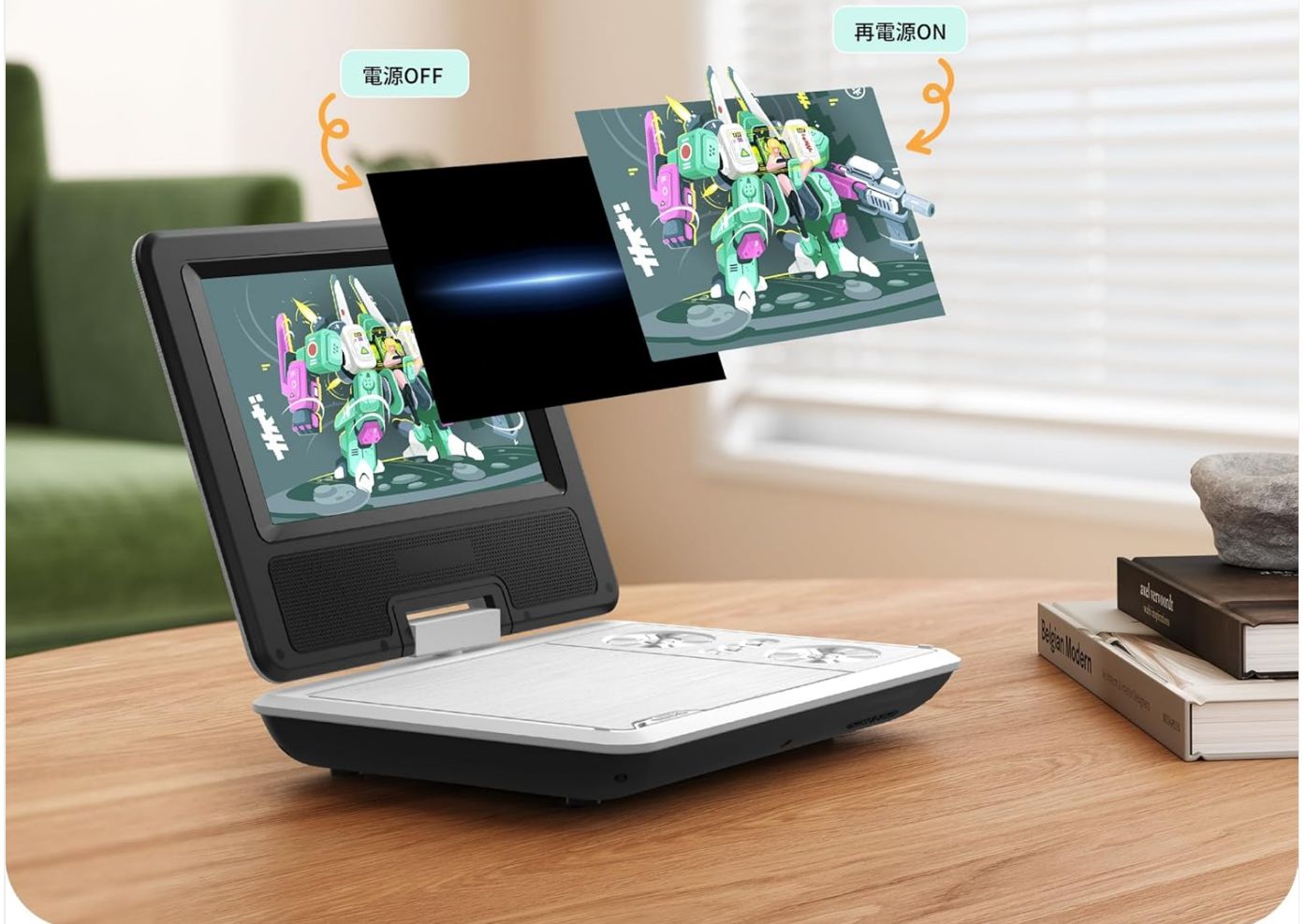
Image: Illustrates the last memory function, showing that if the power is turned off during playback, the device will resume from the last watched point when powered on again.