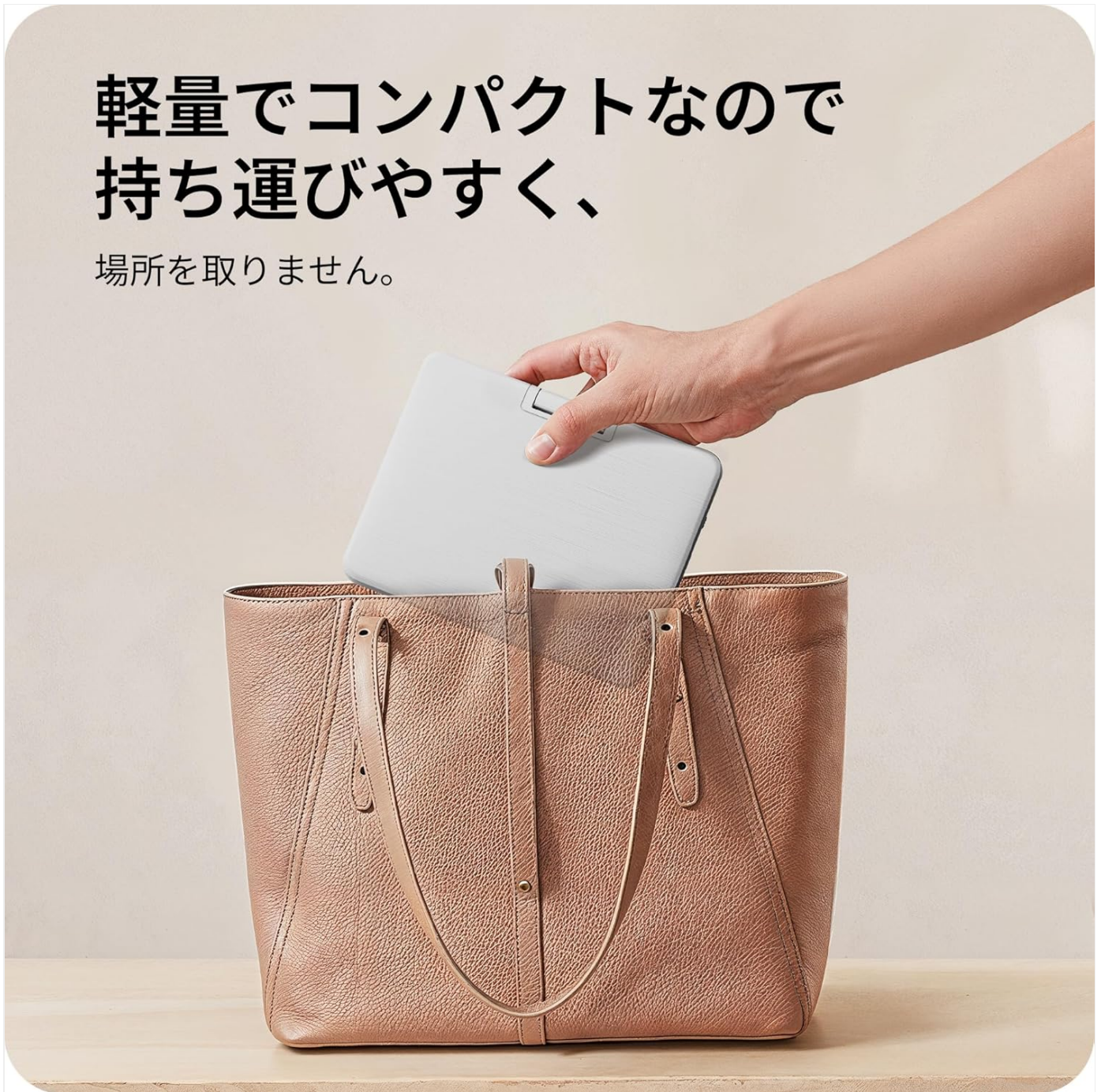
Image: The portable DVD player being easily placed into a handbag, highlighting its lightweight and compact design for portability.