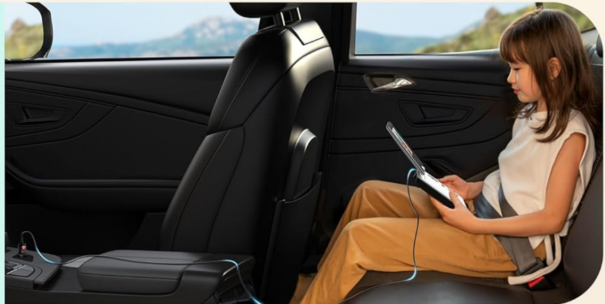
Image: Illustration of the three power supply methods: AC adapter for home use, the internal 2500mAh battery for portable use, and the car charger for in-vehicle use.

12Vのシガーソケットが付き、 長い車旅がより楽しくなる (DC9~12V対応)