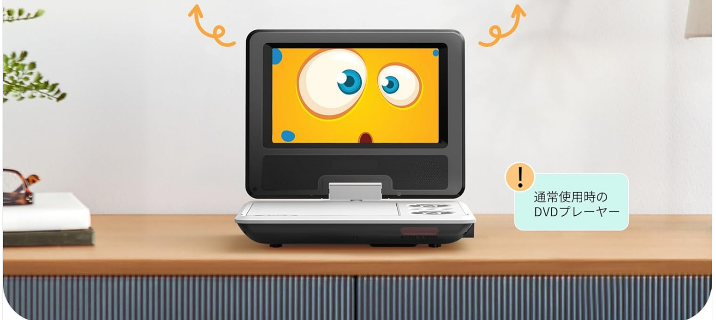
Image: Demonstrates the 270-degree screen rotation and 180-degree flip feature of the portable DVD player, allowing for various viewing angles and tablet mode.