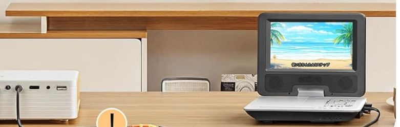
Image: Demonstrates connecting the portable DVD player to a television using the included AV cable (male) and to a projector using a separately sold AV cable (female).