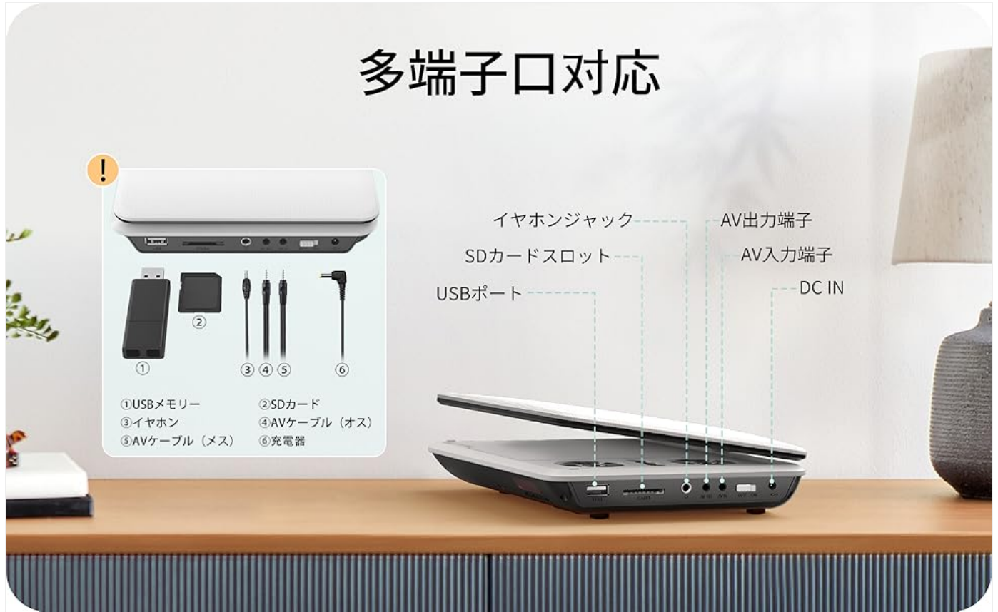
Image: Overview of the Surfola Portable DVD Player SD03, showing various ports and included accessories like USB memory, headphones, SD card, AV cables, and charger.

Familiarize yourself with the various parts and controls of your portable DVD player.