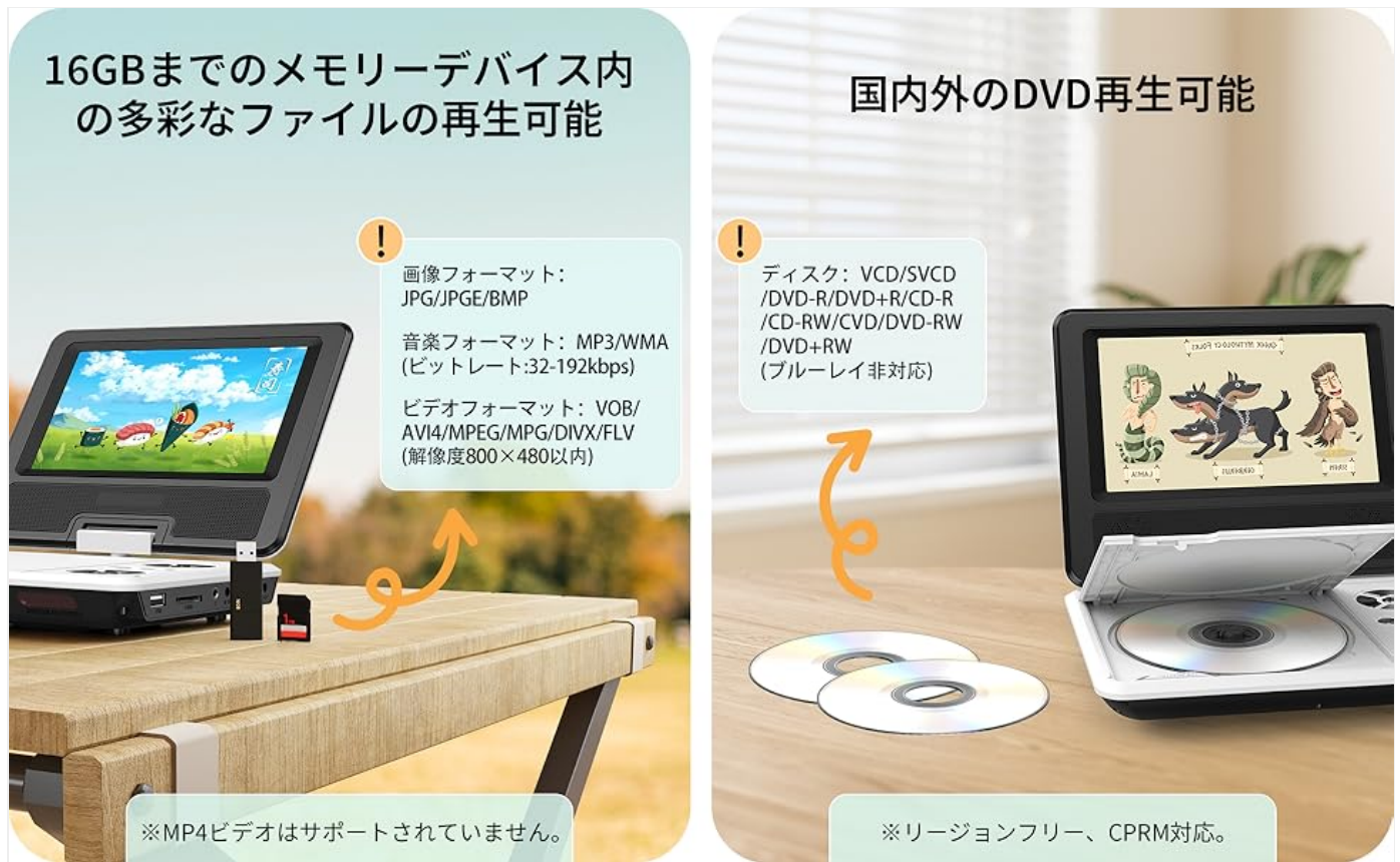
Image: Illustrates the player's capability to play various files from USB/SD cards up to 16GB, and its compatibility with domestic and international DVDs (region-free, CPRM compatible), excluding Blu-ray.