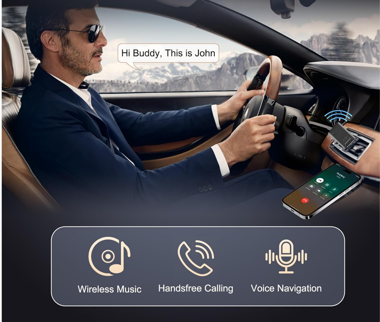
Image 5.1: The adapter enables clear hands-free calling, wireless music, and voice navigation for safer driving.