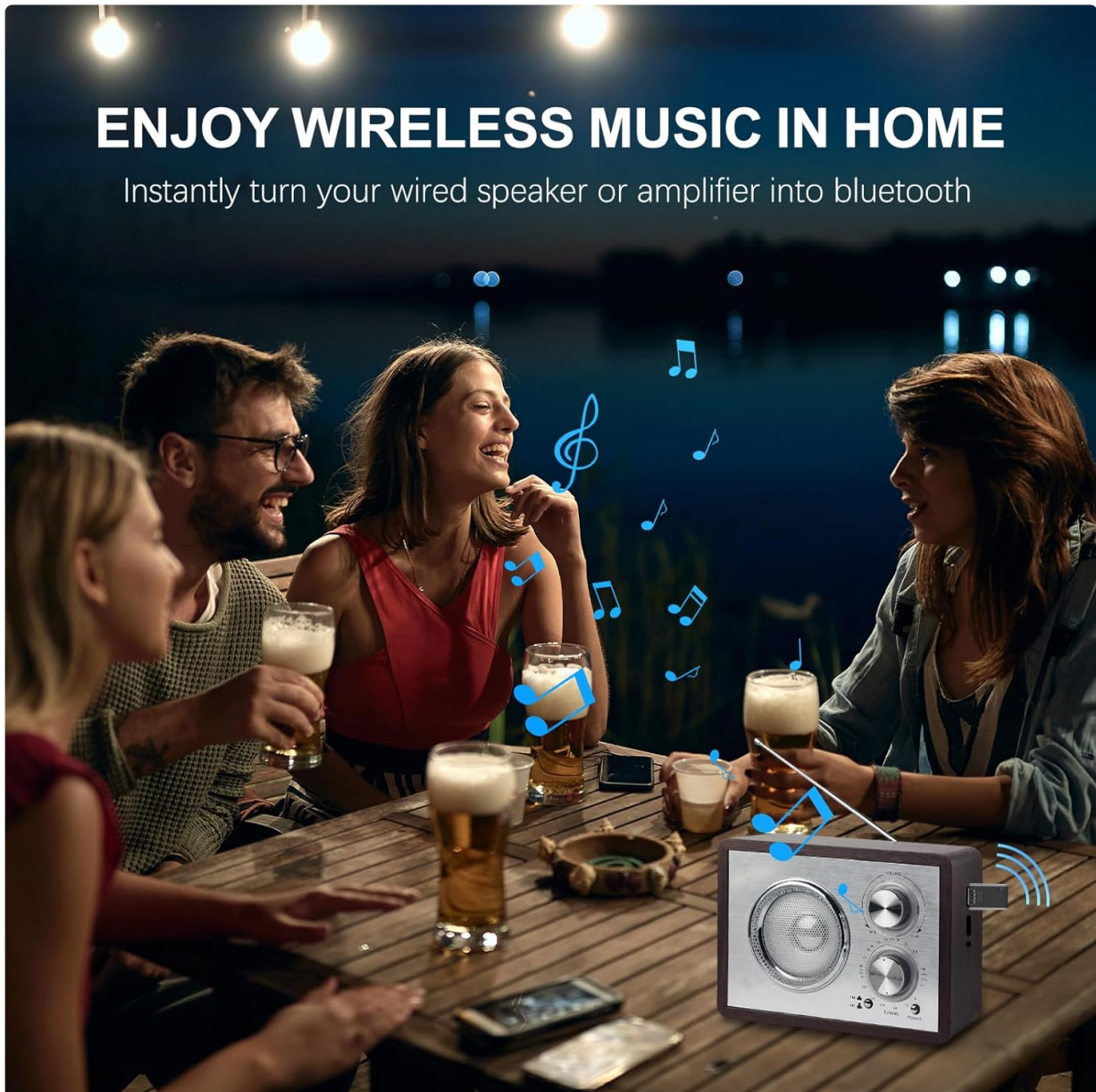
Image 6.1: The adapter allows for wireless music enjoyment in home environments.

The Bysimilai Bluetooth adapter can also transform your traditional home audio equipment into a wireless streaming system. Simply connect the adapter to a USB power source and the 3.5mm AUX input of your home stereo or wired speakers. Pair your mobile device as described in the Setup Instructions, and enjoy wireless music throughout your home.