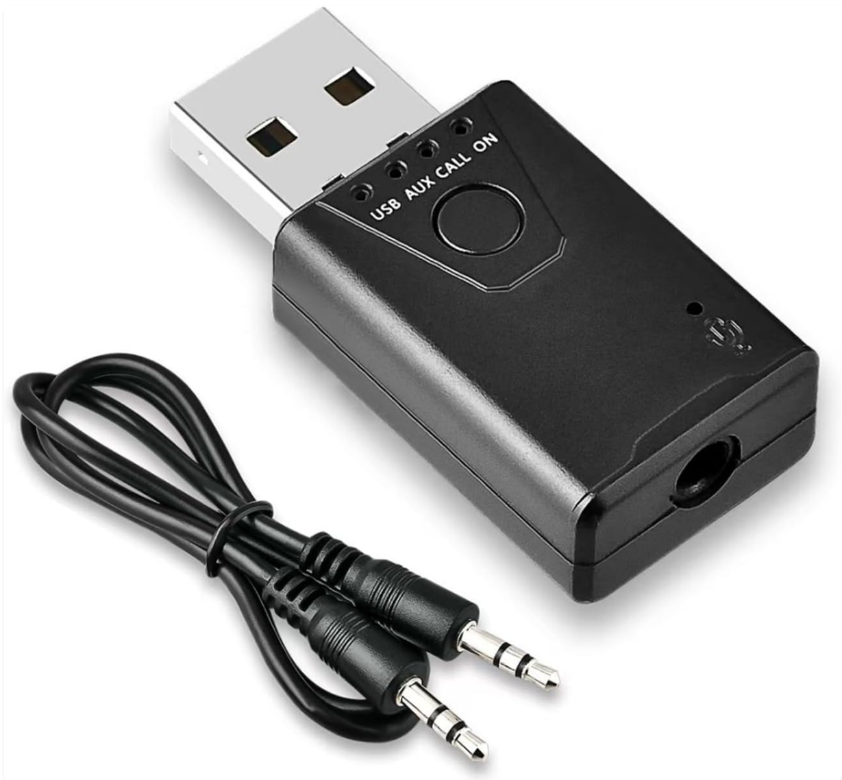
Image 1.1: The Bysimilai USB Bluetooth 5.4 Adapter with its included 3.5mm AUX cable.