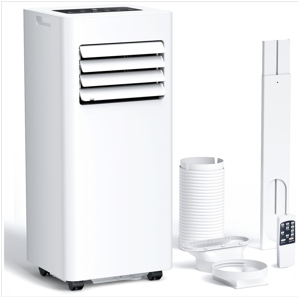
Image showing the main unit, exhaust hose, window panel kit, and remote control.

Familiarize yourself with the components of your ZAFRO Portable Spot Air Conditioner.