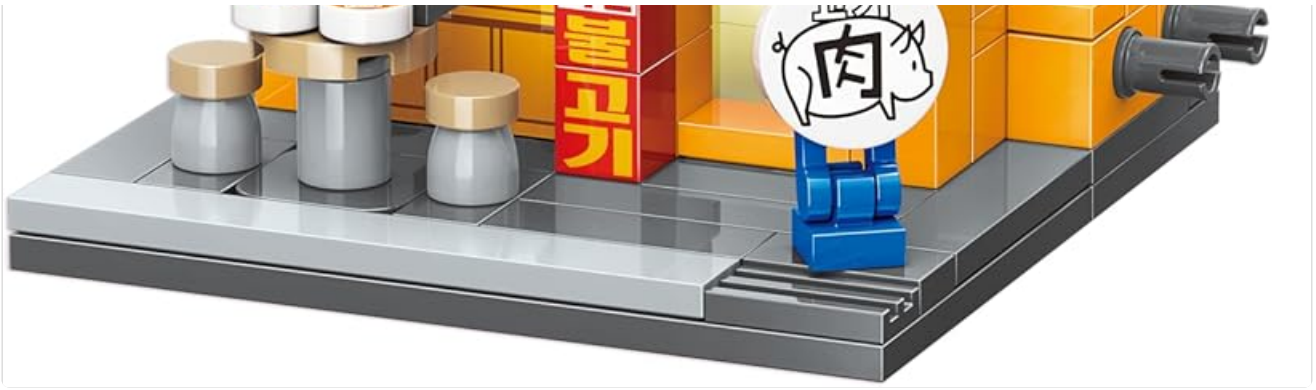
Image 1: Front view of the assembled Korean Barbecue Restaurant. This image illustrates the overall appearance and front details of the completed model, including the main entrance, windows, and various decorative elements.