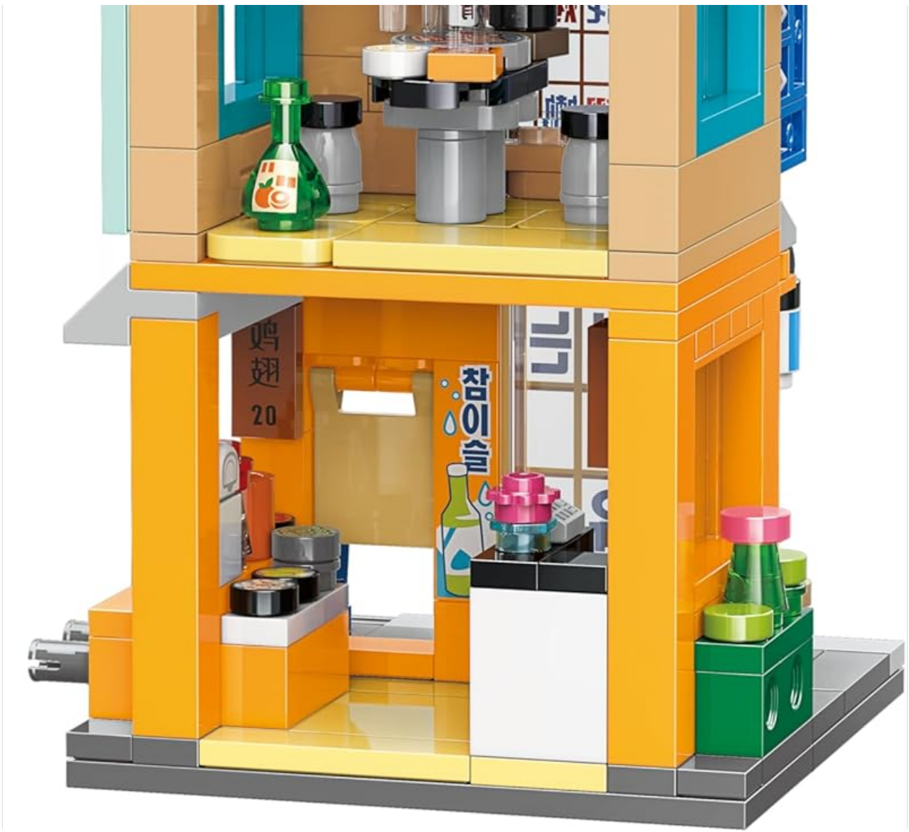
Image 2: Rear view of the assembled Korean Barbecue Restaurant. This image provides a perspective of the back of the model, highlighting interior elements and structural details not visible from the front.