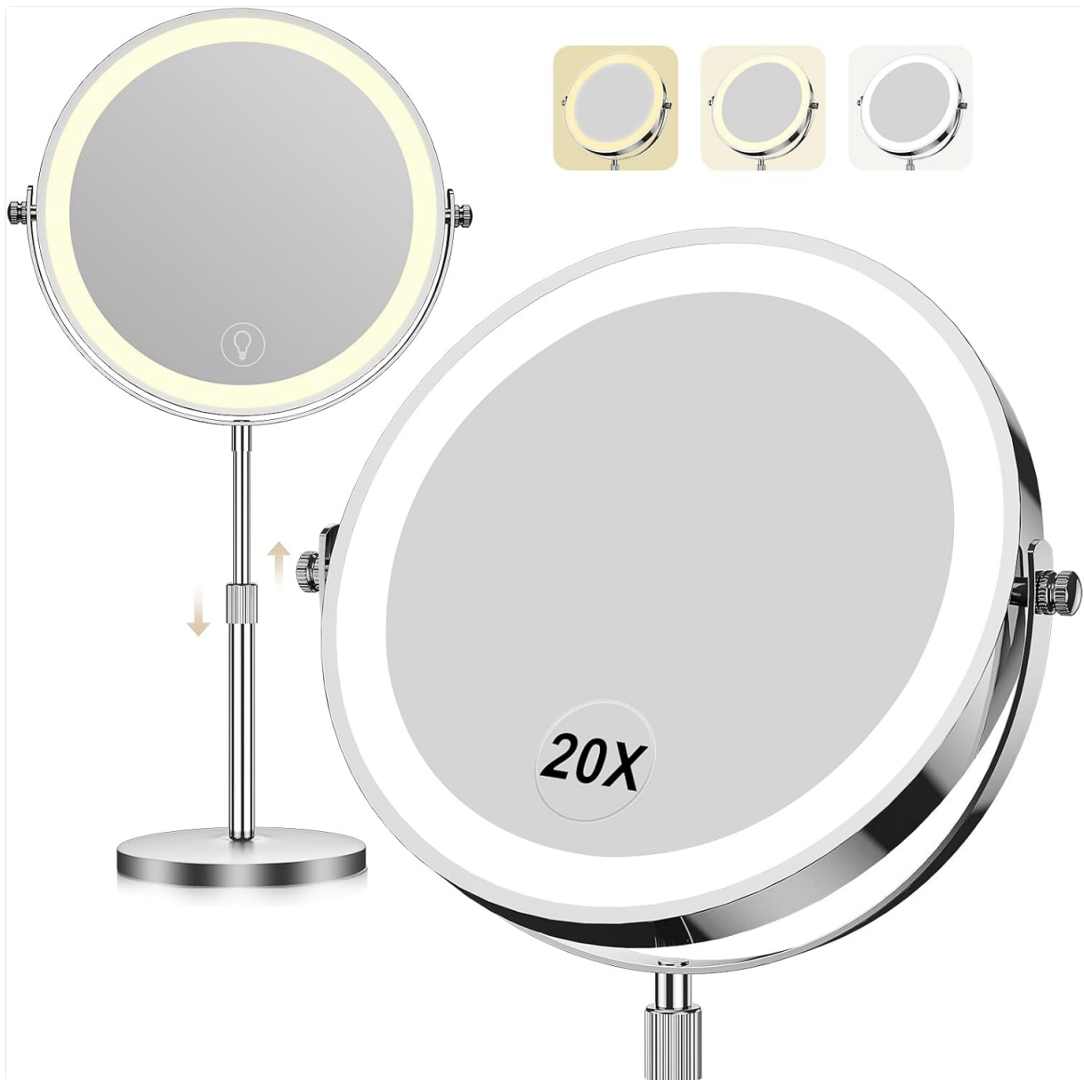
Image 1: Dienmern MM-01 Makeup Mirror with Lights, showing both 1x and 20x sides and light color options.