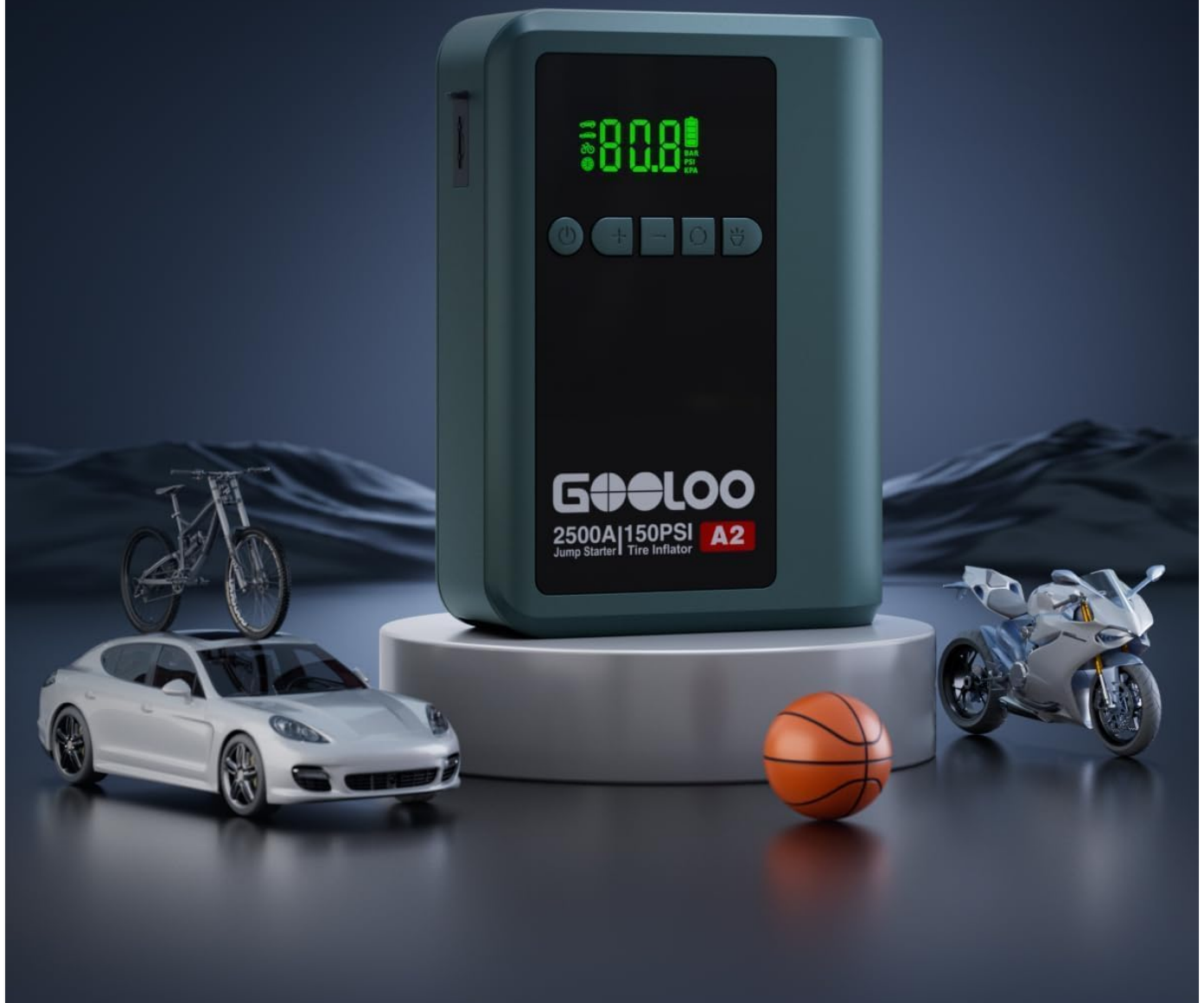
Figure 6: Visual representation of the GOOLOO A2's inflation capacity for various items, including car tires, motorcycle tires, bicycle tires, and balls.