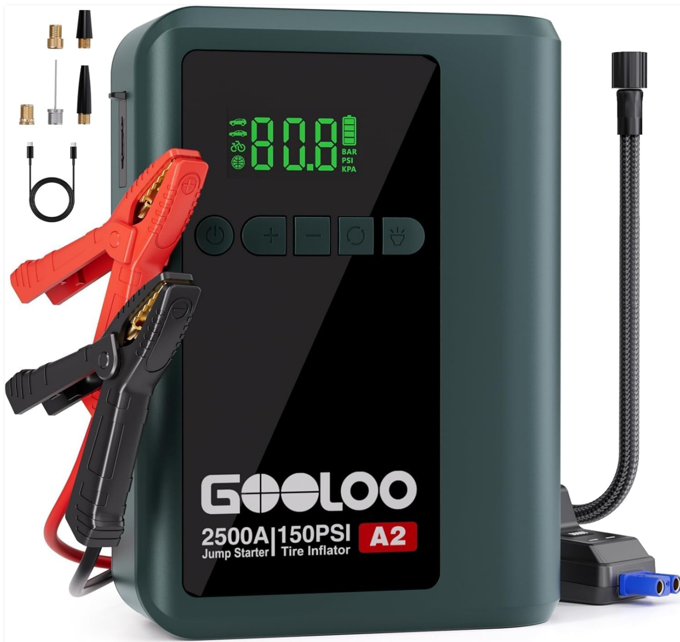
Figure 1: The GOOLOO A2 8-in-1 Jump Starter with Air Compressor, showing the main unit, jump cables, and various inflation nozzles.