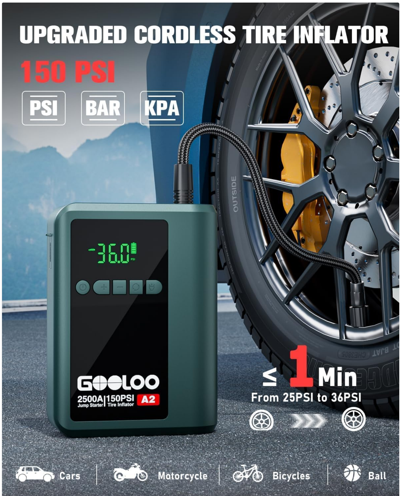
Figure 5: The GOOLOO A2 inflating a car tire, highlighting its cordless operation and 150 PSI capability.