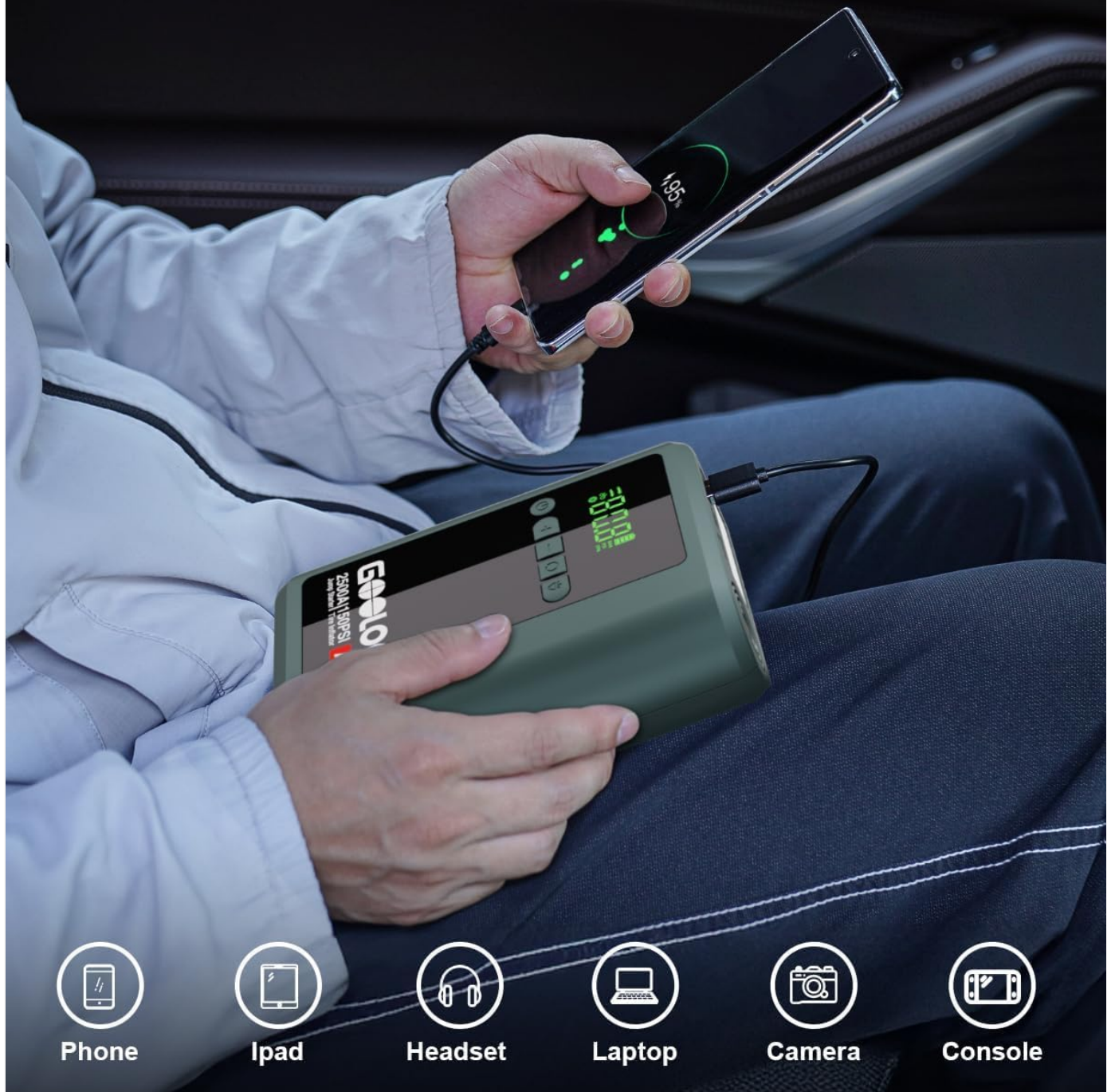
Figure 7: A person using the GOOLOO A2 to charge a smartphone, illustrating its function as a portable power bank for various devices.

Never run out of battery again, power up on the go