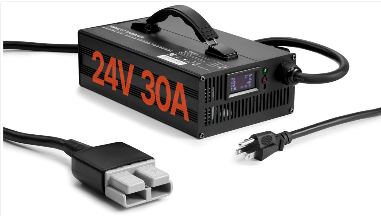
Image: A detailed view of the Happybuy charger, showing its dimensions (8.98 in / 228 mm length, 5.28 in / 134 mm width, 3.15 in / 80 mm height) and the included Anderson plug and standard power plug.