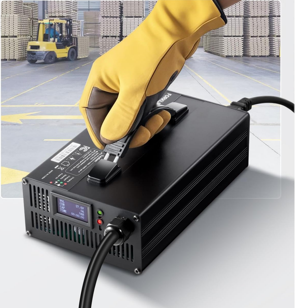
Image: A close-up view of the Happybuy charger, highlighting its widened handle designed for easy and comfortable carrying, with a forklift visible in the background.