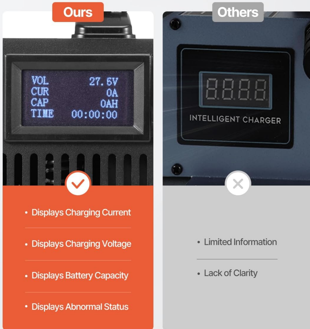
Image: A comparison showing the detailed information provided by the Happybuy charger's 1.3-inch OLED display (voltage, current, capacity, time, abnormal status) versus a generic charger's display with limited information.