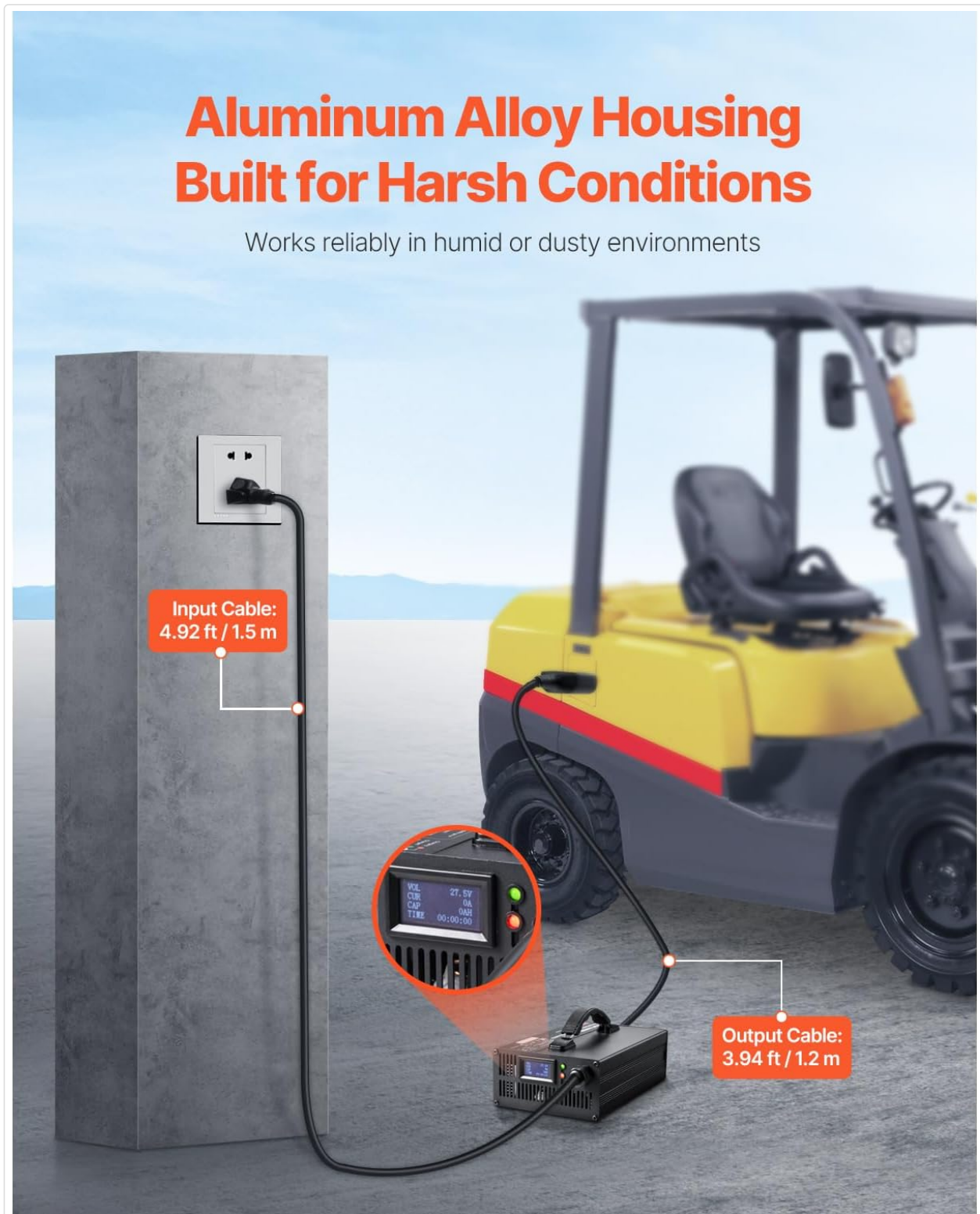
Image: The Happybuy charger in operation, showing its input cable connected to a wall outlet and its output cable connected to a forklift battery. The image also indicates the cable lengths: Input Cable 4.92 ft / 1.5 m and Output Cable 3.94 ft / 1.2 m.